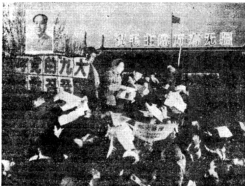
Armymen and civilians in the capital throng the streets to eagerly read the Press Communiqué on the opening of the Ninth National Congress.

Tien An Men Square was brightly lit. Marching forward with giant strides, the contingents of paraders held high big embroidered portraits showing Chairman Mao in different revolutionary periods which were a vivid reflection of the glorious and militant path traversed by the whole Party, the entire army and the people of the whole country under the leadership of the great leader Chairman Mao. These portraits brought to the mind's eye scenes of storms over the Hsiangkiang River, roaring waves on Nanhu Lake, sparks in the Ching kang Mountains, lamplight shining all night in the Yen an cave, the first five-star red flag hoisted over Tien An Men Square and the earth-shaking big-character poster Bombard the Headquarters . It is Chairman Mao who, at every crucial juncture in the path of the momentous Chinese revolution, led us in overcoming every difficulty and hardship and bringing about a new revolutionary situation.