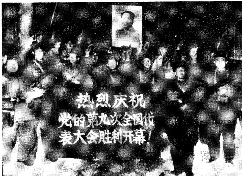
When the extra good news of the convening of the congress reached the Chen-pao Island area, Heilungkiang Province, commanders and fighters of the Chinese frontier guards at this advanced post of the anti-revisionist struggle cheered with exhilaration: "Long live Chairman Mao!" "Long live the Communist Party of China!"

When the glad tidings reached the "Red First Company" of one engineering corps unit under the Nanking Military Area Command, the whole company's cadres and fighters took a solemn oath before Chairman Mao's portrait: You have personally set up the first engineering company of our army when you led the Workers' and Peasants' Red Army to Anyuan in 1930. Your brilliant thinking is our life-blood, your revolutionary line our life-line. We will always be loyal to you.