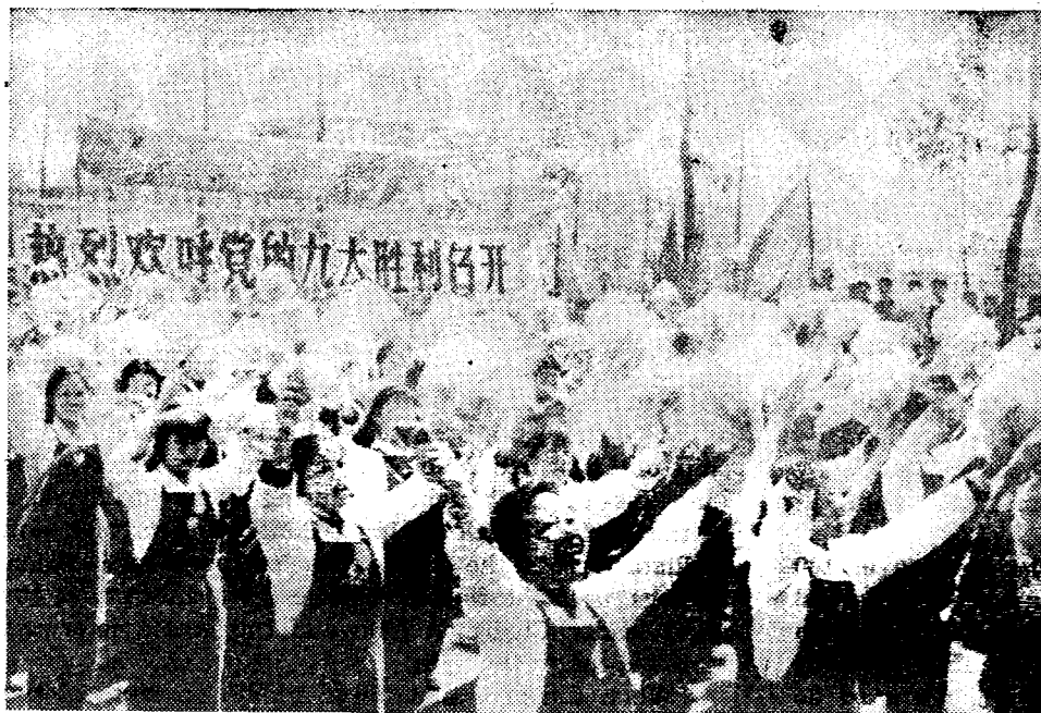
Revolutionary workers of the Chengtu Locomotive and Rolling Stock Plant in Szechuan Province sing and dance in celebration of the grand opening of the congress.

past few days, a joyous scene prevailed throughout the P.L.A. units stationed all over China — from barracks to naval harbours, airfields, artillery positions and frontier posts. The P.L.A. commanders and fighters solemnly pledged: Chairman Mao, Chairman Mao! We revolutionary fighters, whose hearts are turned to the Party, will always remain loyal to you!