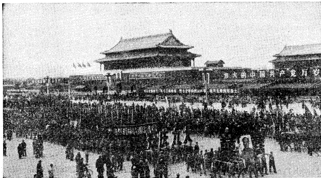
Armymen and civilians in the capital warmly celebrate the victorious opening of the Party's Ninth National Congress. Columns of paraders surge through Tien An Men.

Full of revolutionary ardour, the broad masses of commanders and fighters of the P.L.A. ground, naval and air forces hailed the opening of the congress. The general departments of the P.L.A., the Science and Technology Commission for National Defence, the Office of National Defence Industry, the various services and branches of the P.L.A. and the leading organ of the P.L.A. units under the Peking Command have all held big rallies or parades since April 1. In the