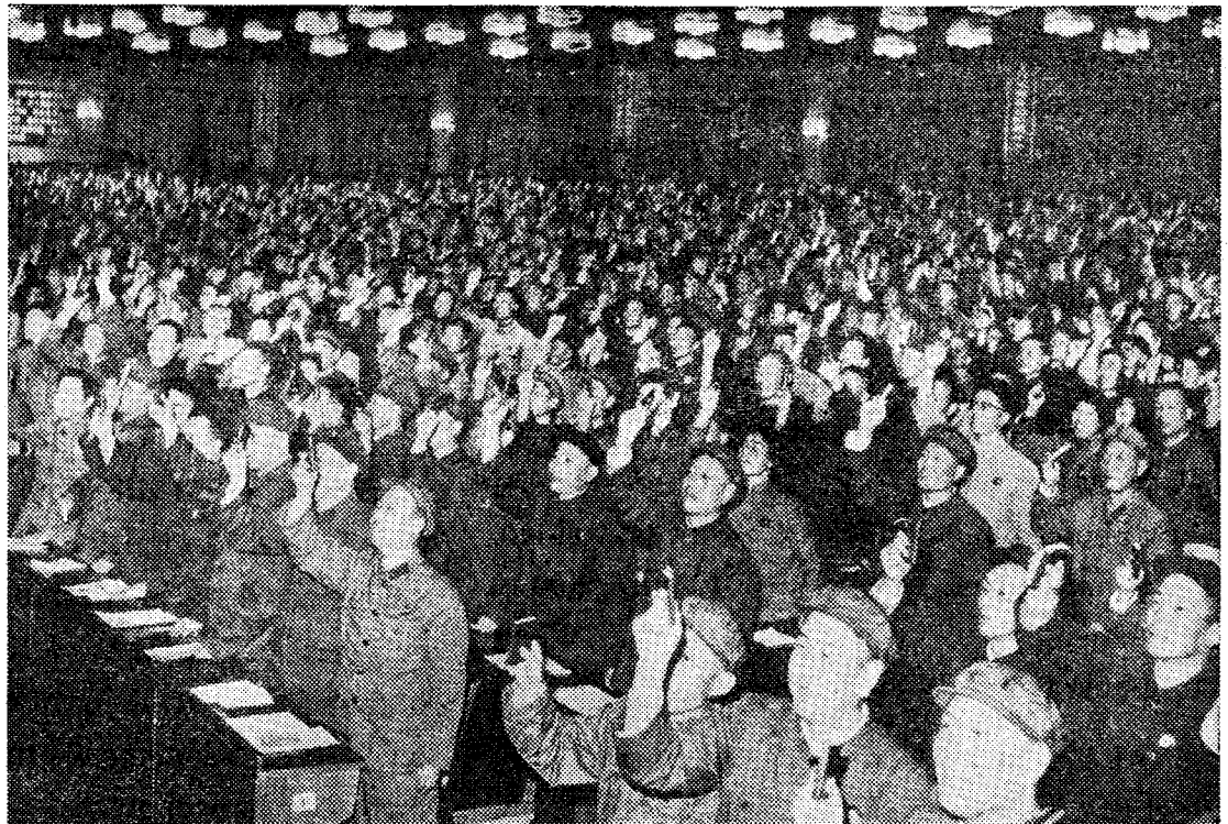
The delegates unanimously adopted the political report made by Vice-Chairman Lin Piao on behalf of the Central Committee of the Communist Party of China and unanimously adopted the Constitution of the Communist Party of China