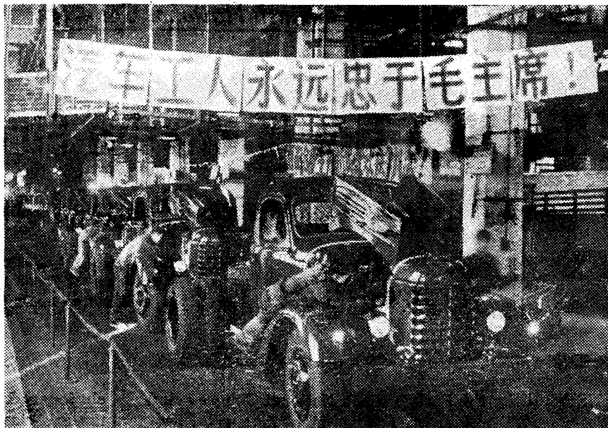
Revolutionary workers in the general assembly workshop of the Changchun No. 1 Motor Vehicle Works assembling trucks in honour of the Party's Ninth National Congress.

The revolutionary committees at all levels in Peking and the workers' and P.L.A. men's Mao Tsetung Thought propaganda teams which have entered the sphere of the superstructure have organized different