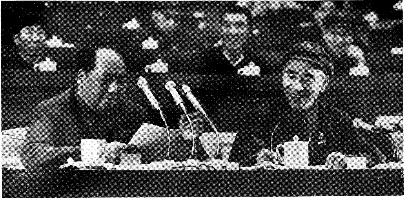
Our great leader Chairman Mao and his close comrade-in-arms Vice-Chairman Lin Piao on the rostrum