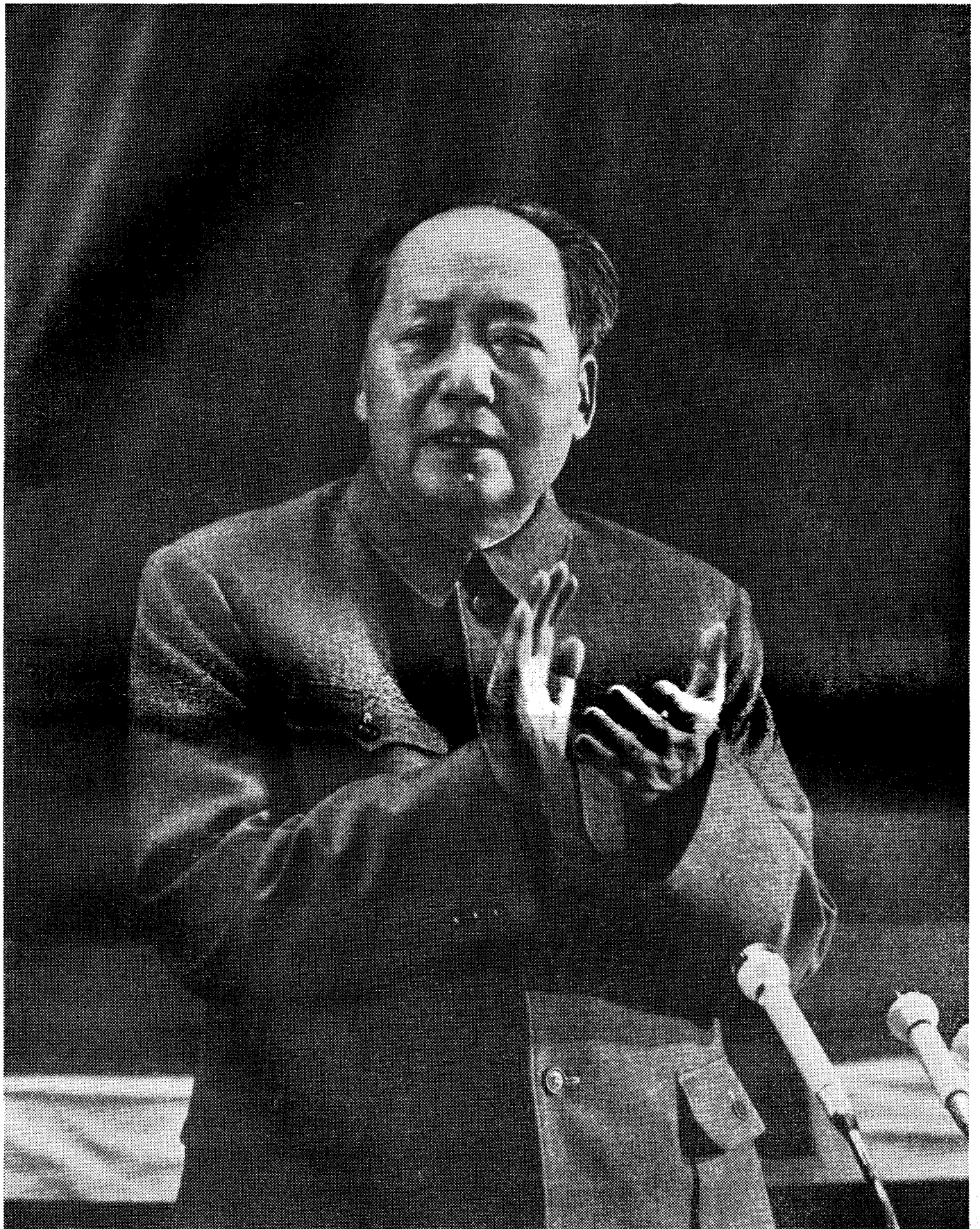
Our great leader Chairman Mao making an extremely important and inspiring speech at the plenary session of the Ninth National Congress of the Communist Party of China on April 14