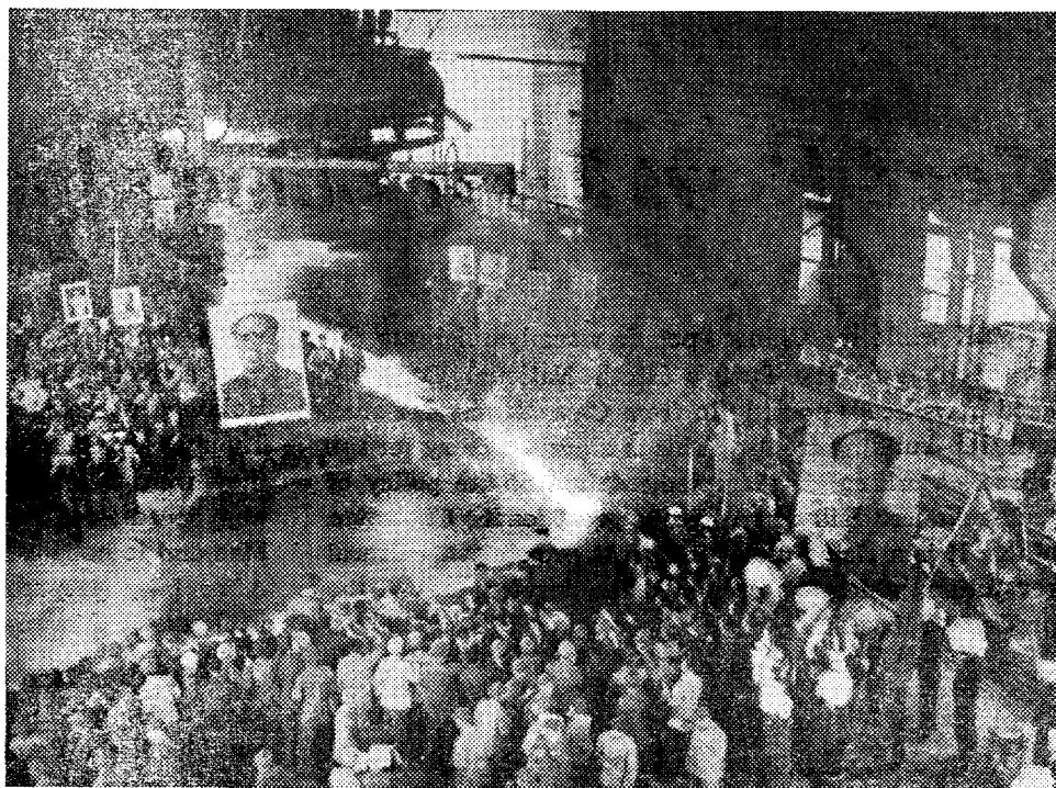
The big blast furnace built by the Wuhan Iron and Steel Company's revolutionary workers as their gift to the Party's Ninth National Congress.

Red flags flew high over the new blast furnace on April 10 and songs of triumph reverberated in the air. A huge portrait of Chairman Mao and five gleaming Chinese characters, "Long live Chairman Mao!", were put up atop the 60-metre-high hot-blast stoves. Tens of thousands of revolutionary workers, P.L.A. commanders and fighters helping the Left and representatives of workers from Wuhan factories, mines and other enterprises concerned gathered there at a grand celebration rally. Amid extremely enthusiastic cheers, the rally adopted a message of salute to our great leader Chairman Mao and his close comrade-in-arms Vice-