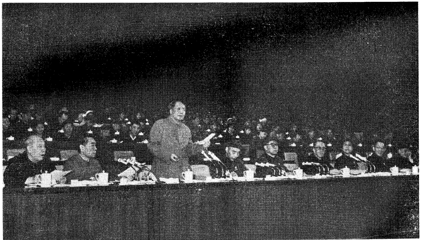
Our great leader Chairman Mao presiding over the session