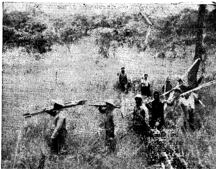
Chinese and Zambian workers and technical personnel go into the grassland and jungle where they survey throughout the daylight hours despite hardship and fatigue.

The grass in many places in the vast jungle areas grows taller than a man, and thorny bushes are in profusion. The Chinese personnel and the Tanzanian and Zambian workers battled side by side, hacking their way through the jungle and bushes, quarrying rocks to build roads and cutting down trees to construct bridges. Day after day, they worked under the scorching equatorial sun and in tropical downpours. Their clothes were always soaked with sweat or rain. Indefatigably, they overcame all kinds of difficulties in their way and, step by step, completed the survey and designing of the railway.