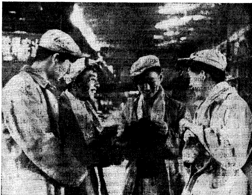
Revolutionary workers of the First Steel Works at the Anshan Iron and Steel Company, having fulfilled the production quota of the last year ahead of schedule, conscientiously sum up their experience and are resolved to win even greater victories in the new year.

Hsinkang Harbour, Tangku: After studying Chairman Mao's latest instructions and the editorial, the dockers of Tangku's Hsinkang Harbour, Tientsin, declared: We dockers shoulder glorious tasks. Working in the harbour and bearing in mind the whole country and the whole globe, we'll firmly grasp revolution and energetically promote production and deal hard blows to imperialism, revisionism