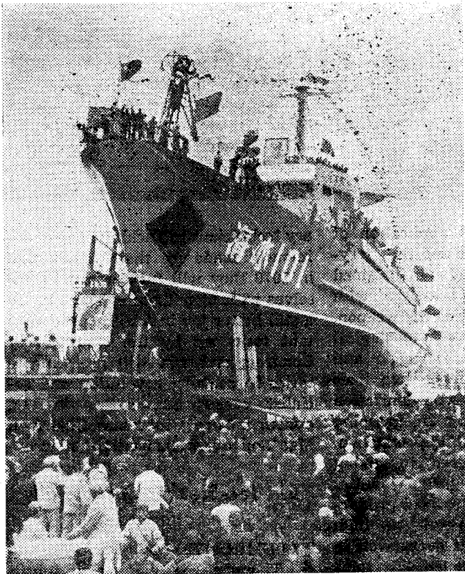
The big 3,200-ton Haibing 101 , the first Chinese designed and built ice-breaker, successfully launched in Shanghai.

main force, and revolutionary cadres and technicians. Designing and building took place simultaneously, with the former being accomplished in a little over a month.