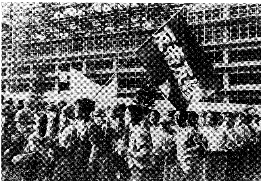
People from different walks of life in Tokyo, Japan, holding aloft the anti-imperialist, anti-revisionist banner, stage a stirring protest rally to demonstrate their resolve to crush the Japan-U.S. "security treaty."

The "heartlands" of capitalism, North America, Western Europe, Japan and Oceania, have witnessed an