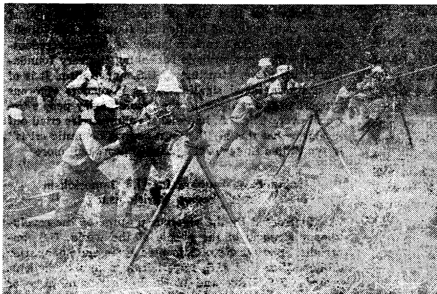
Mozambique guerrilla fighters intensify their military training, ready to hit out at the U.S. imperialists and Portuguese colonialists.

by hook or by crook their revolutionary armed struggles. But the Asian, African and Latin American peoples have not been subdued by those "new strategies" of the U.S. imperialists, or intimidated by the threats of the Soviet revisionists. On the contrary, their revolutionary struggles, their raging armed struggles in particular, have developed even more vigorously, meting out stern punishment to U.S. imperialism and Soviet revisionism. In the 1960s the revolutionary people of more than 30 countries or regions in Asia, Africa and Latin America, in defiance of the frantic suppression and sabotage by imperialism, revisionism and all reaction, rose up and waged or persisted in revolutionary armed struggles. Rolling on with irresistible force, the torrent of revolution crushed all obstacles in its way and was cleaning up the dirt left behind by im-