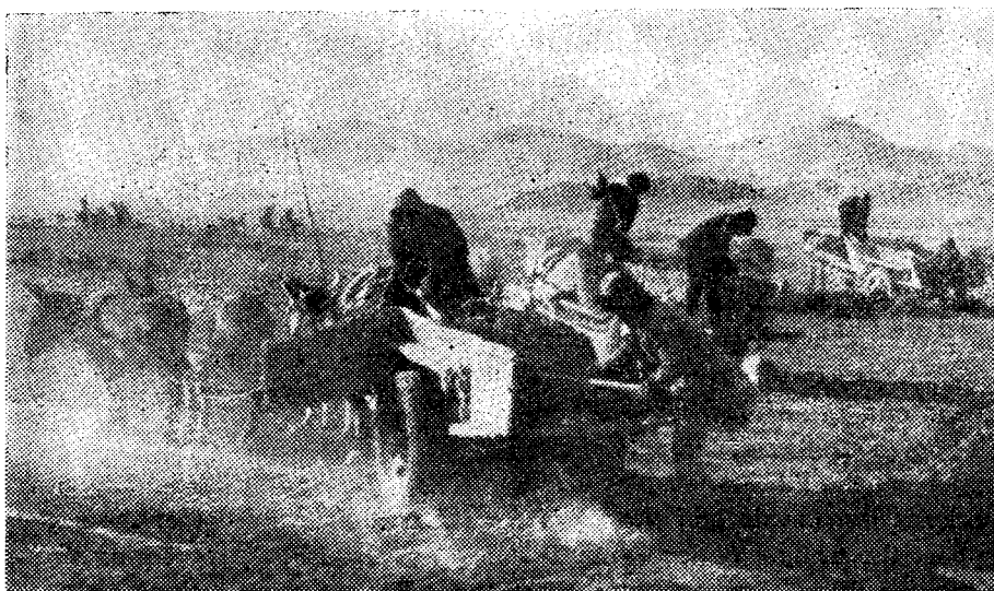
The poor and lower-middle peasants of the Paitayu Brigade in Hsingcheng County, Liaoning Province, and People's Liberation Army men supporting agriculture deliver fertilizer in cold weather, determined to win rich harvests.

Amid the high tide of preparing for spring farming, industrial, financial, trade, transport and health departments in different places send out, on their own initiative, investigation groups, mobile services and medical teams to the villages or the fields to enthusiastically work for the spring farming preparations.