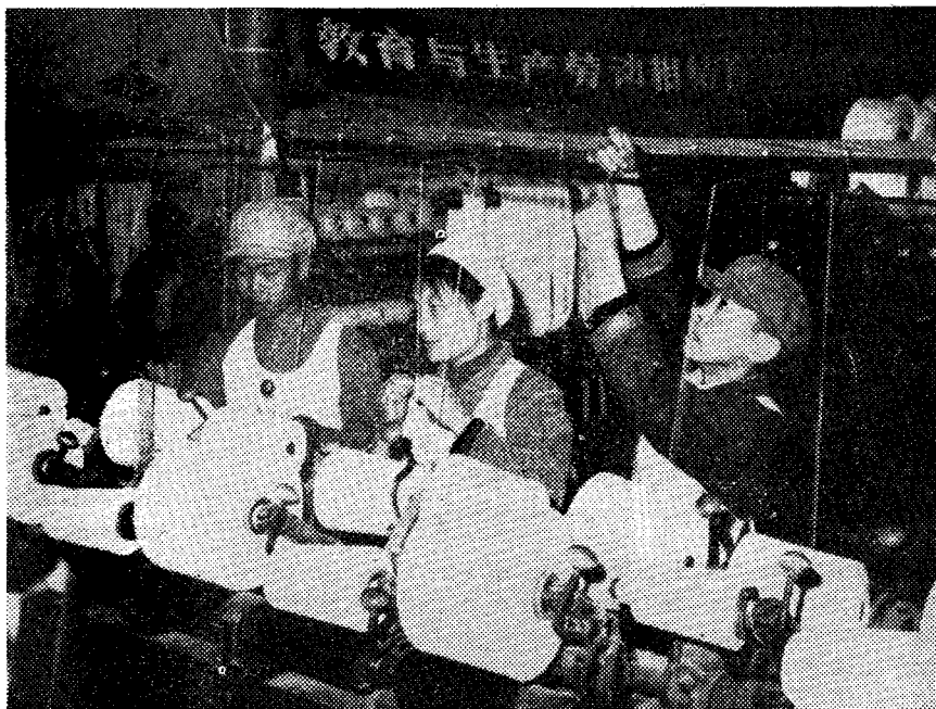
Students at the Sian No. 22 Middle School are doing productive labour in a workshop.