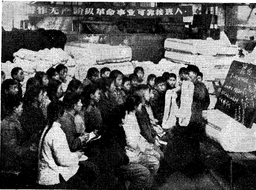
A veteran worker giving students a lesson in bleaching and dyeing at a workshop of the Sian No. 2 Silk Mill.

living way. They witnessed how the workers, in their study of Mao Tsetung Thought, strove hard to apply what they had learnt.