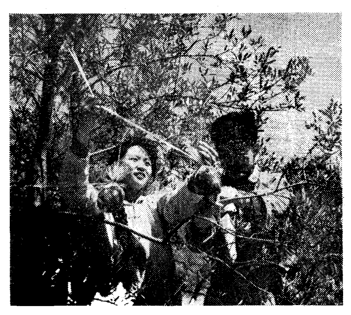
Workers of Hupeh Provincial Forestry Scientific Research Institute are nursing oil olive trees.

Albania's olive tree is a high-quality and high-yielding ligneous oil-bearing plant. One big tree can produce more than 100 kilogrammes of olives and generally 30 jin of olive oil can be pressed out of 100 jin of olives. Olive oil is not only a highly nutritious edible oil but is also widely used in medicine and in the chemical and national defence industries.