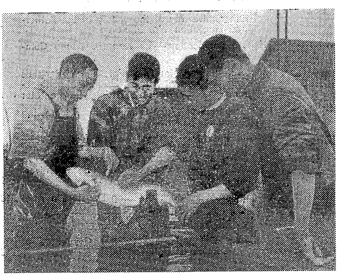
To get more fish, the Hsihu Commune does scientific fish-breeding. Commune members give female fish a hormone inoculation,

After the success of the artificial hatching, Hsihu Commune embarked on scientific experiments to get high yields from their breeding ponds. Different fish stay at different depths