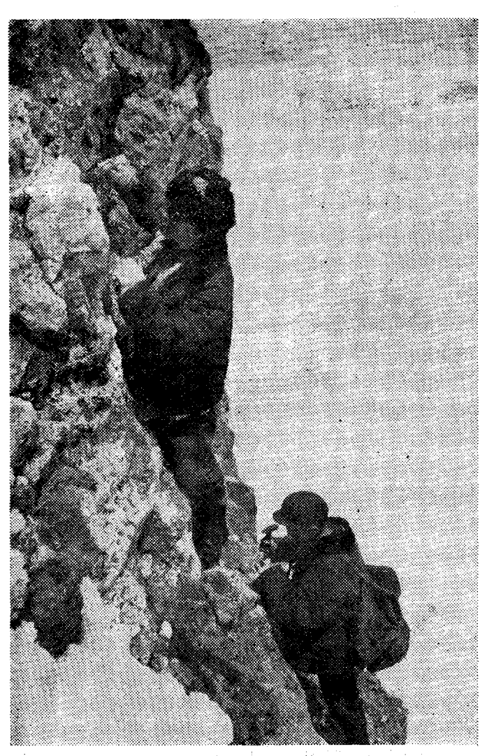
Geological team members taking rock samples more than 6.000 metres above sea level.

Expansion of the iron and steel industry has promoted the development of industry as a whole.