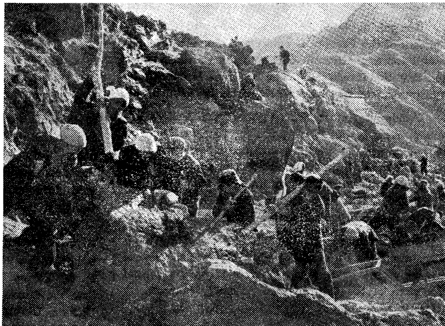
Members of the Nankunlungkou Brigade at Pingshan County in Hopei Province building farmland on a mountain.

However, the renegade, hidden traitor and scab Liu Shao-chi and his gang spared no effort to push the counter-revolutionary revisionist line, including san zi yi bao (the extension of free markets and of plots for private use, the promotion of small enterprises with sole responsibility for their own profits or losses, and