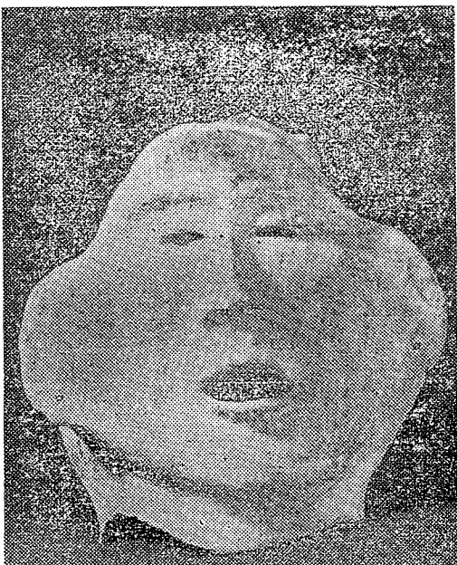
▲ A vessel lid in the shape of a human face.

CHINA has turned out in 1971 large amounts of mining and metallurgical equipment to speed up