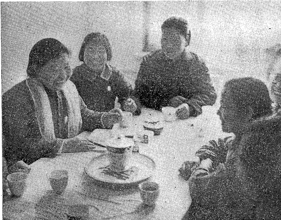
Some of the Hsinghuhahsili committee discussing work.