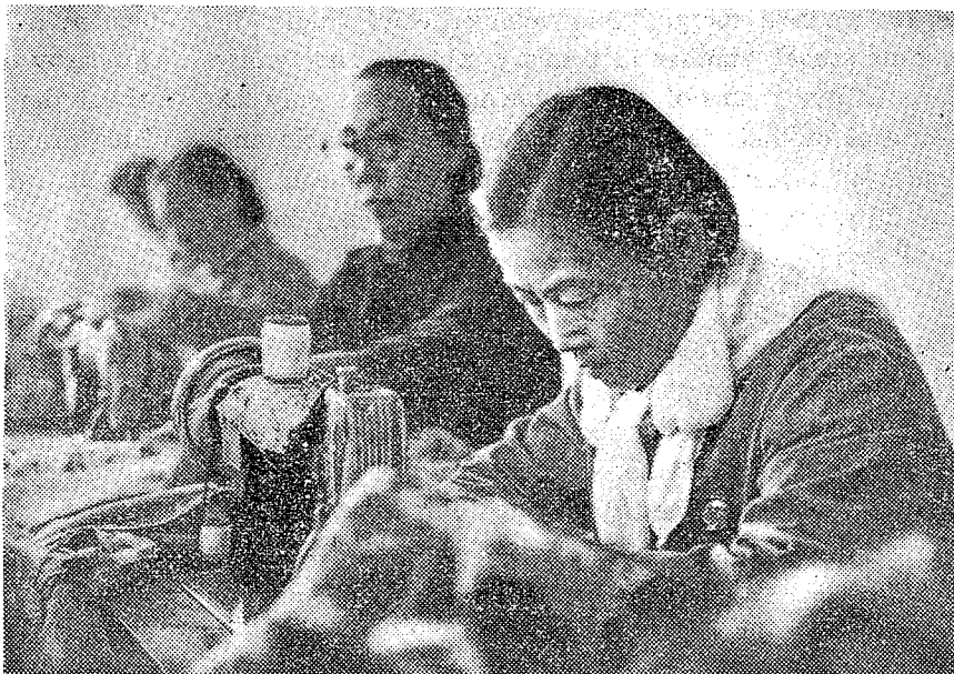
Sewing group members.