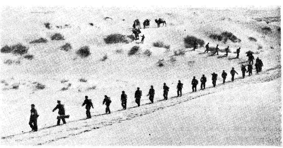
The cultural work team crossing a desert.

While performing, the members did their best to learn from the fighters, so that their thoughts and feelings were fused with those of the soldiers, thereby enabling them