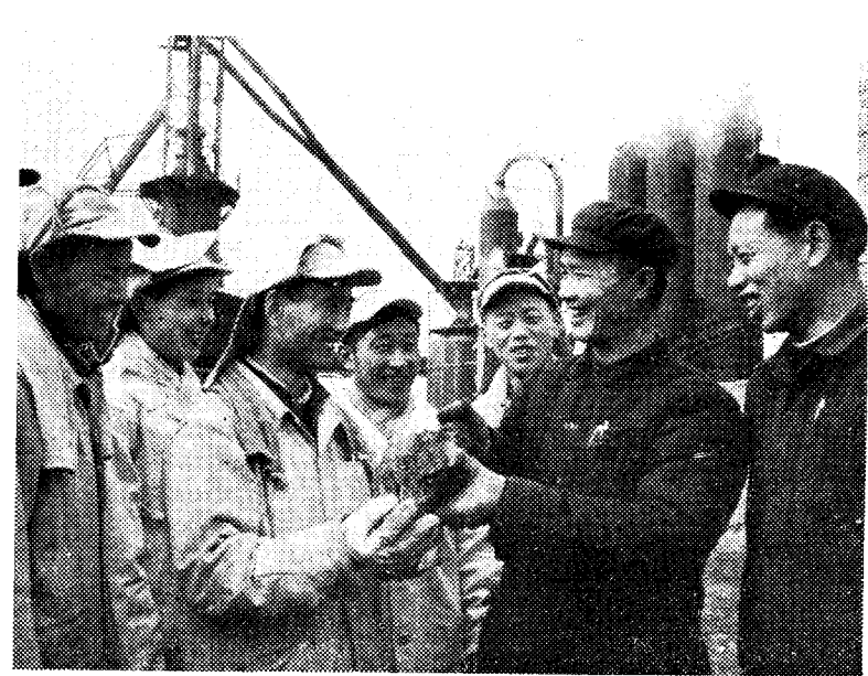
Leading members of the Party branch of an iron and steel mill in Tanyang County, Kiangsu Province, studying with workers how to improve iron smelling.

In the Cultural Revolution the masses criticized the influence of Liu Shao-chi's revisionist line and the Kiangsu people's enthusiasm for running local industries has soared. The iron and steel industry and mine-building are another example. While expanding the original mines and iron and steel mills, the local people started many small iron mines. In 1971, 19 counties and cities opened 55 small iron mines producing one-fifth of the province's iron ore. This sent steel