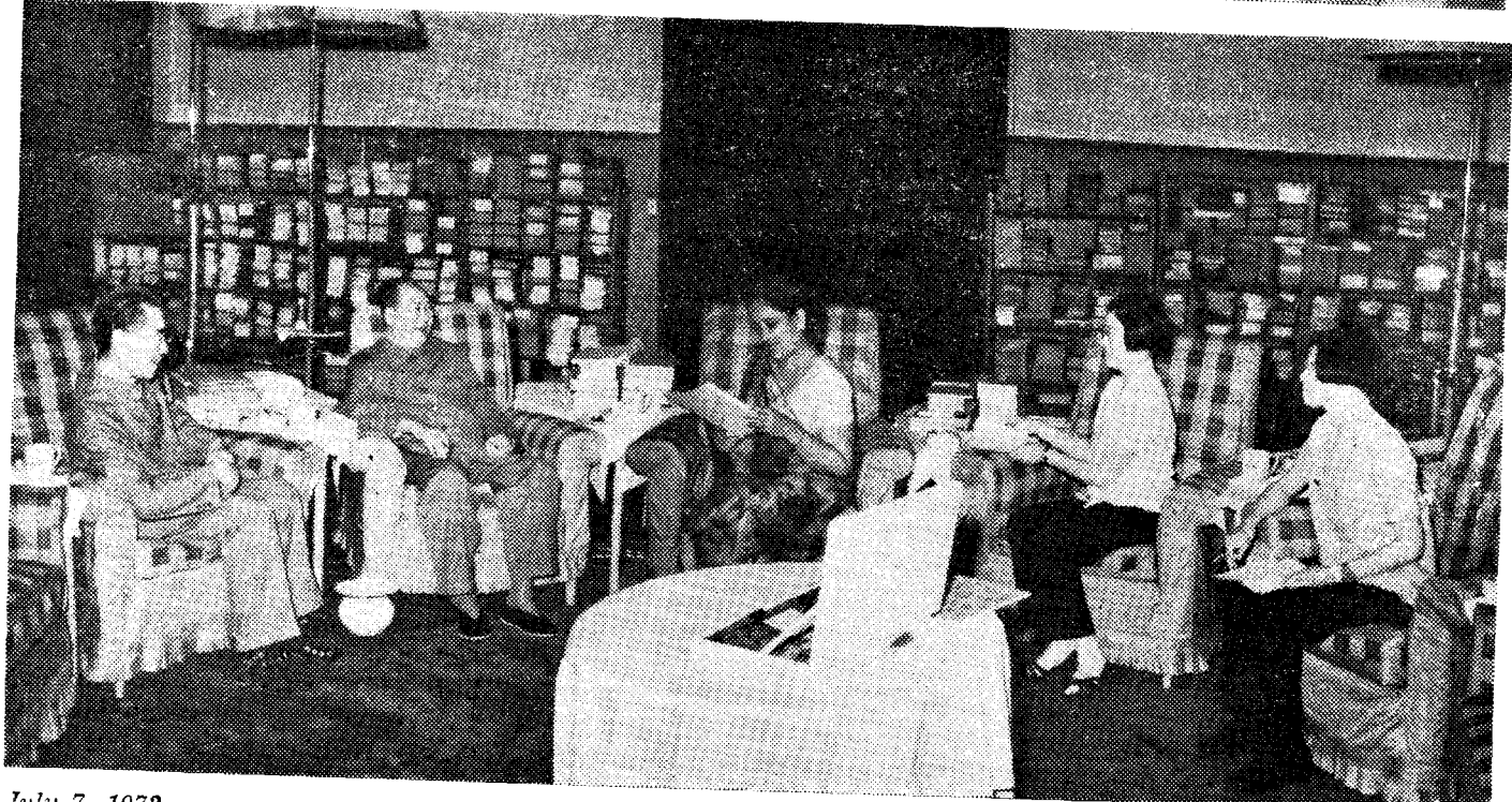
July 7, 1972