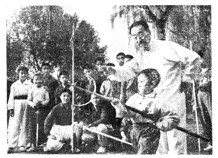
A 68-year-old competitor giving a 6-year-old entrant some tips at the 1972 National Wushu Competition.

Many youngsters performed diffi- chair. Her abdomen measured cult sets of movements showing a 183 cm. around. They made many