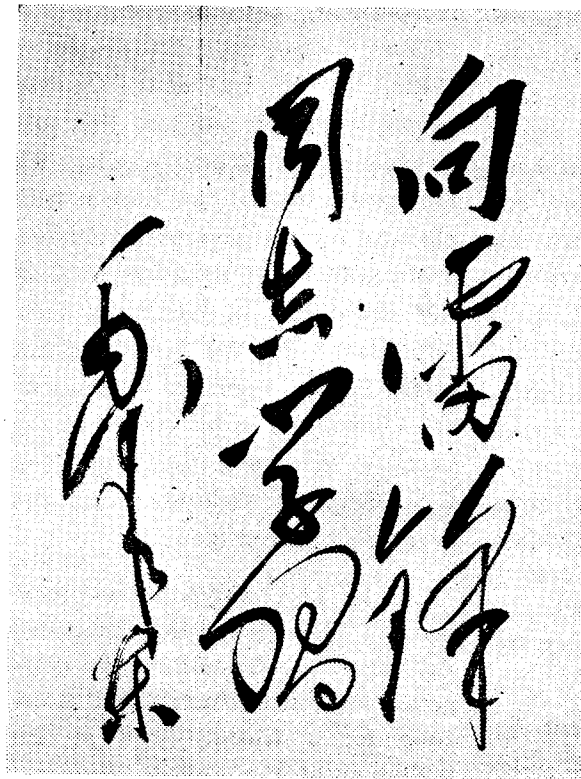
Chairman Mao's inscription.

Though he died young, Lei Feng distinguished himself by his outstanding qualities and spirit characteristic of a Communist and set an example for the nation. He seriously studied works by Marx, Engels, Lenin and Stalin and Chairman Mao's works and adhered to the revolutionary style of study—integrating theory with practice. He took a clear-cut proletarian stand and cherished the communist ideas and qualities of utter devotion to others without any thought of self and wholehearted service to the peo-