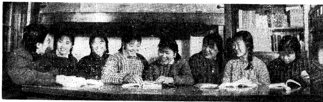
The women students' study group.

Once when Wang Liang-yin who comes from the countryside was