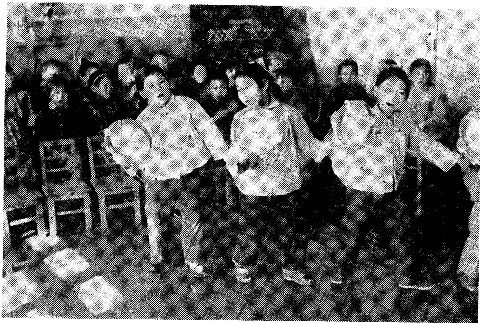
In the kindergarten of the Peking No. 3 Cotton Mill.

Portage, loading and unloading and many other jobs requiring great physical effort are given to men only in the textile industry. The state stipulates that