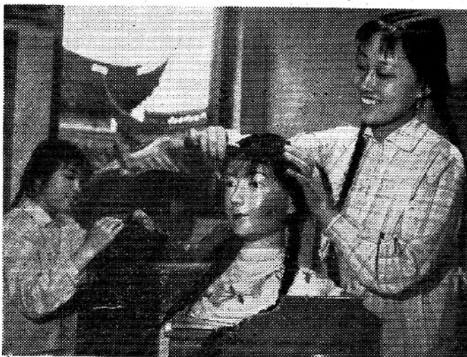
Making wigs in Yungching's workshop.

The switch from gambling paraphernalia to blind men's canes, from incense sticks and candles as offering to the gods to wigs for one-time serfs, denotes the fundamental difference between an old market-place and a new bazaar and shows the changes that have taken place since the new epoch replaced the old one.