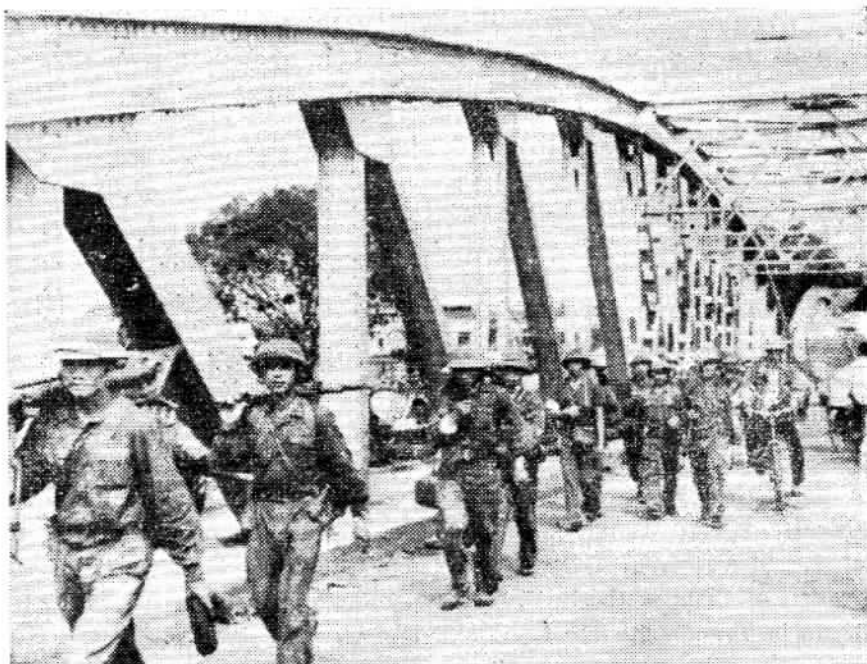
South Vietnamese liberation fighters march into the city of Hue.

Big markets in the city have all resumed business and prices are stable. Traffic is busy as usual. When night falls, the whole city is illuminated by electric lights.