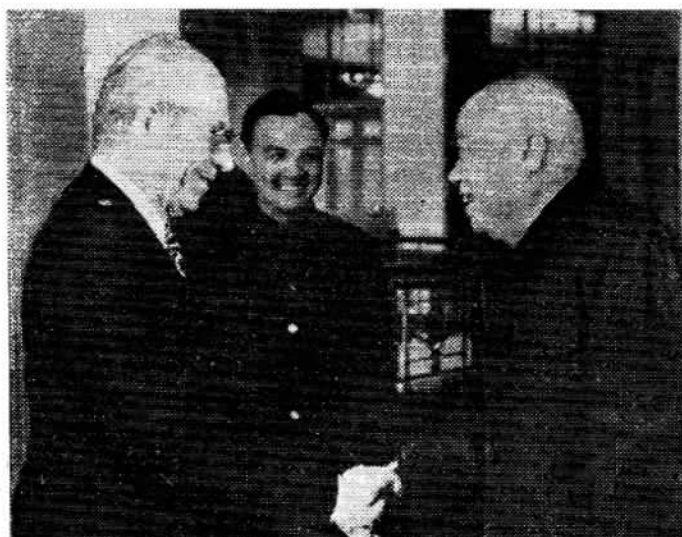
Chairman Chu Teh of the Standing Committee of the National People's Congress meets Prime Minister Nouria.

Vice-Premier Li Hsien-nien arrived in Iran on April 5 for an official visit at the invitation of Iranian Prime Minister Hoveyda.