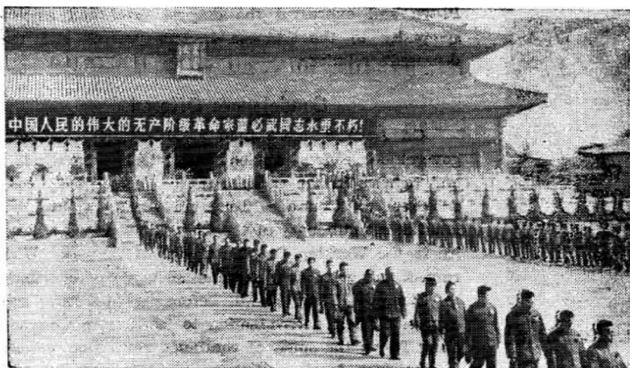
Paying last respects to Comrade Tung Pi-wu at the Working People's Palace of Culture.

zation of the Communists of Italy (Marxist-Leninist) and the Communist Party of Switzerland (Marxist-Leninist).