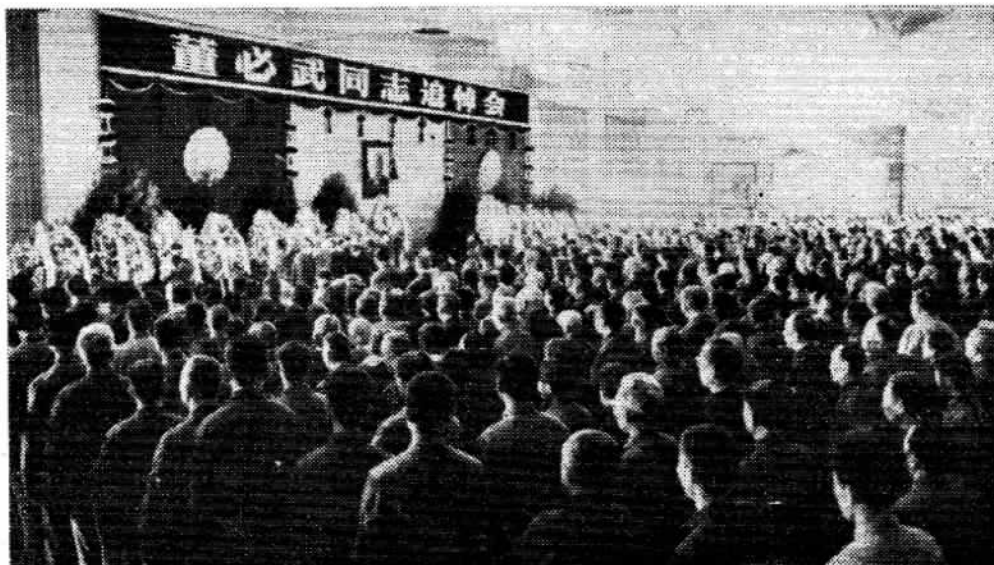
At the memorial ceremony for Comrade Tung Pi-wu.

Samdech Norodom Sihanouk, Head of State and Chairman of the National United Front of Cambodia, and Madame Sihanouk, Samdech Penn Nouth, Prime Minister of the Royal Government of National Union of Cambodia and Chairman of the Political Bureau of the Central Committee of the National United Front of Cambodia, and Madame Penn Nouth attended the ceremony to pay their last respects to the remains of Comrade Tung