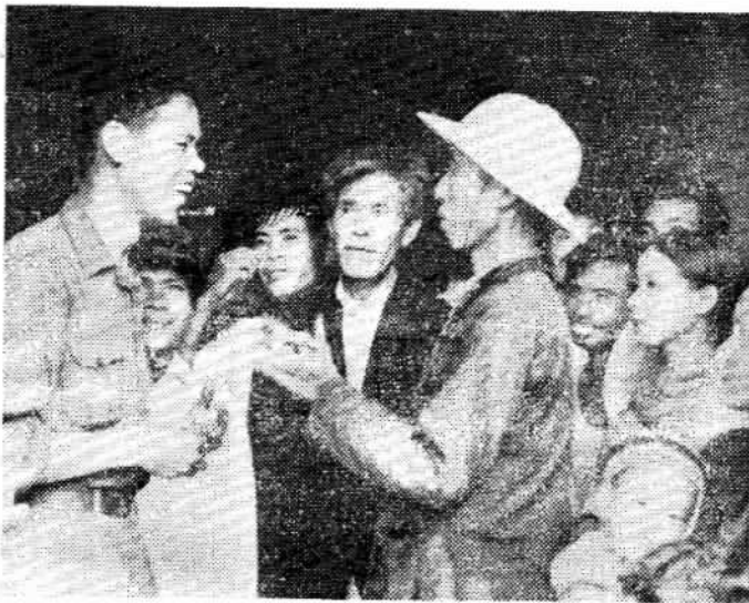
The newly liberated people of Hue chat with liberation fighters.

Hue returned rapidly to normal immediately after liberation, and a new life is being built. Youths enthusiastically joined the home guards to maintain social order. The electricity and water supply was restored. Markets are brisk with many shops doing business again. Large quantities of vegetables were