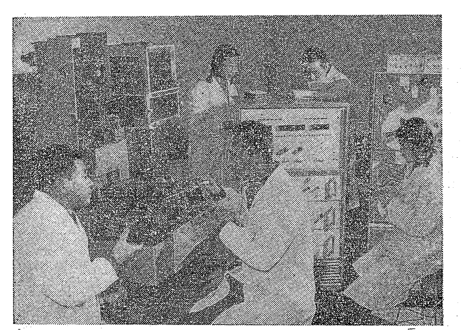
Advanced equipment produced by the joint efforts of Tsing-hua's worker-peasant-soldier students, teachers and workers.

cause the masses who have a high level of political consciousness will rise to oppose and defeat it."