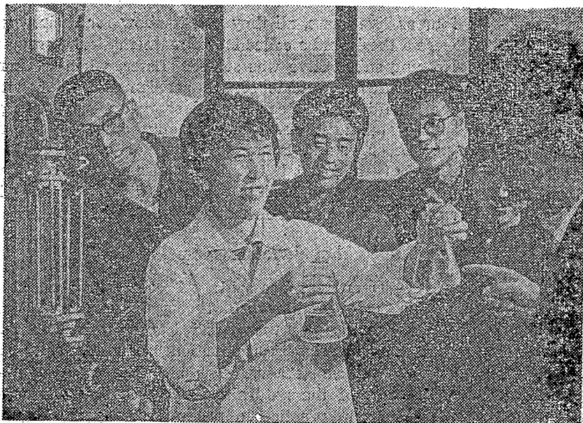
Researchers of the Talian Institute of Chemical Physics and workers of a dyestuff plant join efforts in solving the question of purification of the plant's sewage.

them, thus gradually embarking on the revisionist road. All this seriously affected the socialist orientation of scientific research.