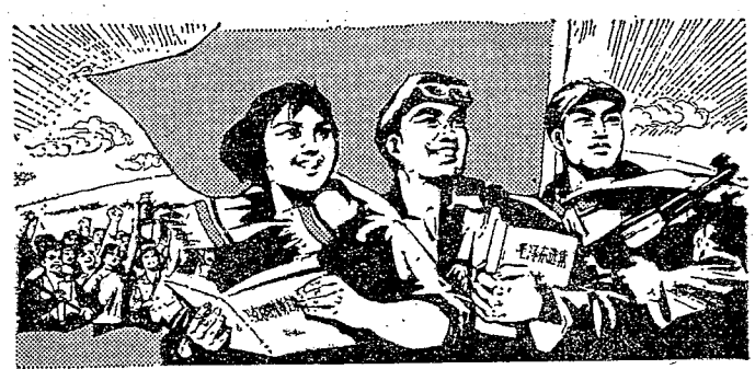
THE GREAT CULTURAL REVOLUTION WILL SHINE FOR EVER

New progress in research has also been made by the institute in nuclear physics and radiation chemistry.