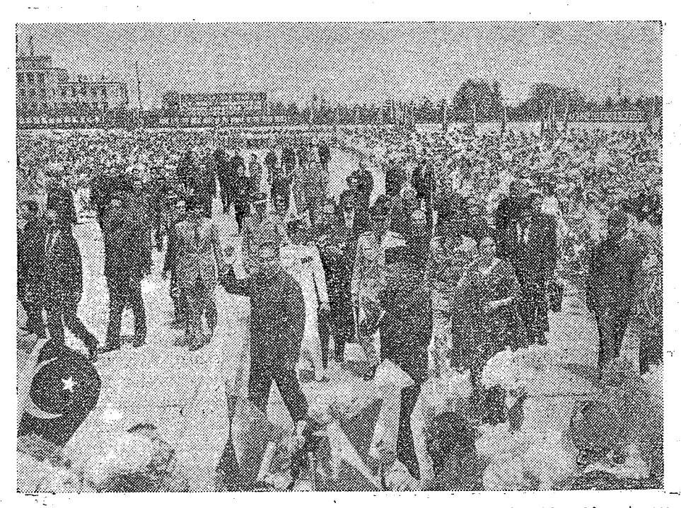
A rousing welcome for distinguished guests from Pakistan at Peking Airport.

Prime Minister Bhutto said: "The people of Pakistan have profound respect for the Chinese people. We have the highest admiration for the spectacular progress made by China in all fields and for the assurance with which it is poised to confront the challenges of the future. We deeply appreciate the many-sided assistance China has extended to