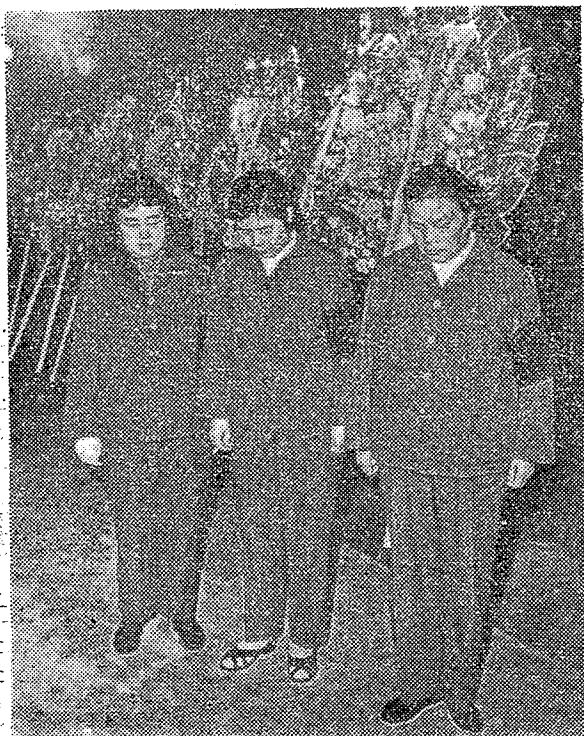
Comrade Kang Ke-ching and relatives at the memorial meeting.

The wreaths presented by our great leader Chairman Mao and the C.P.C. Central Committee and those from other Party and state leaders, Party, government and army departments, people's organizations, patriotic compatriots of Taiwan Province, compatriots in Hong-kong and Macao and overseas Chinese were laid in the mourning hall.