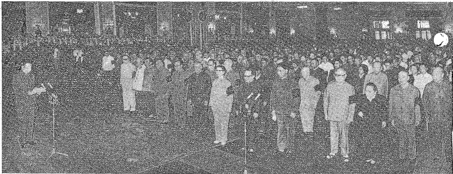
First Vice-Chairman Hua Kuo-feng delivering the memorial speech.

and Premier of the State Council. (See page 6 for full text.)