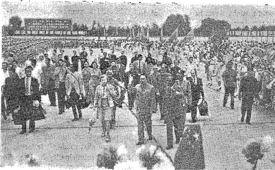
A rousing welcome for distinguished guests from Botswana at Peking Airport.

The editorial expressed the conviction that, so long as they enhance their unity, heighten their vigilance and persevere in struggle, the great African people will definitely be able to frustrate the enemies' conspiracies of all descriptions and win complete independence and liberation for the whole of Africa.