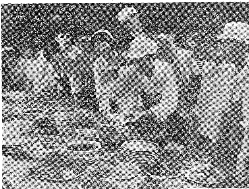
Young workers at a restaurant in Hengyang learning from a chef.

In a word, a new-type relationship between the people is taking shape in socialist commerce in China. In the Manifesto of the Communist Party , Marx and Engels said: The bourgeoisie "has left remaining no other nexus between man and man than naked self-interest, than callous 'cash payment.'" But "the Communist revolution is the most radical rupture with traditional property relations; no wonder that its development involves the most radical rupture with traditional ideas." This new-type relationship in China's commerce and other fields of socialist life is the result of the struggle, carried out under the guidance of Chairman Mao's proletarian revolutionary line, for the gradual realization of these two "most radical ruptures."