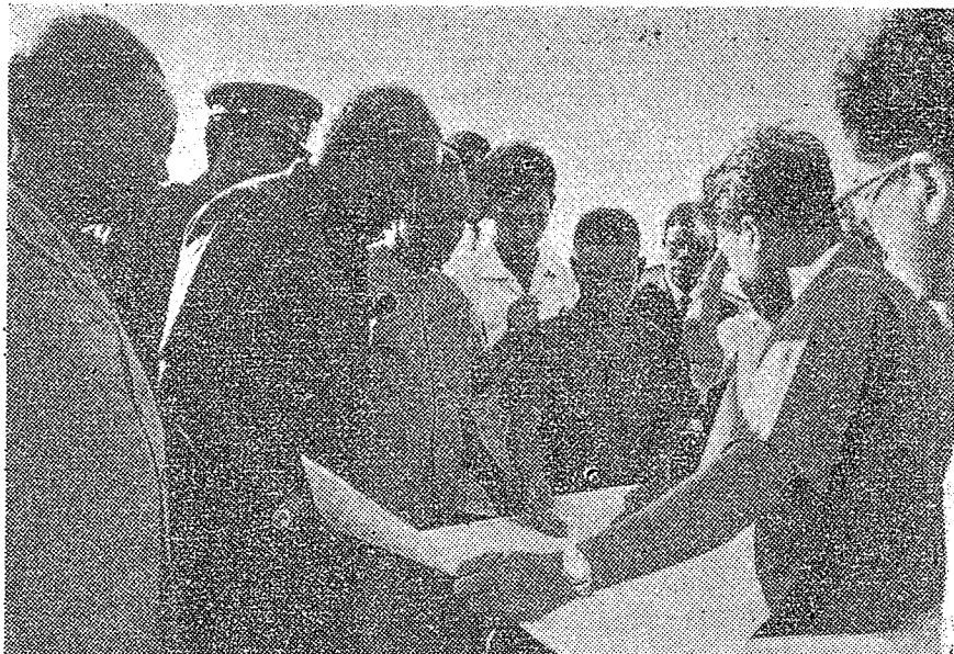
Zambian President Kaunda (2nd from left) and Tanzanian President Nyerere (3rd from left) at the construction site in suburban Dar-es-Salaam in October 1970.

Tunnelling in this section was even more difficult. Most of the 18 tunnels in the Mlimba-Makumbako section were constructed through brittle stone. Some had to pass through a stratum of alluvial soil saturated with underground water. The pneumatic drill operators had