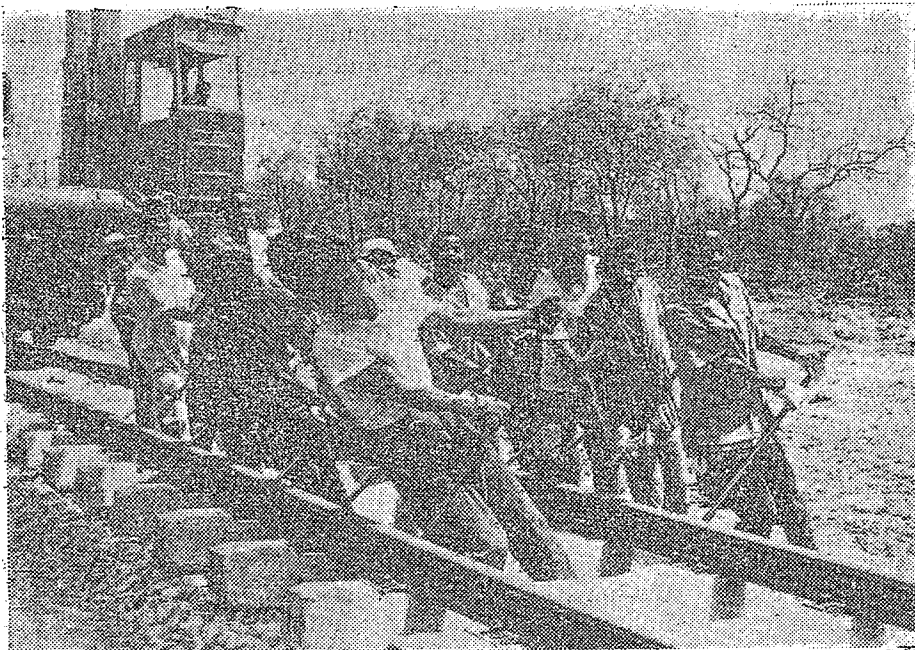
Tanzanian, Zambian and Chinese workers adjusting the position of the tracks.

During the years of hard struggle in building the railway, the builders of the three countries have forged a deep friendship as they cared for each other, learnt from each other and worked together. They worked the same drill in tunnelling, and drove the same earth-moving machines. Together they have sweated under the burning sun and together, they become covered with mud as they braved the rain and wind.