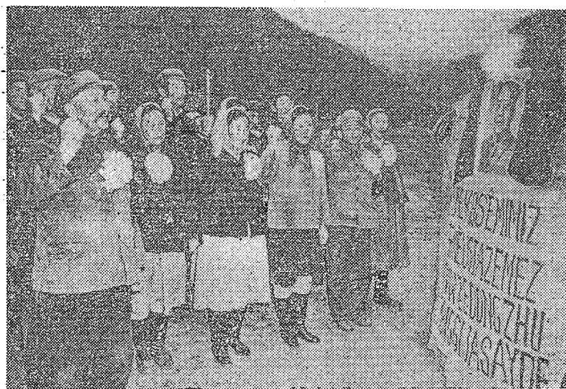
Kazakh herders in the Sinkiang Uighur Autonomous Region take a solemn oath before a portrait of Chairman Mao.

I N Urumchi, capital of the Sinkiang Uighur Autonomous Region which is in the forefront of the struggle against revisionism, 300,000 army men and