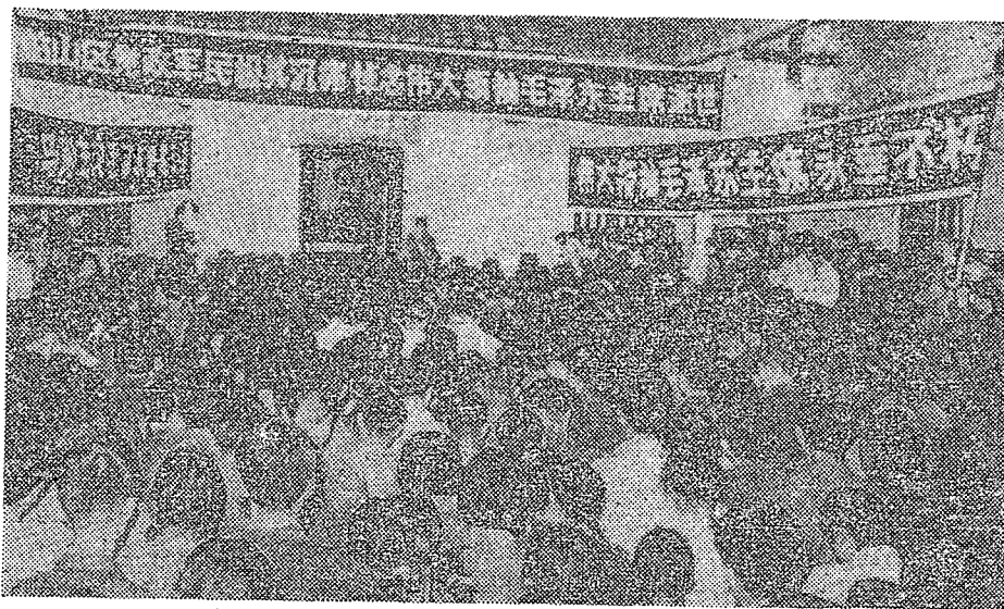
Standing in front of Chairman Mao's former residence, armymen and civilians in Shaoshan mourn with deep grief the passing of Chairman Mao.