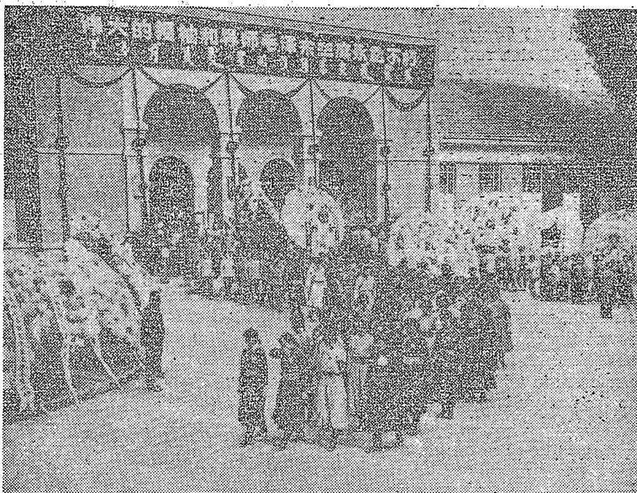
People of various nationalities in the city of Huhehot in the Inner Mongolian Autonomous Region mourning with profound grief.

ONE hundred and fifty thousand armymen and civilians of various nationalities in Huhehot and from other parts of the Inner Mongolian Autonomous Region held a solemn memorial meeting in Huhehot. Chih Pi-ching, second secretary of the Party committee and vice-chairman of the revolutionary committee of the autonomous region, presided over the meeting. Yu