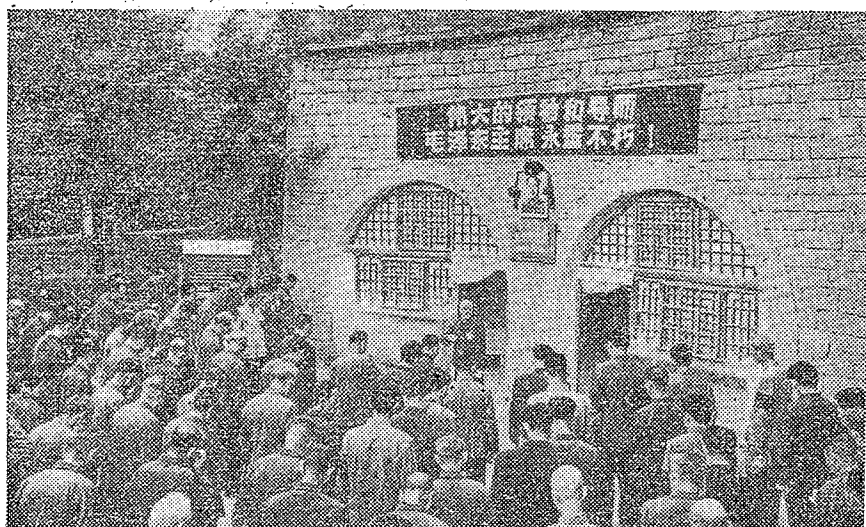
Armysmen and civilians in Yen-an mourn with deep grief in front of the cave-dwelling in which Chairman Mao once lived.