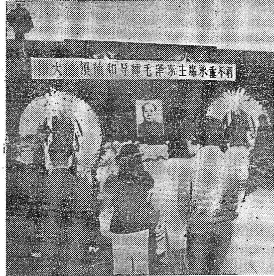
Peru: Before a performance by the Yuyachkani Theatre in Lima, the entire cast mounts the stage carrying a portrait of Chairman Mao and a red flag. One actor reads out a message mourning the late Chairman Mao. The audience of over 500 rose in silent tribute to his memory.