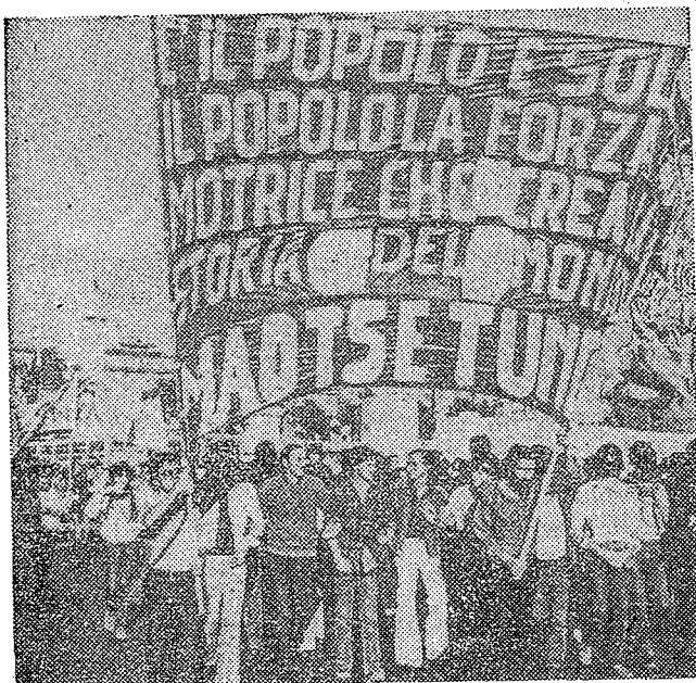
Italy: People march in Rome to express their mourning over the passing of Chairman Mao Tsetung. A quotation from Chairman Mao on a huge streamer reads: "The people, and the people alone, are the motive force in the making of world history."