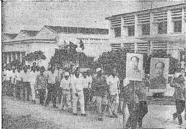
Tanzania: Carrying Chairman Mao Tsetung's portraits, several hundred workers from the Friendship Textile Mill go to the residence of Chinese experts to offer their condolences for Chairman Mao.