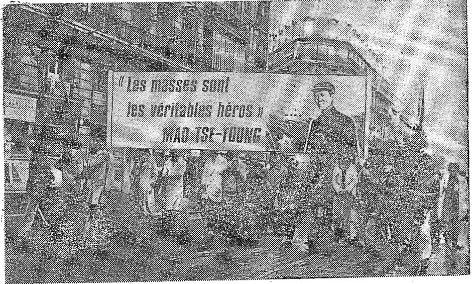
France: Parisians march in the streets to mourn Chairman Mao Tsetung. A quotation from Chairman Mao on a placard reads: "The masses are the real heroes."