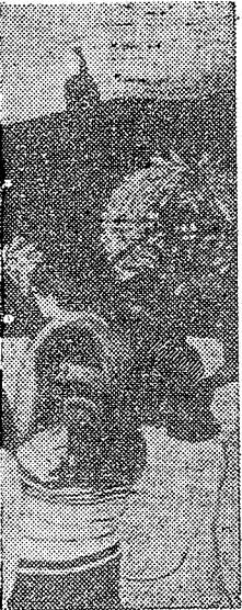
Mexico: People deeply mourn Chairman Mao Tsetung, at the Chinese Embassy.