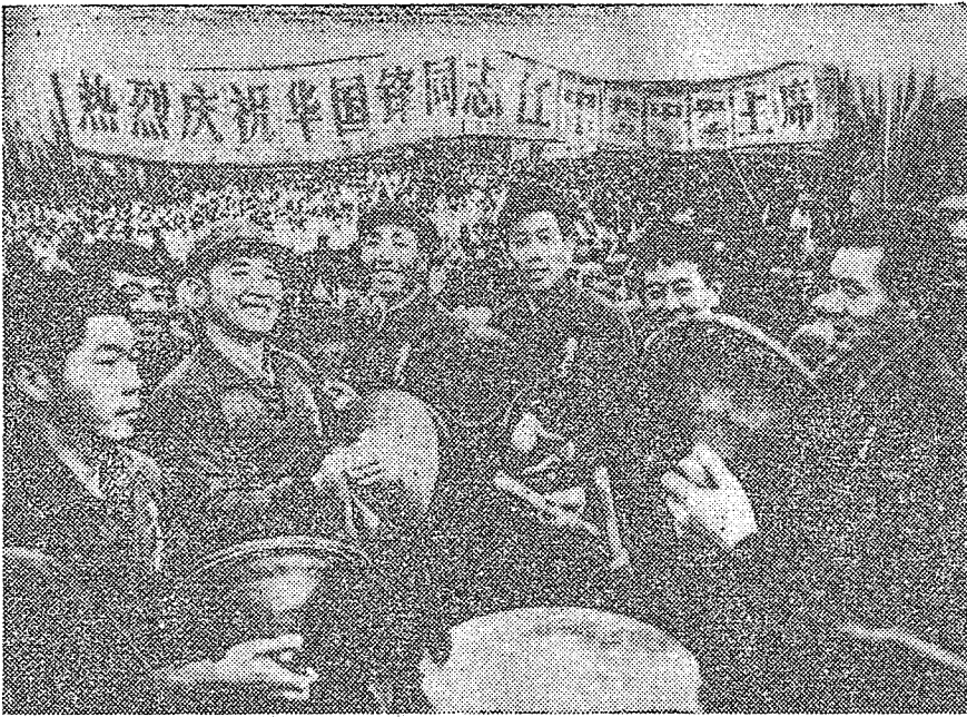
At the celebration rally in Taiyuan.

held a rally and demonstration on October 22. Li Teh-sheng, Member of the Political Bureau of the C.P.C. Central Committee and Commander of the P.L.A. Shenyang Units, and Tseng Shao-shan, First Secretary of the Liaoning Provincial Party Committee, Chairman of the Provincial Revolutionary Committee and Political Commissar of the P.L.A. Shenyang Units, attended the rally.