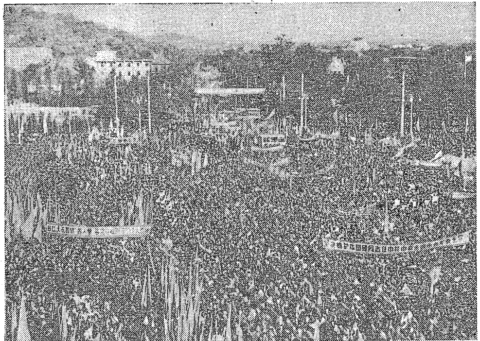
At the mass rally in Nanking.