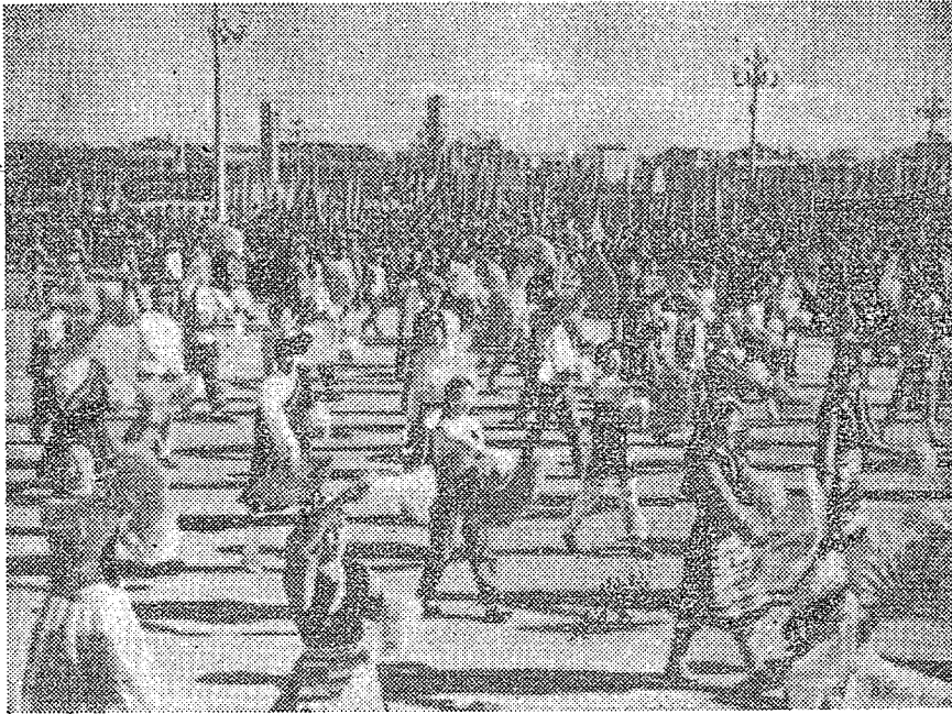
At the celebration rally in Kunming.

the autonomous region. He said they would rally most closely round the Party Central Committee headed by Chairman Hua Kuo-feng, obey its orders in all actions, carry out Chairman Mao's behests and carry the proletarian revolutionary cause pioneered in China by Chairman Mao through to the end.