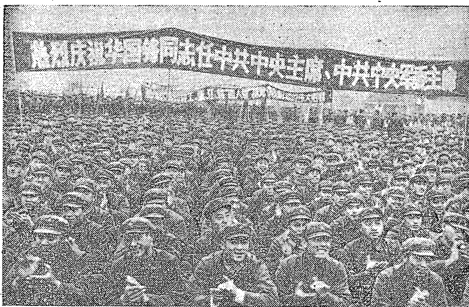
P.L.A. armymen at the celebration rally in Shenyang.

In northeast China's Shenyang, 2.5 million armymen and civilians from various parts of Liaoning Province, the P.L.A. Shenyang Units and the city of Shenyang