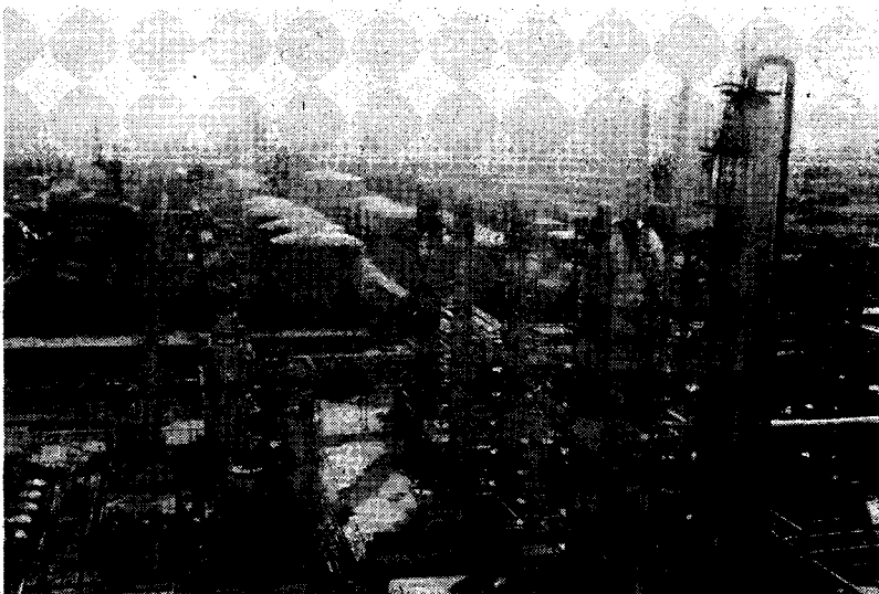
The Shengli General Petrochemical Works.

petrochemicals including gasoline, kerosene, diesel oil and tar.