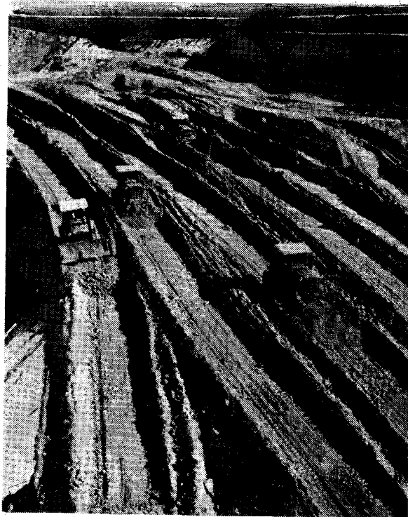
Tachai Brigade members level hills and fill in gullies to build "man-made plains."

We had played host to our Premier Chou and many other leading comrades from the central authorities, but we had not met her before. We thought Chiang Ching who was a Member of the Political Bureau of the Party Central Committee would help us by way of advice and instructions as Premier Chou and other leading comrades had done. Imagine our surprise when we saw she was not like them at all. Our first impression was that she was so pompous and haughty. She came by special train accompanied by a retinue of more than a hundred, and there were truckloads of food and luggage in addition to four fine horses for riding. Our next impression was that she considered