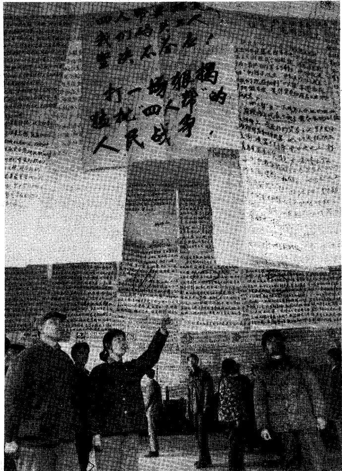
Big-character posters by Shanghai dock workers denouncing the "gang of four."

They ruthlessly persecuted those comrades who upheld Chairman Mao's revolutionary line,