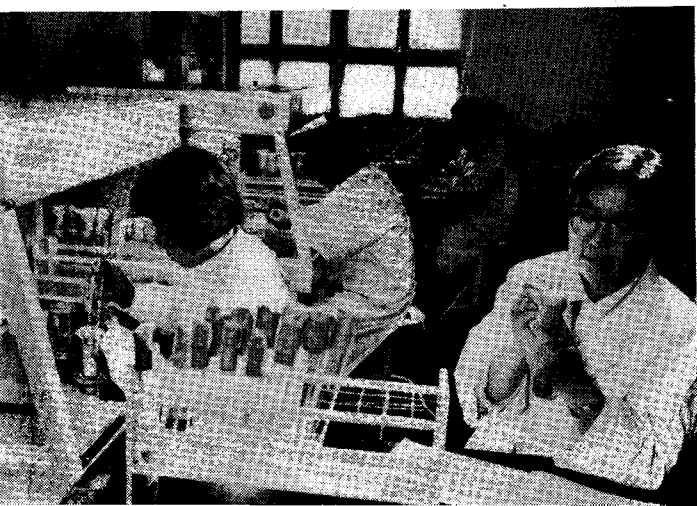
Scientists of the Shantung Provincial Academy of Agricultural Sciences at work.

The participants criticized the fallacies spread by the "gang of four." According to the gang's logic, modern science and technology should be wiped out, intellectuals can be dispensed with and advanced equipment imported from abroad should be dismantled. Since the steam engine was invented by a foreigner, cattle-drawn carts should be used instead of trains, and since the incandescent lamp was invented by a foreigner too, we should use oil lamps instead of electric light. Shortly after the October Revolution, there were people in the Soviet Union who asserted that the railways left to them were bourgeois railways and there-