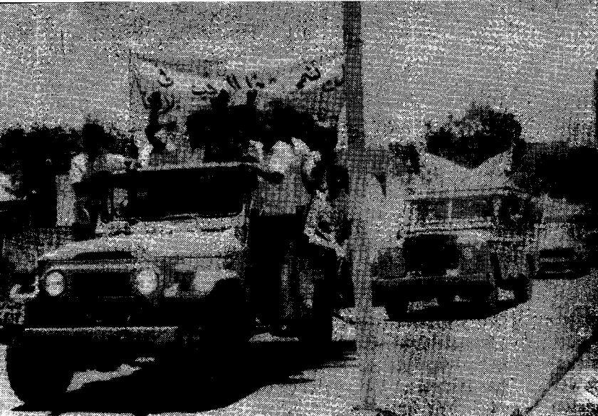
Sudanese youth in a demonstration in Khartoum. Their posters carry such slogans as "Soviet interference in our country not allowed!"

one place after another shows that the people are rapidly awakening," he added.