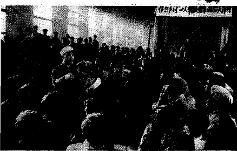
Workers of the Anshan Iron and Steel Company criticizing the "gang of four."

producers' co-operatives and people's communes. Aren't all these socialist new things? Isn't it a fact that the Tachai Brigade, the red banner on the agricultural front, and the Taching Oilfield, the red banner on the industrial front, are socialist new things that came into being before the Cultural Revolution?