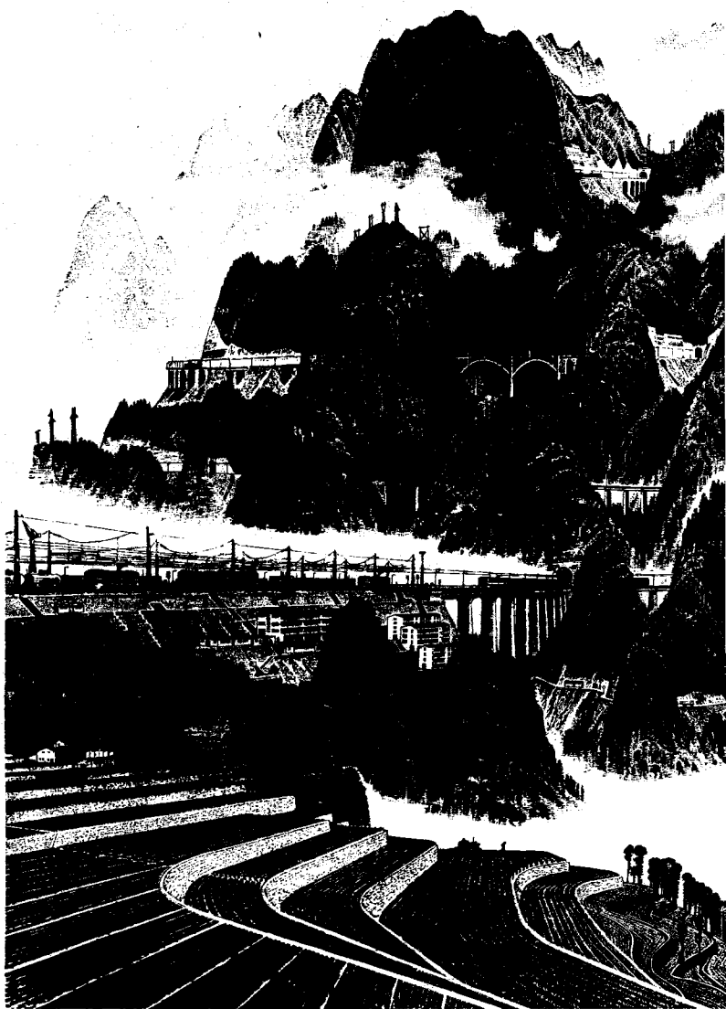
Striving for socialist modernization.

Out of their needs to usurp Party and state power, the "gang of four," of course, opposed our catching up with and surpassing the world's advanced levels. They clamoured that "we would rather have socialist low speed than capitalist high speed of development" and that "sending satellites into orbit would cause the red flag to fall to the ground." They did all they could to denigrate China's socialist system under the dictatorship of the proletariat and to dampen the enthusiasm and determination of scientific and technical personnel and the rest of the nation to catch up with and surpass the world's advanced levels. We must thoroughly expose and condemn these criminal activities of the "gang