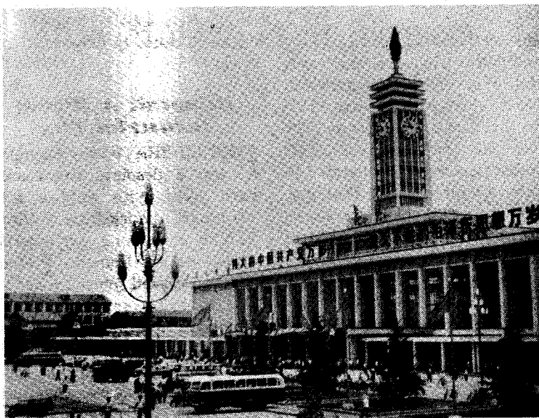
The new railway station in Changsha.

Changsha is the city where Chairman Mao first organized revolutionary activities. It is the political, economic and cultural centre of Hunan as well as the hub of several trunk railway lines including the one from Peking to Kwangchow and the one from Hengyang (Hunan Province) to Yuyikuan (Kwangsi Chuang Autonomous Region). As the original station could no