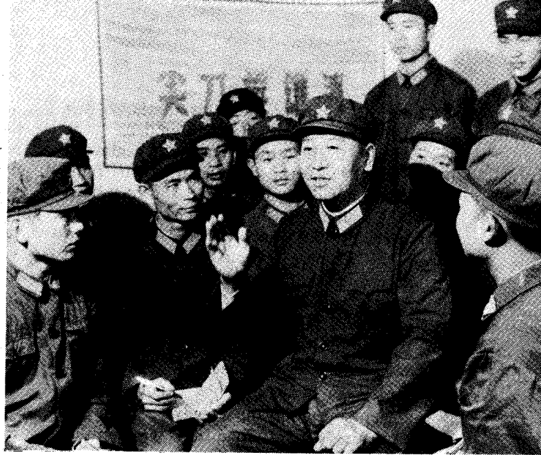
A veteran fighter explaining the P.L.A.'s fine revolutionary traditions.

We visited an exhibition on the history of the division and learnt that it has been outstanding in combat.