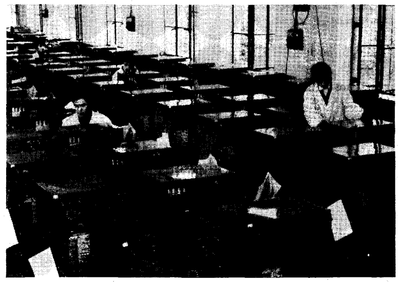
Products of the Nanking Radio Factory.

This national minority has rich experience in stock-raising. Because the reactionary ruling classes followed an oppressive policy towards minority peoples in the old society, its population decreased year by year and the