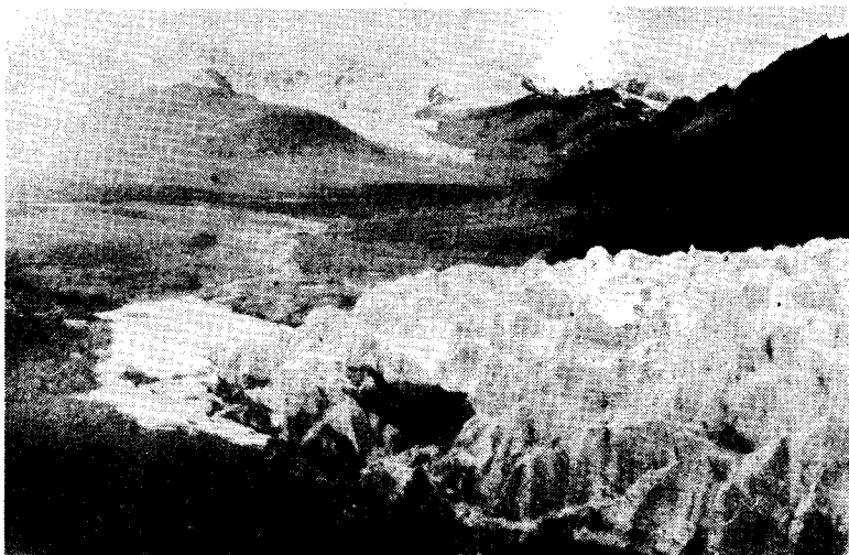
The headwaters of the Yangtze.

China's present treatment of the disease includes administra-