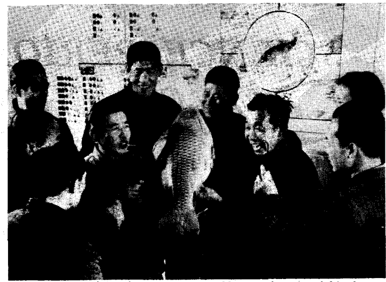
A new variety of common carp which reaches a weight of 7.7 kg. within a year and a half.

In Wusih city of Kiangsu Province, east China, which has a long history of raising fish, the area of newly built fishponds in the last four years exceeded its former total area of fishponds. The output of fish went up 52 per cent. Harbin, capital