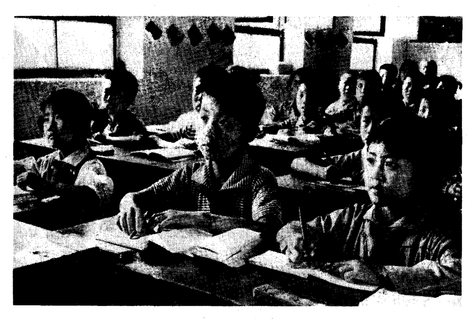
Pupils of the Tachai Brigade Primary School.

particular, the "gang of four" pushed a revisionist line which undermined educational work and wrought great damage to key schools.