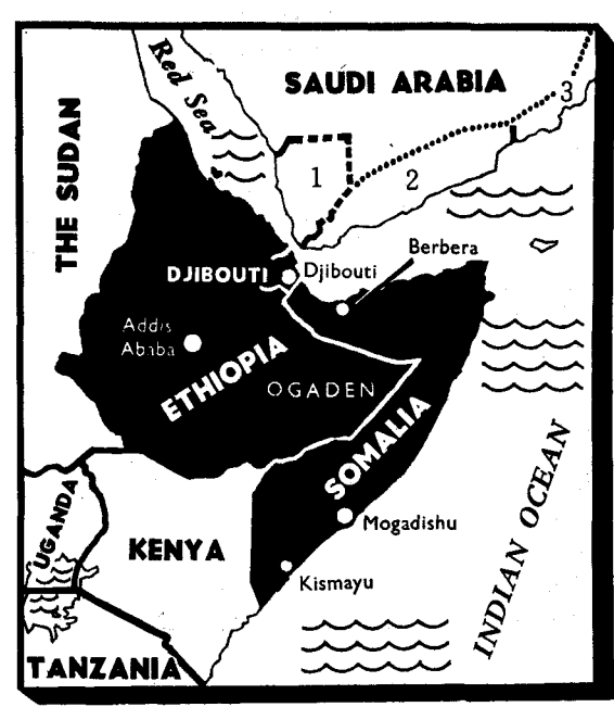
1. THE YEMEN ARAB REPUBLIC 2. THE PEOPLE'S DEMOCRATIC REPUBLIC OF YEMEN 3. OMAN

ruary 12, in Mogadishu, the Somali capital, 50,000 people rallied and demonstrated, shouting "Russians, Go Home!" Some of the placards carried by the demonstrators read: "Down with social-imperialism!" "Down with the Soviet Union!" and "The peace-loving people of the world must know the Soviet Union and Cuba are aggressors!"