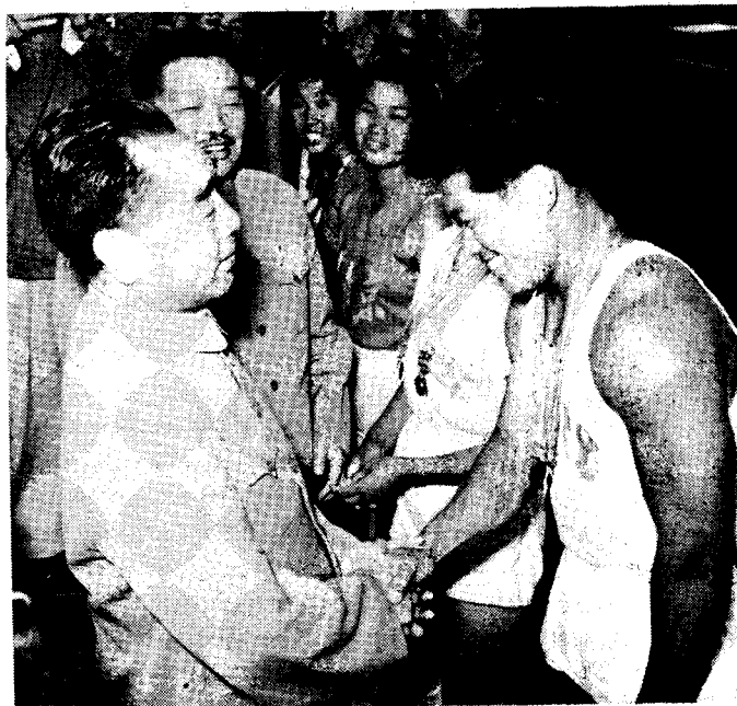
Premier Chou and Vice-Premier Ho Lung receiving athletes, 1959.

leadership and his revolutionary line." Premier Chou's words reflected the consensus of the members of the public security organs as well as the real situation in regard to their work.