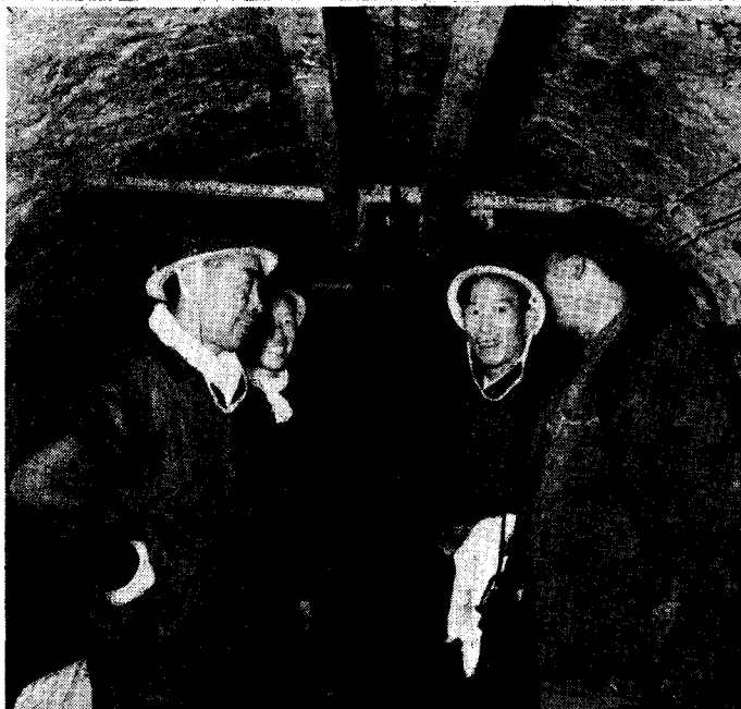
Premier Chou down in a pit of the Kailan Coal Mine, 1958.

bit of a traffic problem which was particularly acute during rush hours. So one evening during the rush hours Premier Chou rode buses and trolleys around half of Peking to learn about the situation at first hand. Sometimes, when there was a conference or he had work to do at the Peking Hotel, the Premier would stand in front of the meeting hall or the Peking Hotel and direct traffic himself.