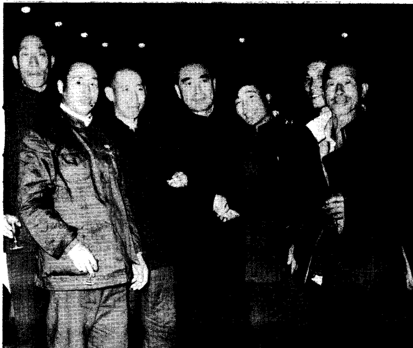
Premier Chou among peasants, 1958.

The Premier also paid much attention to the urban traffic problem because it had a bearing on the work and the lives of the people. One winter Premier Chou heard that Peking had a