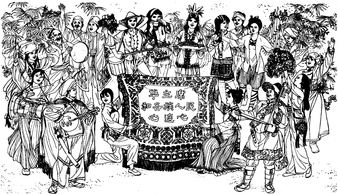
by Hsu Chi-hsiung

On the question of state organs, another point to be mentioned is that the draft explicitly stipulates that our country in the main applies a three-level system of local organs of political power, namely, at the provincial, county and commune levels. Prefectures under the provinces and autonomous regions, with the exception of national autonomous prefectures, are not classified as a level of political power. There instead of people's congresses and revolutionary committees, administrative offices will be set up as agencies of the revolutionary committees of the provinces or autonomous regions, and administrative commissioners and deputy commissioners will be appointed. Where districts are set up under counties, they likewise are not a level of political power, but are agencies of the county revolutionary commit-