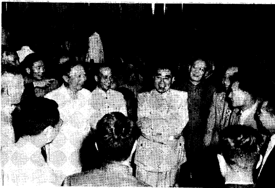
Premier Chou among scientists, 1956.

Forging close ties with the masses is not merely style of work. It is intimately bound up with the question of political line. I often ponder: Why was it possible for Premier Chou to hold constantly to the revolutionary line of Chairman Mao during the Great Cultural Revolution? What enabled him to see through and counter Lin Piao's and the "gang of four's" intrigues and perverse activities? Premier Chou