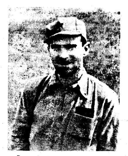
Snow in the northern Shensi revolutionary base area, 1936.

ONE afternoon in June 1936, with the scorching sun beating down on the loess plateau in northern Shensi and a hot wind whipping up clusters of dust, a small group of people trudged