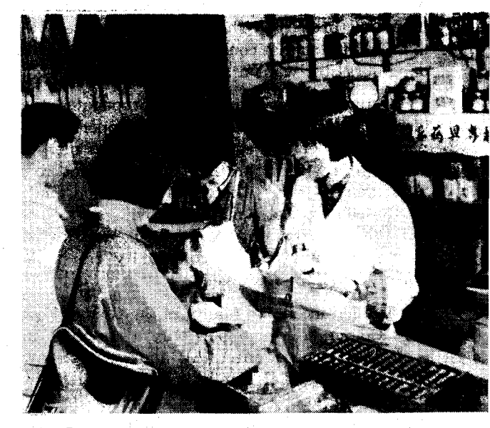
Free contraceptives over the counter.

In the county rural areas kindergartens and nurseries have been widely set up. Production team nurseries accept children under three years old and production brigade kindergartens care for children between three and seven. The expenses of the kindergartens and nurseries are paid out of the collective's public welfare fund. In 1977, 53.4 per cent of the county's children were in nurseries and 87.8 per cent in kindergartens. Teachers and nurses teach the children