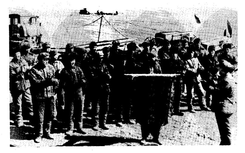
Presenting a socialist emulation banner to an advanced unit of a state farm in Heilungkiang Province.