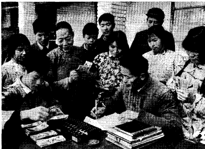
Year-end distribution in a production brigade in Zhejiang Province.

What happened in the Huangcheng Commune in Changdao County, Shandong Province, illustrates the harm done by such fallacious practice. In 1970, the commune did well in developing a diversified economy and its members' annual income increased to 203 yuan