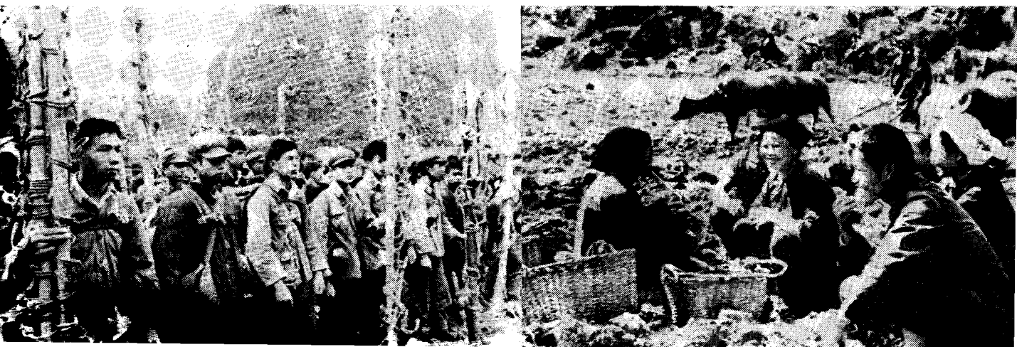
Left: A stretcher team of militiamen in Jingxi County backing Chinese frontier forces in their counterattack. Right: Chinese commune members of Jingxi County, Guangxi, leave their shelters in the hills for spring ploughing after Chinese frontier forces start counterattacking Vietnamese aggressors.

• February 16 The Chinese Foreign Ministry sent a note to the Vietnamese Embassy in China strongly protesting against the Vietnamese authorities' dispatch of armed personnel to encroach upon China's territory and create new grave incidents of bloodshed. The note warned the Vietnamese authorities that they should bear full responsibility for all the consequences arising therefrom.