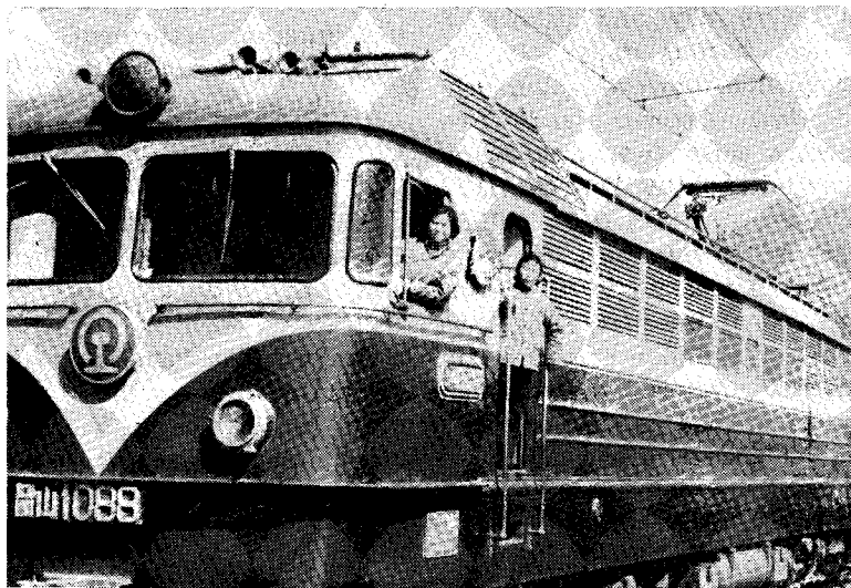
Women engine drivers aboard their locomotive.

China's first electrified railway, the Baoji-Chengdu Railway, was completed in 1975 and the second, the Yangpingguan-Ankang Railway, in 1977.