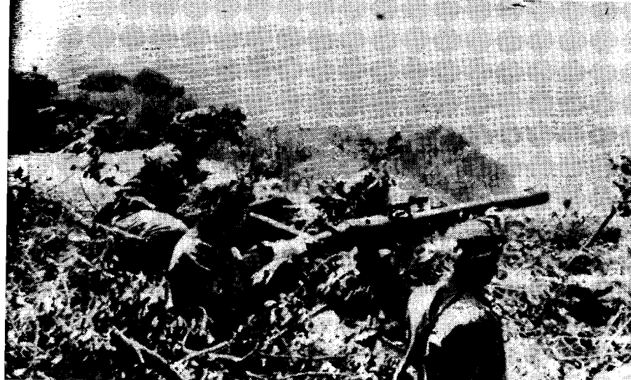
Chinese frontier troops on top of China's Tinghao Hill in Jingxi County, Guangxi. The hill was recovered from the Vietnamese aggressors.

against Chinese inhabitants and militiamen there. The casualties among commune members included 6 dead and 12 wounded. Six others were kidnapped.