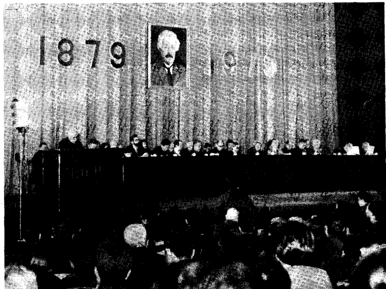
Meeting in commemoration of Einstein.

The Chinese people and scientists will never forget how Einstein showed deep concern for the suffering of China's labouring people and placed high hopes on our nation which has a long history of civilization. In the 30s, Einstein appealed to the world to stop Japanese aggression against China and voiced solidarity with the seven public figures in China who were persecuted by the reactionary regime for advocating resistance to Japanese aggression. Einstein's moral strength and scientific questing spirit are a source of inspiration to the Chinese people today.