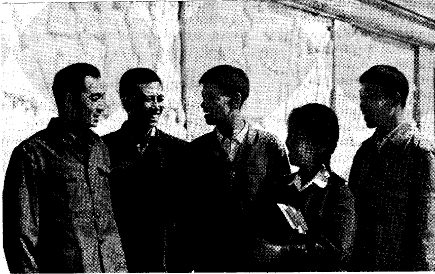
Five of many young people, persecuted in connection with the Tian An Men Incident, revisit the Square after they were exonerated.

with the incident should be rehabilitated and exonerated.