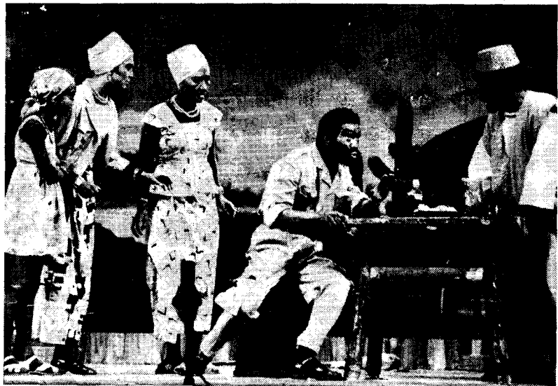
A scene from The Other Side .

Repertoire of the Beijing Opera Theatre of Beijing. The 15 masterpieces staged by this well-staffed theatre in the last two weeks include: the historical play Hai Rui Dismissed From Office , The White Snake — a folk tale on the loyalty of love, The Monkey Subdues the White-Bone Spirit , and Mu Guiying Takes Command — a story about a patriotic woman general.