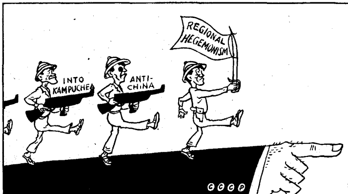
The Vietnamese "road to socialism."

The Vietnamese authorities think that they can bind Kampuchea to their war chariot rolling through Southeast Asia with this treaty of enslavement. But as a matter of fact the puppets are a heavy burden to the Vietnamese authorities. For Viet Nam is being forced to