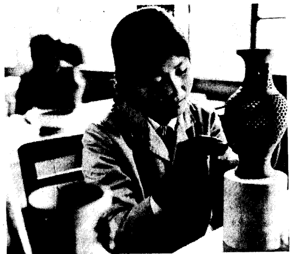
These openworked vases of the Fengxi Ceramic Factory in Guangdong Province are in great demand.

Can we greatly expand our exports? Of course we can. To do so, the main thing is to do a good job in production and ensure a good supply of export items. China is a big country with rich resources. Our socialist economy has attained a certain level of production and there is no lack of labour power. There is a huge potential of export commodities and there are many ways for accumulating foreign currency. China is rich in oil, coal and non-ferrous mineral resources, the increased extraction of which can expand our exports. We already have a pretty good light and textile industrial base. By improving their quality and variety as well as expanding some production capacities, the prospects for exporting light industrial products are good. We have plenty of traditional exports — agricultural, side-line and native products as well as handicraft and art articles — which have good prospects. We are also preparing to further expand our exports of machinery, chemical products and other heavy industrial goods. So long as the relationship between central and local authorities, the coastal and interior regions, the ports and the non-port cities, foreign trade and production, external and internal trade, and foreign trade and other departments is well arranged, the positive factors of all are fully mobilized, and co-ordination