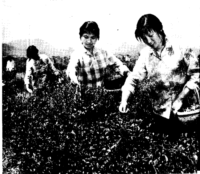
A tea plantation in Yujiang County, Jiangxi Province.