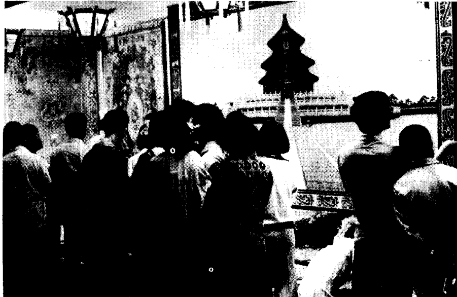
At the China trade fair held in Bangkok last January and February.

A: In the past, all our import and export transactions were generally paid in cash and we will continue to use this traditional method. However, to be more flexible, we can adopt the methods of compensatory trade, processing buyers' materials according to their designs and importing material for production of export goods according to buyers' specifications. These, however, are subsidiary measures. In engaging in compensatory trade, we must first of all make sure that the contracting party will agree to take the products turned out by the introduced