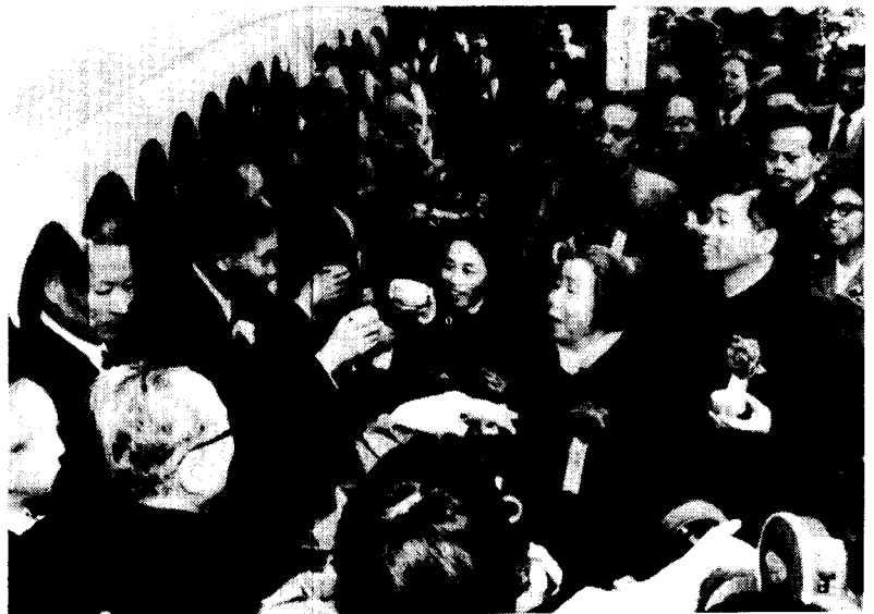
Toasting Sino-Japanese friendship after the ceremony unveiling the tablet inscribed with the late Premier Zhou's poem.

"In the unstable world today," he stressed, "growing