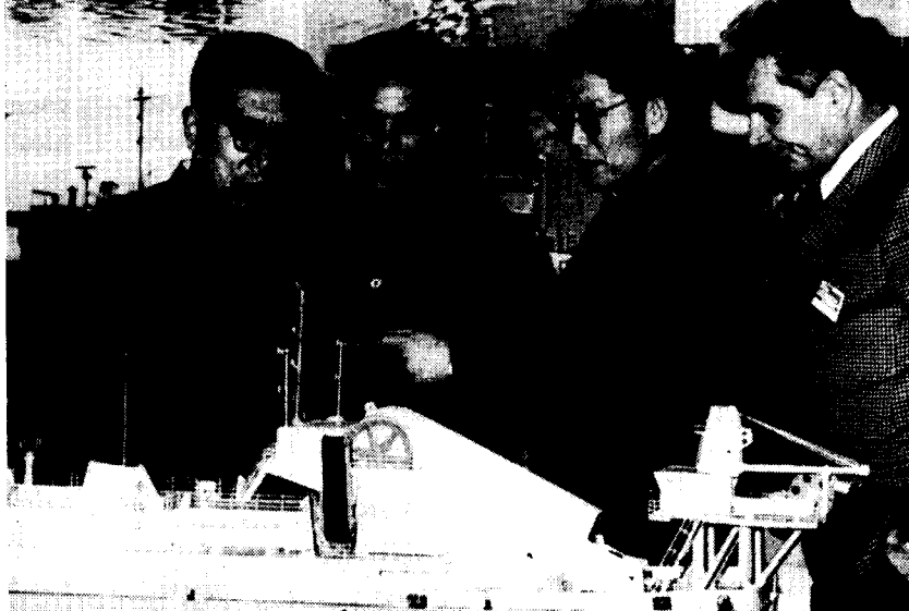
Yugoslavia's industrial exhibition held in Beijing this month.

By the end of 1978, the C.C.P.I.T. had held 293 economic and trade exhibitions in 101 countries in Asia, Africa, Europe, Latin America and Oceania, and hosted 117 comprehensive and specialized exhibitions from 25 countries. In 1978 it arranged a 12-Nation Agricultural Machinery Exhibition for the first time in China.