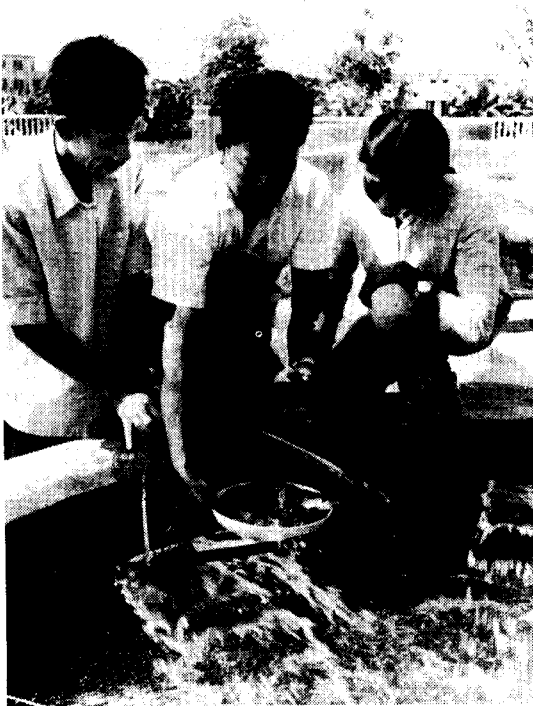
Scientific workers of the Aquatic Products Research Institute in Guangdong Province studying ways of breeding freshwater fish.

In building water conservancy projects, attention should be paid to protecting the fishing areas.