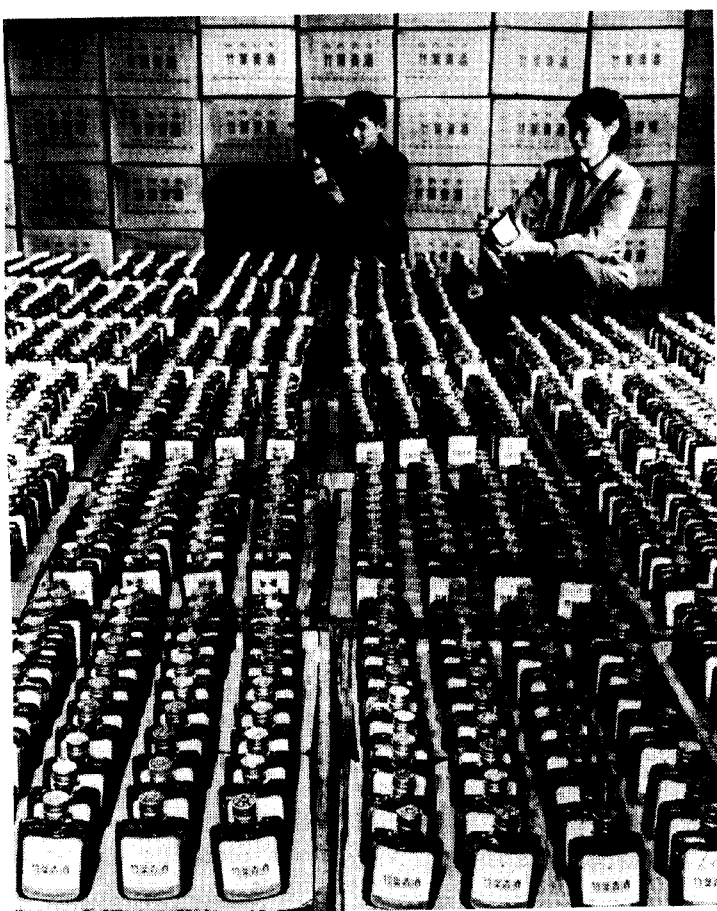
Inspecting a consignment of Chu Yeh Ching (Bamboo Leaf Green) Wine — a famous brand from Xinghua Village, Shanxi Province — before it leaves the winery.

A: The conditions are very good. The international conditions are good as many countries are willing to do business with us, and proof of this is that one agreement after another has been signed. Some of them are long-term agreements, involving fairly large sums of money. As for domestic conditions, the mass movement to criticize Lin Biao and the “gang of four” has in the main ended victoriously, the political situation throughout the country is stable, and everyone wants stability, unity, and to push the national economy forward. The realization of the four modernizations is the common aim of the whole Party and the whole people. With the shift in the focus of the whole Party’s work, economic construction is developing apace. This situation requires a major development in our foreign trade.