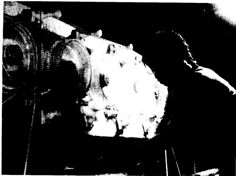
In the chemical fibre workshop of the Organic Chemical Plant in Guizhou Province.

There are, however, some shortcomings in industrial production which must be overcome. For instance, the development of light industry and heavy industry was not well coordinated; the increase of light industrial products was slow and the supply of some commodities fell short of demand.