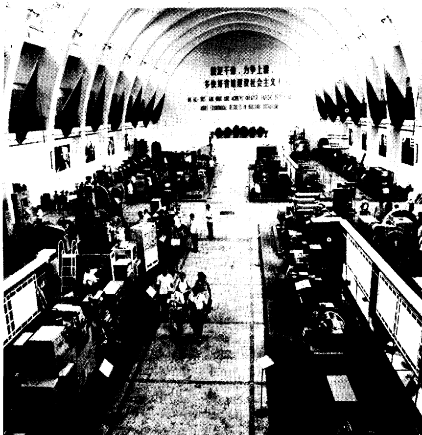
Machinery at the Guangzhou fair.

four," they have experienced a dramatic development. Some items are purely for enjoyment, such as curios, replicas of ancient calligraphy and drawings, ivory-, jade-, wood- and stone-carvings in ancient styles