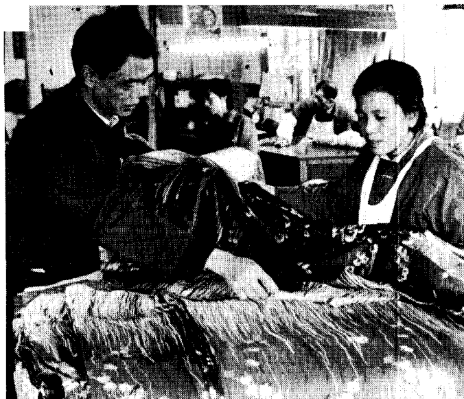
Silk produced by a Shanghai factory.