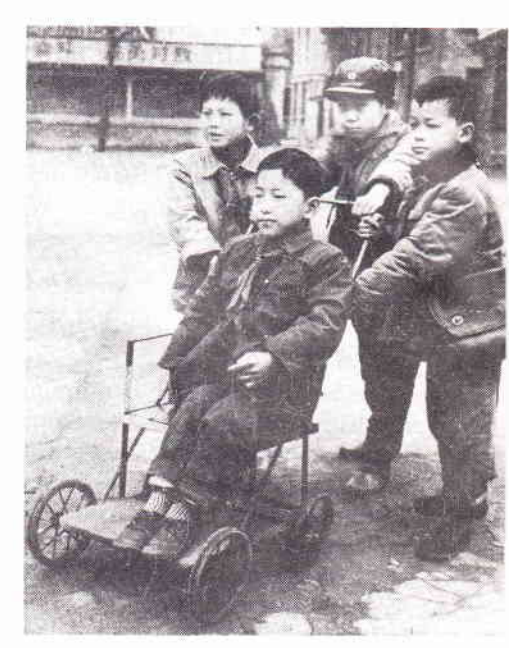
Third-grade pupils of a primary school in Jiangxi Province's Nanchang city help a paralytic pupil to school every day.

Material and spiritual civilizations are closely related. A welldeveloped economy lays a good foundation for spiritual civilization. However, spiritual civilization will not come automatically just because material prosperity is achieved. Spiritual civilization promotes the building of material civilization. During the Yanan period, the Chinese Communist Party was beset with material difficulties, but through the rectification movement, the Party set an example for the whole nation in its style of work, in unity between Party, government,