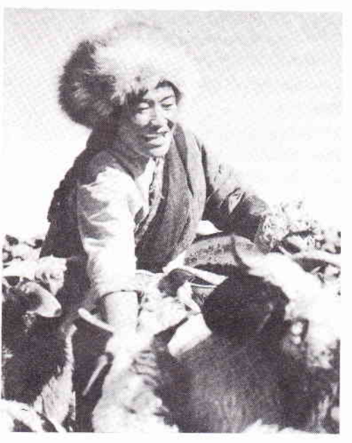
A Tibetan woman tending sheep.

These were some of Tibet's achievements last year, made