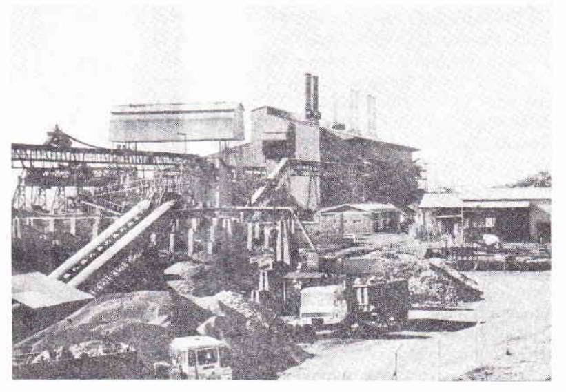
Zimbabwe's biggest chrome-smelting factory.

After its decision to abandon nationalization in 1975, the Zairian Government cancelled the state's monopoly control of transport and communications. Some poorly managed