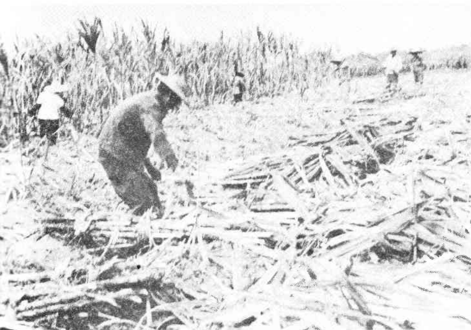
Commune members in Nanzhuang commune harvesting sugar cane.

Earnings from diversified economic undertakings accounted for 21 per cent of Lishui's 1981 total income. The same year each of its members got 100 yuan more than he or she earned in 1979.