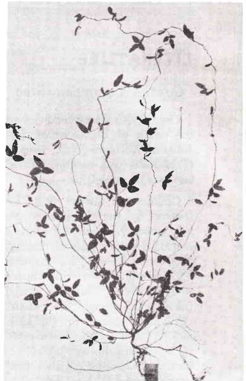
A wild soybean plant collected in Henan Province.

The survey showed that wild soybeans are distributed in the vast areas east of Lanzhou and Chengdu at altitudes from 5 to 2,650 metres above sea level and between 24 degrees to 52