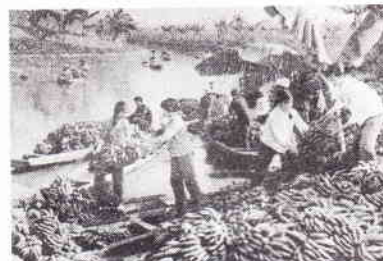
Commune members in Nanhai County transporting bananas.

A major shake-up has been introduced in Viet Nam's central leading body to strengthen the hands of Le Duan and his followers. But many indications show that with a deteriorating economy and a low popular morale, things are becoming more and more difficult for them (p. 9).