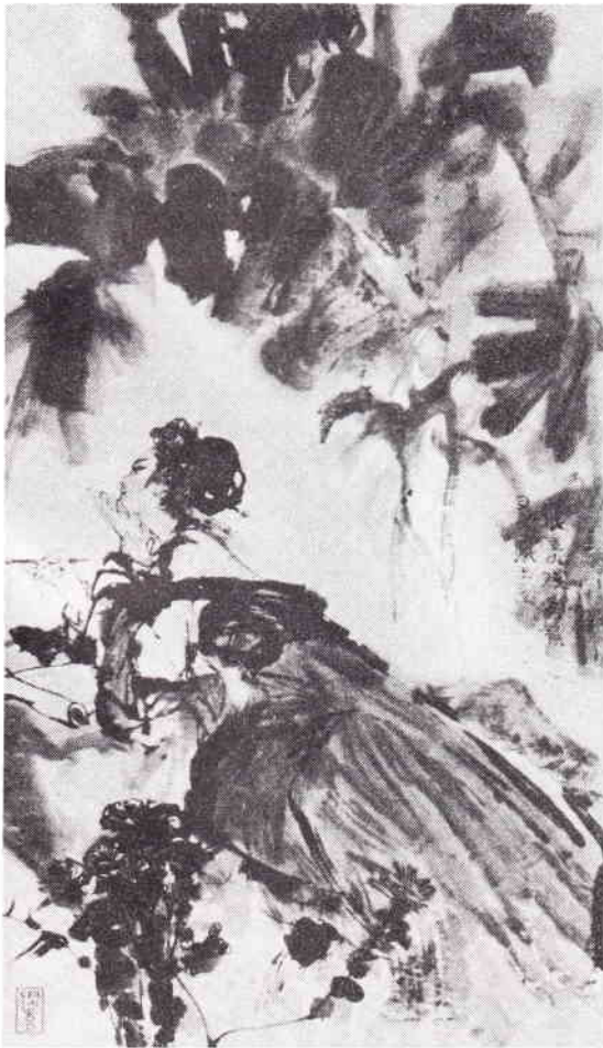
Poetess Li Qingzhao of the Song Dynasty (960-1279 A.D.).