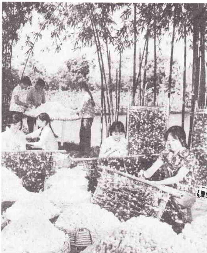
Silk cocoon harvesting in Jiujiang commune.

"The fact that the peasants were not enthusiastic about agriculture for many years in the past did not mean that they did not like the collective economy. What they disliked was being ordered around arbitrarily and being forced to practise egalitarianism in distribution.