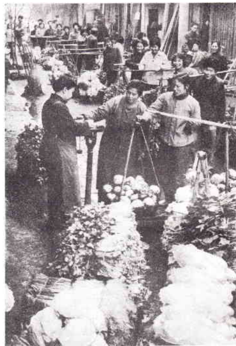
Peasants of Qionglai County, Sichuan Province, selling vegetables to the state.

The main reasons for this are: Besides poor management in some of the commercial departments, some communes and production brigades on the outskirts have not allotted enough land to growing vegetables according to the state plan, and increasing amounts of suburban cultivated land, including large areas of fertile land, are being used for capital construction.