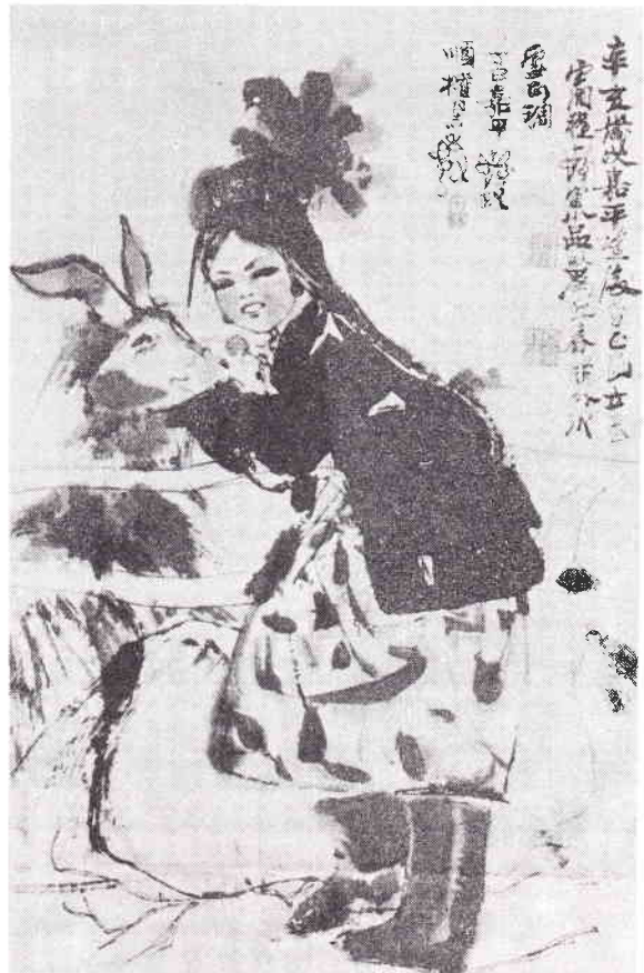
A Kazakh girl.