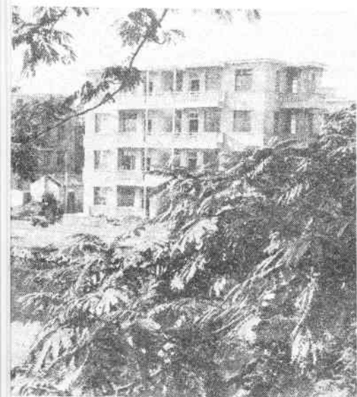
The new look of a village in Lishui commune.