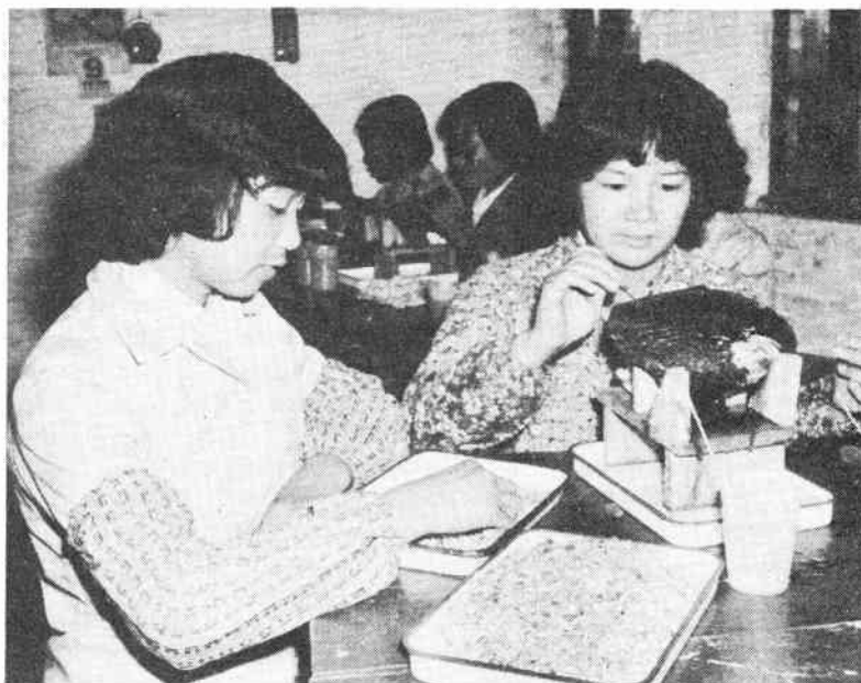
Women commune members in a cultured pearl farm extracting pearls from oysters.

"We should not worry about the collapse of the collective economy," the county Party secretary continued. "We are no longer in the era of the economy based on the individual small peasant, as we were before the movement for agricultural co-operation. At present, our county's communes, production brigades and teams have 300 million yuan in public accumulation funds. We have collectively built 400 kilometres of embankments on 35 rivers, and 314 irrigation and drainage stations. The collective sector owns a total of 38,000 agricultural machines, from trucks and tractors to motorboats. With so much obvious benefit from the collective economy, we cannot possibly retreat to the stage of private small peasant economy.