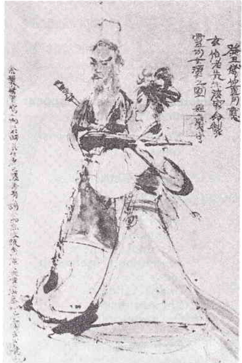
Poet Qu Yuan of the Warring States Period (475-221 B.C.).

Renowned for their romantic flavour and poetic artistic style, his paintings have combined the skills of classical painting with modern drawing and have absorbed some techniques from Western painting.