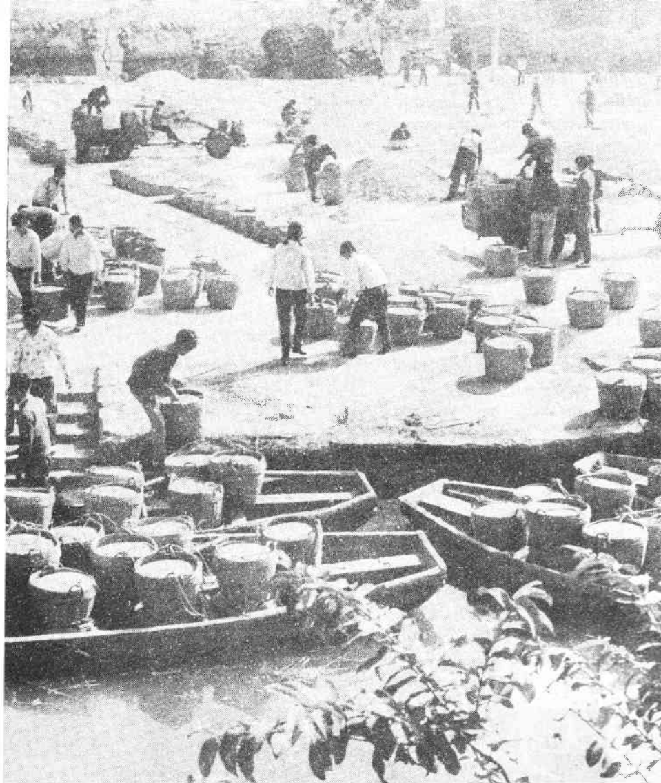
Newly harvested grain in Pingzhou commune, Nanhai County.