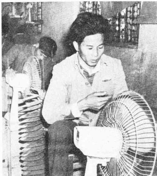
Workers in a Nanzhuang commune-run factory making electric fans.

• The peasants have the right to arrange, as they see fit, their own farm work and sideline occupations, whether with