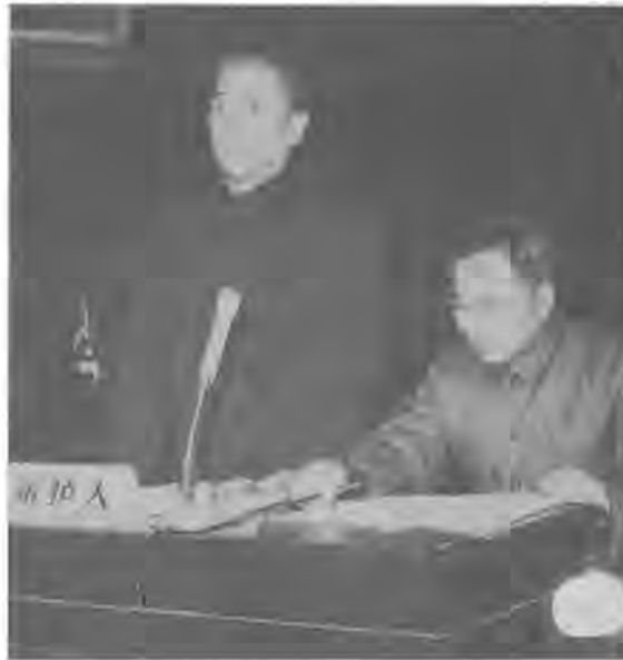
Legal counsels in a Shanghai court.

After a careful review of the evidence and the defence, the