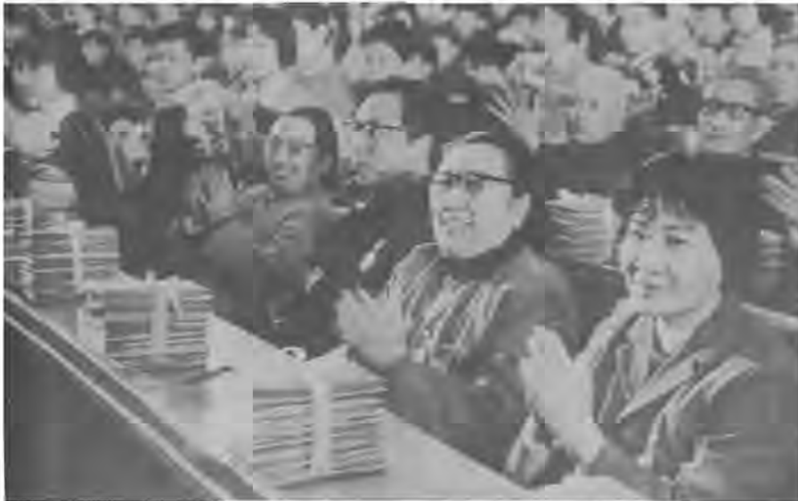
The Beijing Municipality held a meeting in the Great Hall of the People to commend teachers with 30 years of experience in education.