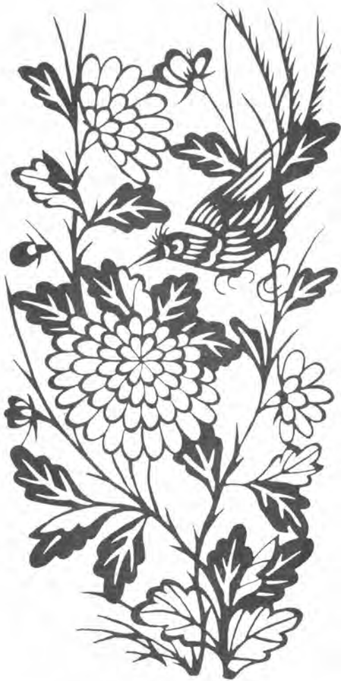
Papercut for a window.