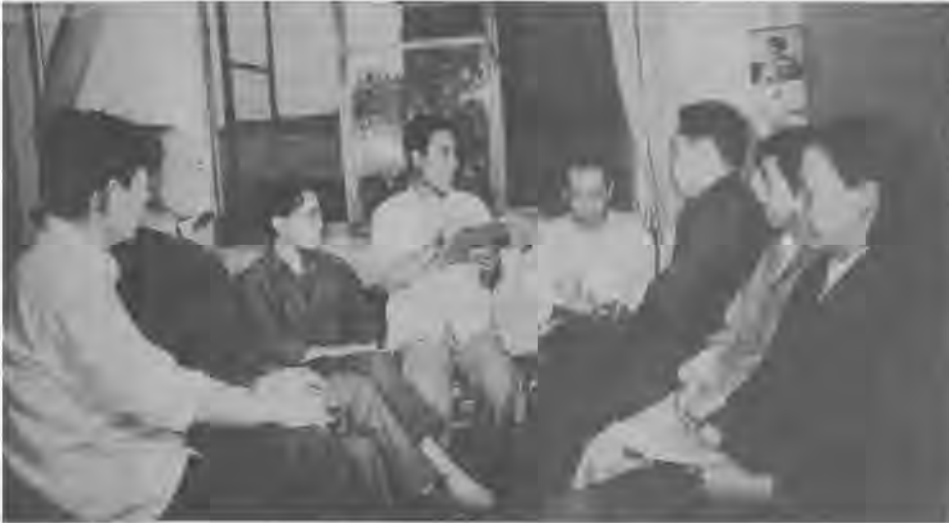
Beijing lawyers prepare a defence in a criminal case.

1,086 letters from the people. It has seen a great increase in economic disputes, as well as enterprises asking for legal advice. Some cases have been rather complicated. These developments are considered a normal phenomenon following the establishment of the legal system.