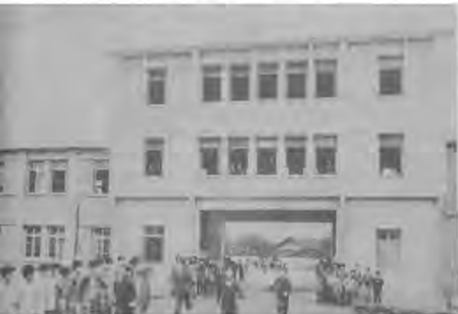
"Special tracks" in Putian County.