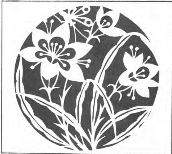
Pillow cover pattern.