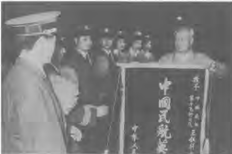
Vice-Premier Wan Li presents a banner reading "Heroic Crew of CAAC" to the hijacked airliner personnel.