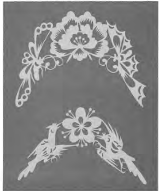
Pattern for shoe embroidery.