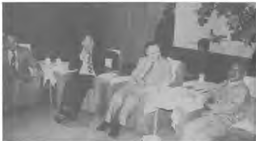
Hu Yaobang meets Louis Van Geyt and members of his delegation.

On the policy of the Chinese Communist Party, Hu said that socialist China will never occupy one inch of land of other countries. "This is the basic policy of our Party and our country," he said. "At the same time, we