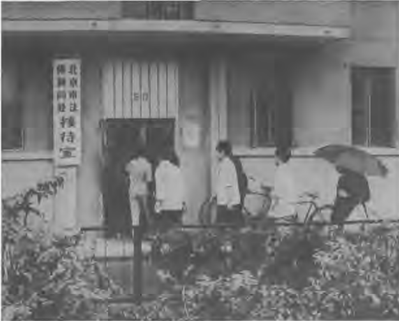
The legal advisory office in Beijing.

— It helps the judicial and educational departments to give professional legal training.