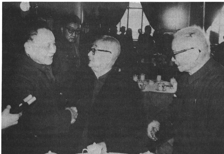
Deng Xiaoping talking with Zhou Jianren (middle), Chairman of the China Association for Promoting Democracy, and Ji Fang (right), Chairman of the Chinese Peasants' and Workers' Democratic Party, at a tea party on February 5, 1981.

handled properly in the draft. For instance, we properly approached the issue of whether to categorize Comrade Mao Zedong's errors as relating to the Party line. We decided not to refer to them in that way, taking into consideration the fact that such expressions as "the struggle between the two lines" and "errors relating to the Party line" were used incorrectly, indiscriminately and too often in the past. With hindsight I think many cases in the Party's history of two-line struggles, as we used to call them, clearly cannot be established. Two of them ought to be completely reversed. They are the case of Liu Shaoqi, Peng Zhen, Luo Ruiqing, Lu Dingyi and Yang Shangkun 31 and the case of Peng Dehuai, Huang Kecheng, Zhang Wentian and Zhou Xiaozhou 32 . The basic verdict in the case of Gao Gang and Rao Shushi remains unchanged, but this case can hardly be categorized as a struggle between the two lines. Luo Zhanglong was said to have committed errors relating to the Party line, but frankly, I think this way of categorizing it fails to hit the nail on the head. What Luo Zhanglong actually did was to engage in factional strife, split the Party and form another Party central committee. The case of Gao Gang and Rao Shushi is of a similar nature though, of course, they didn't go so far as to form another Party central committee. Qu Qiubai's errors lasted less than half a year and Li