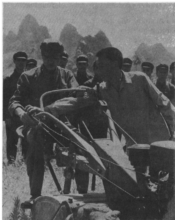
Soldiers learning how to drive a walking tractor in the suburbs of Guilin, Guangxi.

In the past, the jobs of cooks, stockmen and pack-animal drivers were the last things a soldier wanted to do. But today they are looked upon in a totally new light. A growing number of demobilized army cooks are able to pass