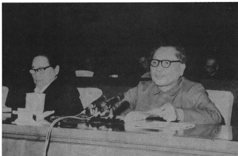
Deng Xiaoping speaking at the meeting on the Party's theoretical work on March 30, 1979. Soong Ching Ling is on the left.

During the "cultural revolution," we achieved much success in our relations with