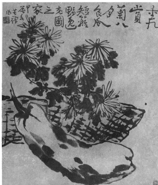
Daisies and Pumpkin.