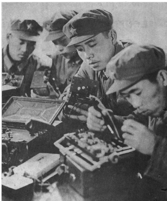
Soldiers of a PLA company learning about electrical machinery.

Training classes were established at the regimental, battalion and company levels. Many soldiers doubled as students of both military and civilian skills. Some served as teachers in one class and became learners in another; 403 people were chosen as part-time teachers.