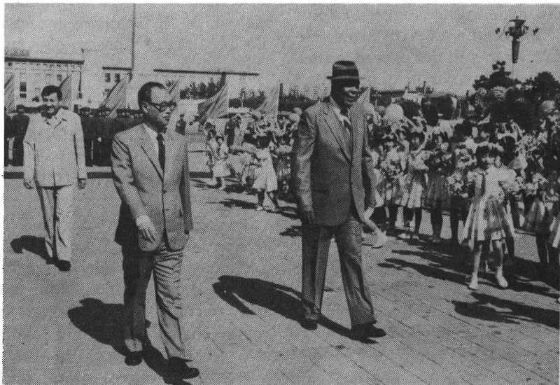
Beijing children give Prime Minister Bird a rousing welcome.

President Li Xiannian, meeting with Prime Minister Bird on July 23, said that Central America should rid itself of the interference of the superpowers, and that Central American issues should be settled by the Central American people themselves.