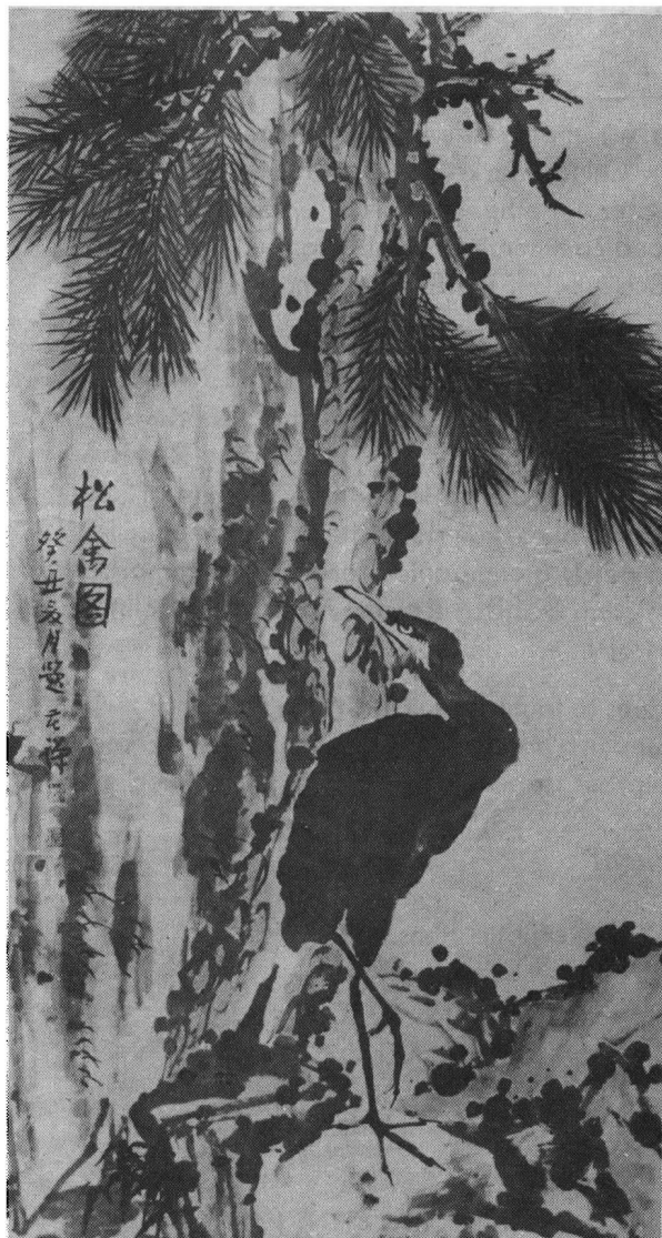
Pines and Stork.