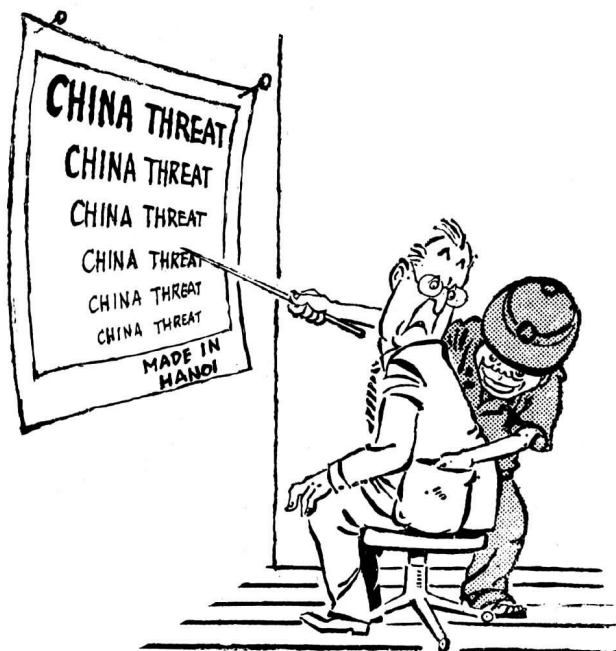
Beware of the pickpocket!

Third, Viet Nam insists that the security of all the Indochinese countries must be guaran-