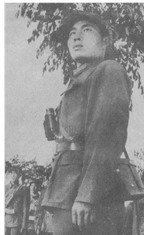
A young PLA commander.