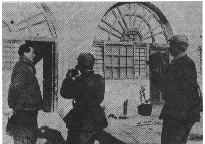
Film workers at work on the newsreel "Life in Yanan" in the Date Garden in spring 1946.

The studio is helping to promote international understanding of China. It produces numerous series that cover the development of China's socialist construction as well as its