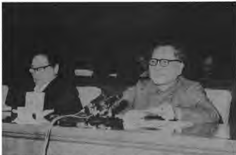
Deng Xiaoping speaking at the meeting on the Party's theoretical work on March 30, 1979. Soong Ching Ling is on the left.

During the "cultural revolution," we achieved much success in our relations with