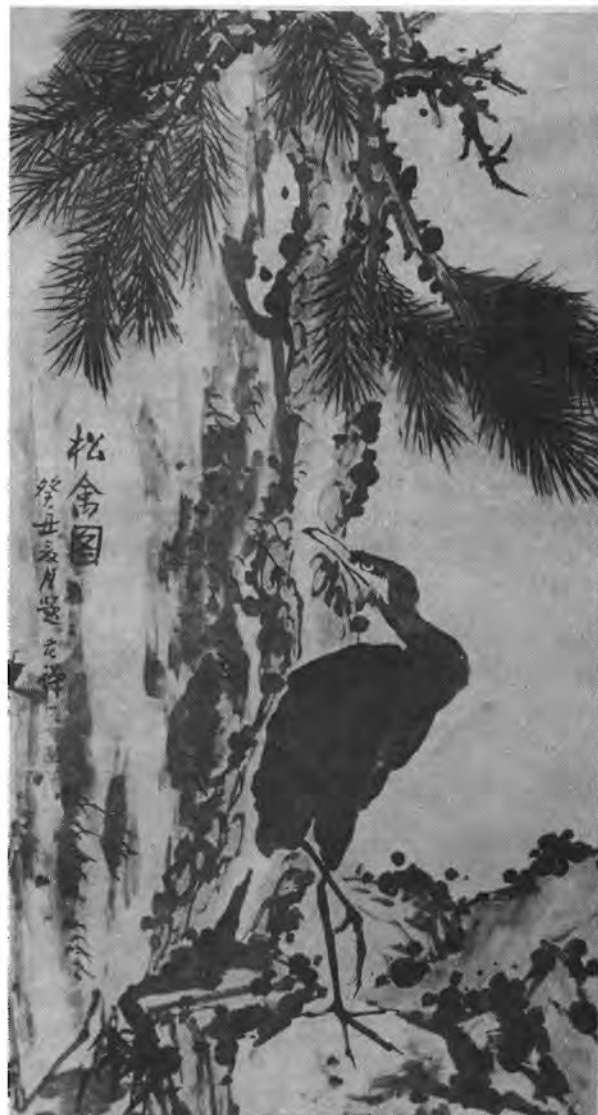
Pines and Stork.