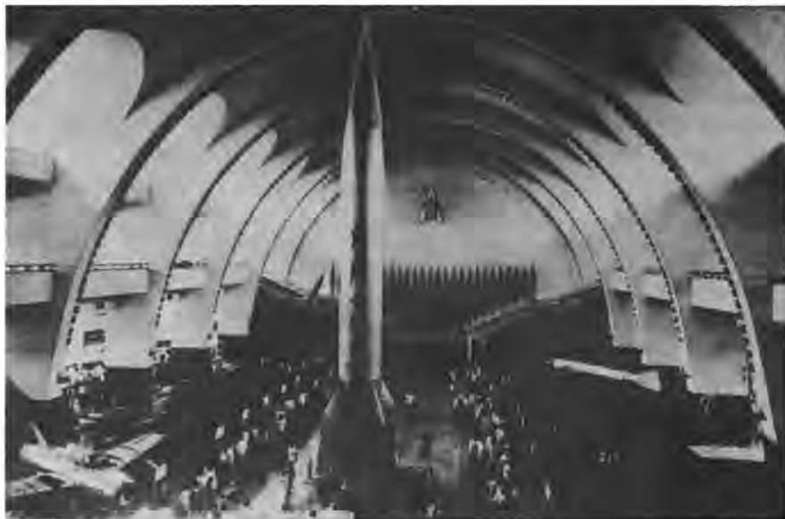
Towards modernization of national defence — arms displayed at the Military Museum of the Chinese People's Revolution in Beijing.

A: Since the founding of the People's Republic, many army units have entered the cities and moved into barracks. Their contacts with the masses have become relatively less frequent. Moreover, many forms through which the army