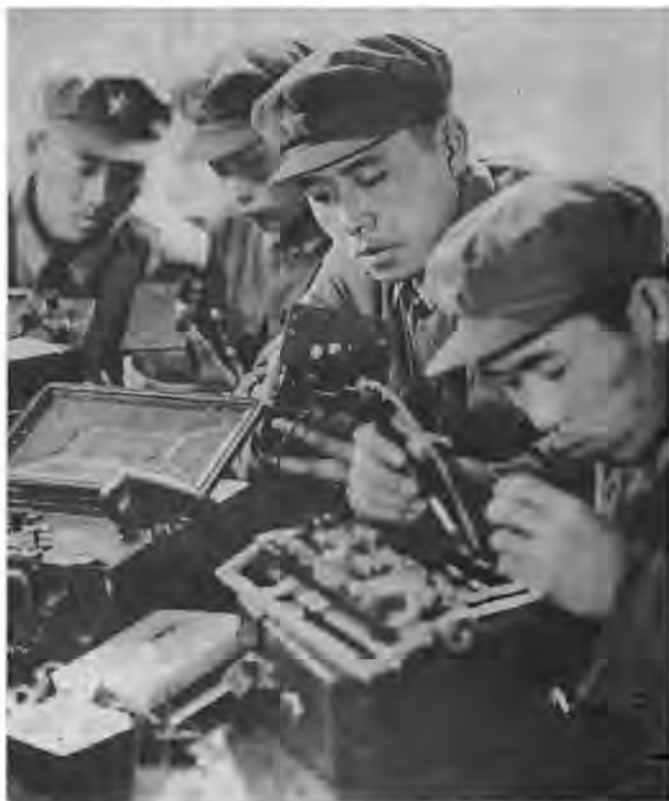
Soldiers of a PLA company learning about electrical machinery.

Training classes were established at the regimental, battalion and company levels. Many soldiers doubled as students of both military and civilian skills. Some served as teachers in one class and became learners in another; 403 people were chosen as part-time teachers.