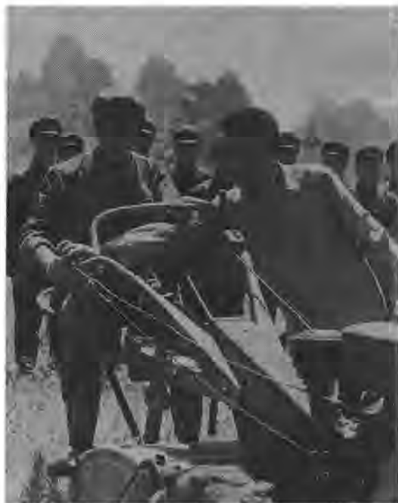
Soldiers learning how to drive a walking tractor in the suburbs of Guilin, Guangxi.

In the past, the jobs of cooks, stockmen and pack-animal drivers were the last things a soldier wanted to do. But today they are looked upon in a totally new light. A growing number of demobilized army cooks are able to pass