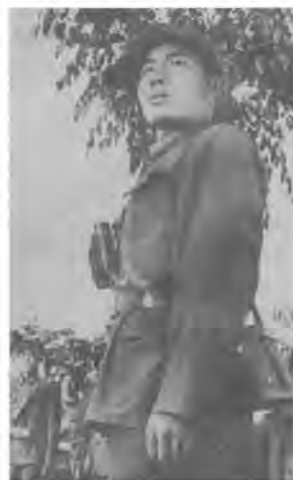
A young PLA commander.