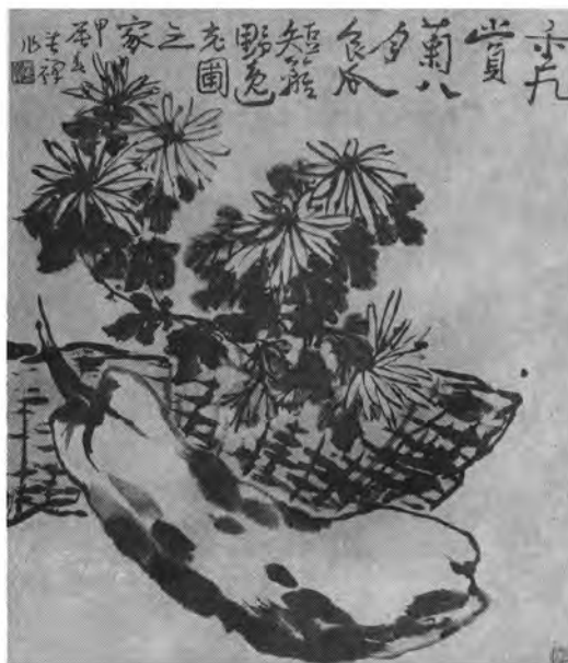
Daisies and Pumpkin.