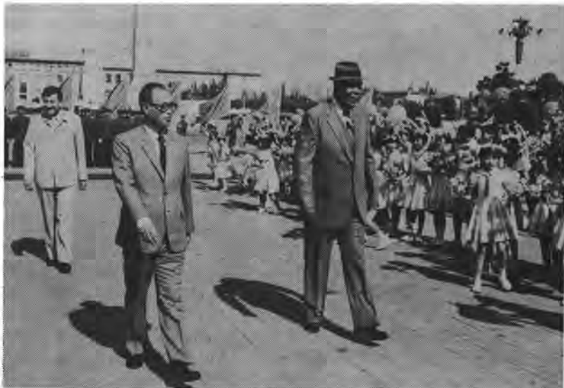
Beijing children give Prime Minister Bird a rousing welcome.

President Li Xiannian, meeting with Prime Minister Bird on July 23, said that Central America should rid itself of the interference of the superpowers, and that Central American issues should be settled by the Central American people themselves.