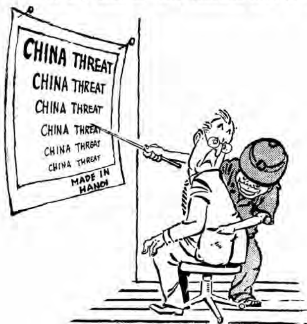
Beware of the pickpocket!

Third, Viet Nam insists that the security of all the Indochinese countries must be guaran-