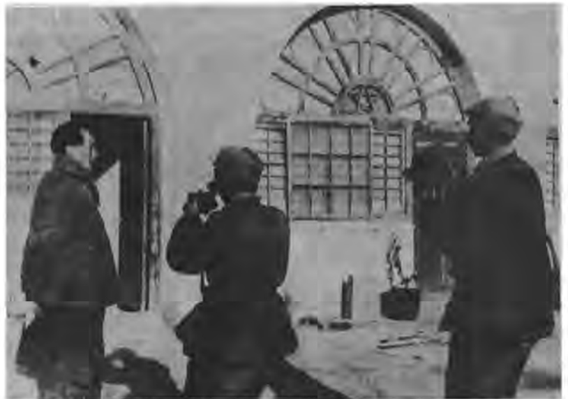
Film workers at work on the newsreel "Life in Yanan" in the Date Garden in spring 1946.

The studio is helping to promote international understanding of China. It produces numerous series that cover the development of China's socialist construction as well as its