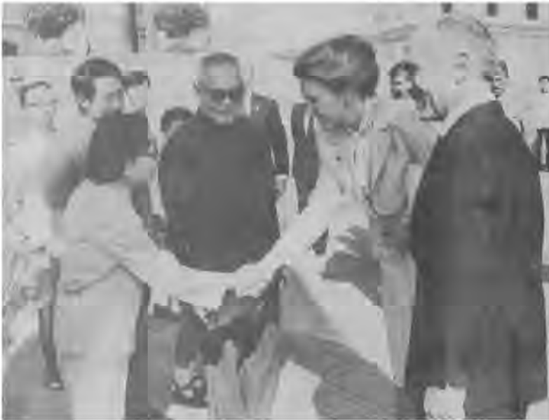
President Li Xiannian and his wife Lin Jiamai welcome King Hussein and Queen Noor al-Hussein.

Palestine Liberation Organization will seek common grounds, put aside their differences and unite to fight their enemy.