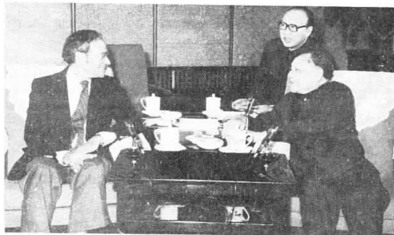
Deng Xiaoping met with Frank Press in January 1980.