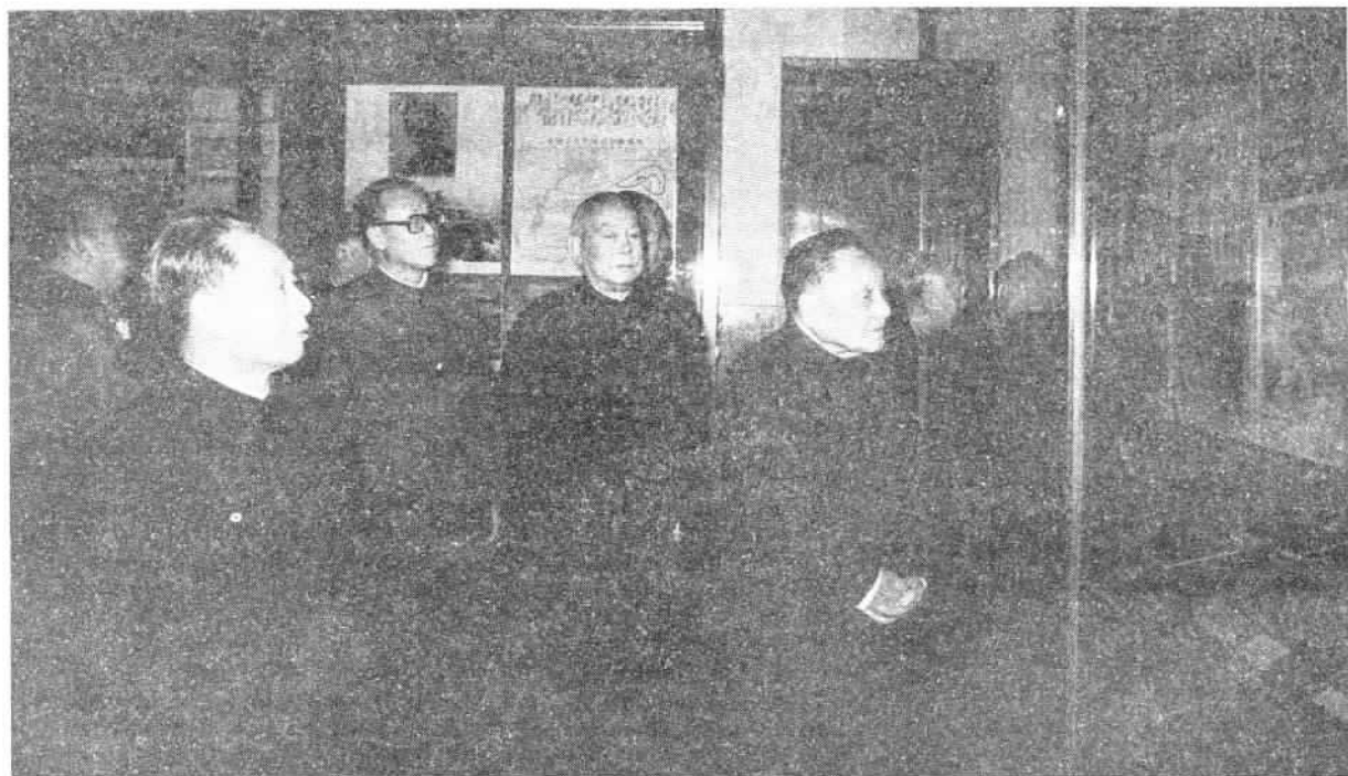
Hu Yaobang, Deng Xiaoping and others visit the room commemorating Mao Zedong's revolutionary deeds.