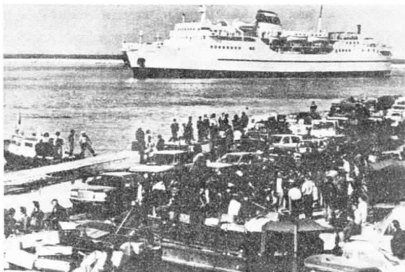
One of the five ships evacuating Arafat and PLO fighters from Tripoli.