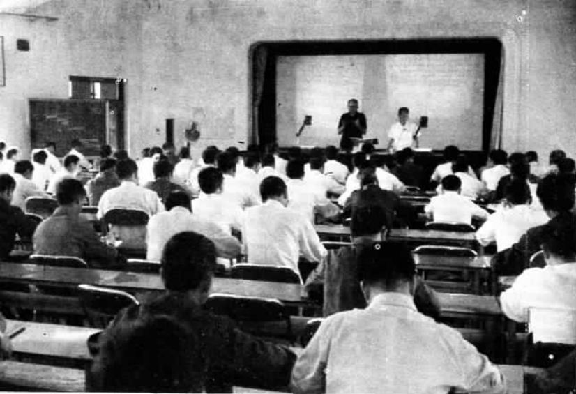
An American professor lectures at the Chinese Training Centre of Science and Technology Management set up last year.