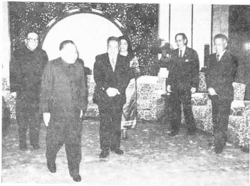
Deng Xiaoping meets with Norodom Sihanouk, Madame Sihanouk, Son Sann and Khieu Samphan of Kampuchea.

However, the State Statistical Bureau pointed out that clothing standards for the Chinese people are still low. Efforts must be made to increase production of cotton and synthetic fibres, and to turn out more and better fabrics of all kinds.