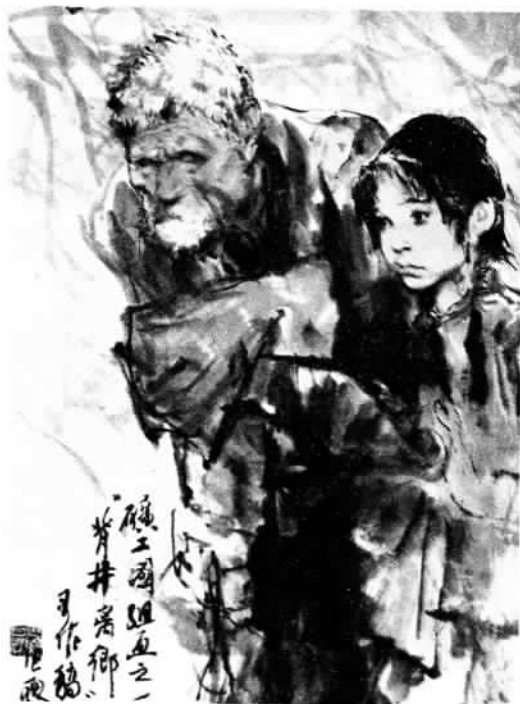
An old miner and his daughter forced to leave their home in the old society.