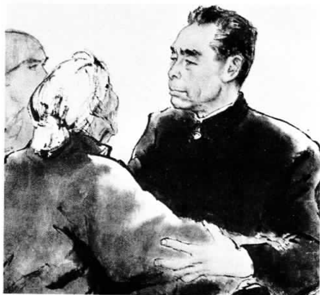
Between the people and the premier.