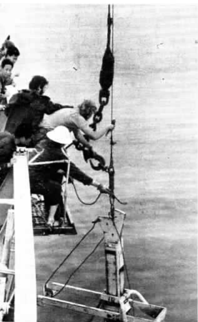
Chinese and American marine scientists jointly survey the East China Sea in June 1980.