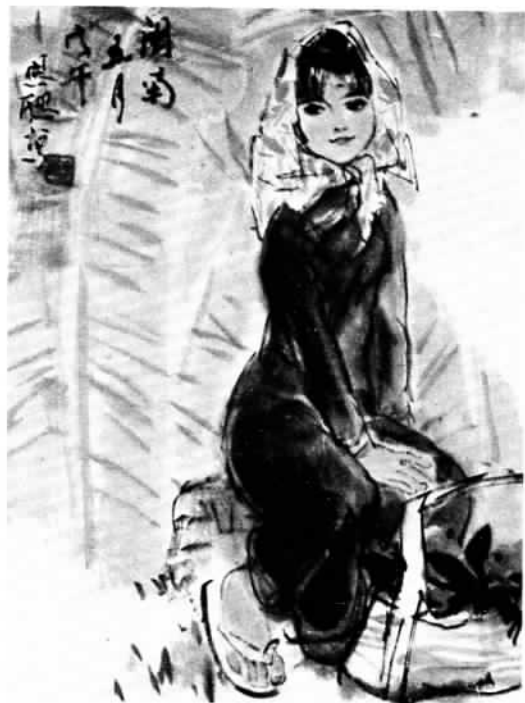
May in southern Fujian.