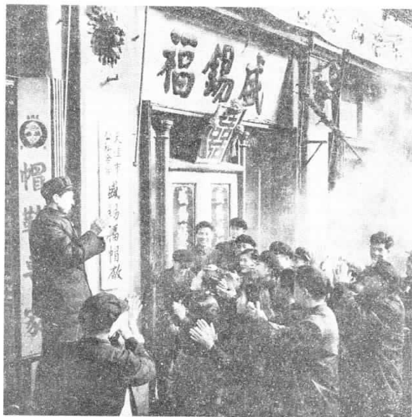
Workers and staff celebrating the Shengxifu Cap Factory's change into a joint state-private enterprise in 1956.

Comrade Mao Zedong criticized some people in the Party who negated the dual character of the national bourgeoisie and who