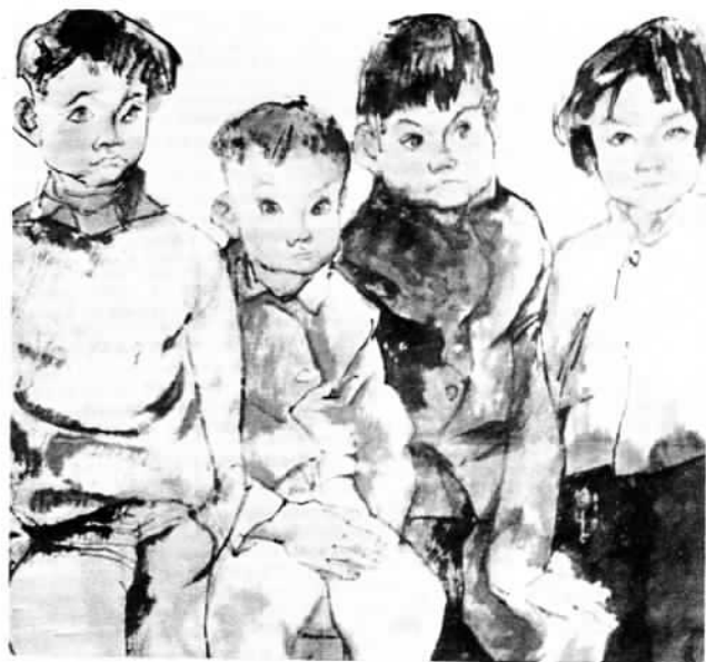
Children of the miners.