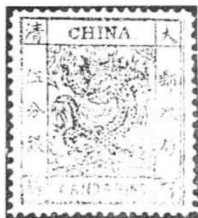
The earliest Chinese stamps issued in the Qing Dynasty.

Many foreign stamps were also on exhibit. A member of the exhibition evaluation committee, Chang Zengshu, showed his collection on Rowland Hill, the origina-