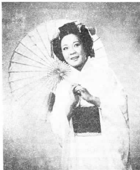
Ji Xiaoqin as Cio-Cio San in "Madame Butterfly."