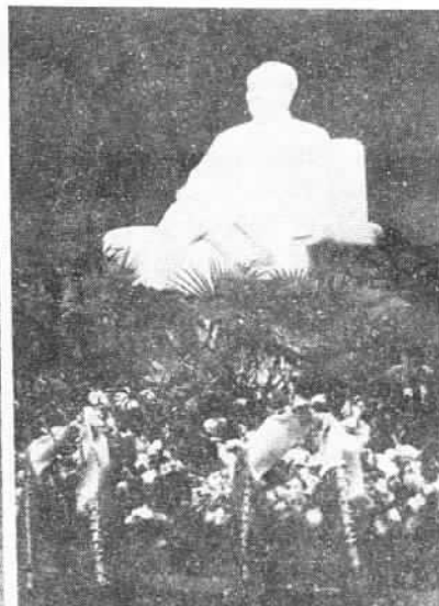
Chinese Party and state leaders stand in silence before the seated statue of Mao Zedong.