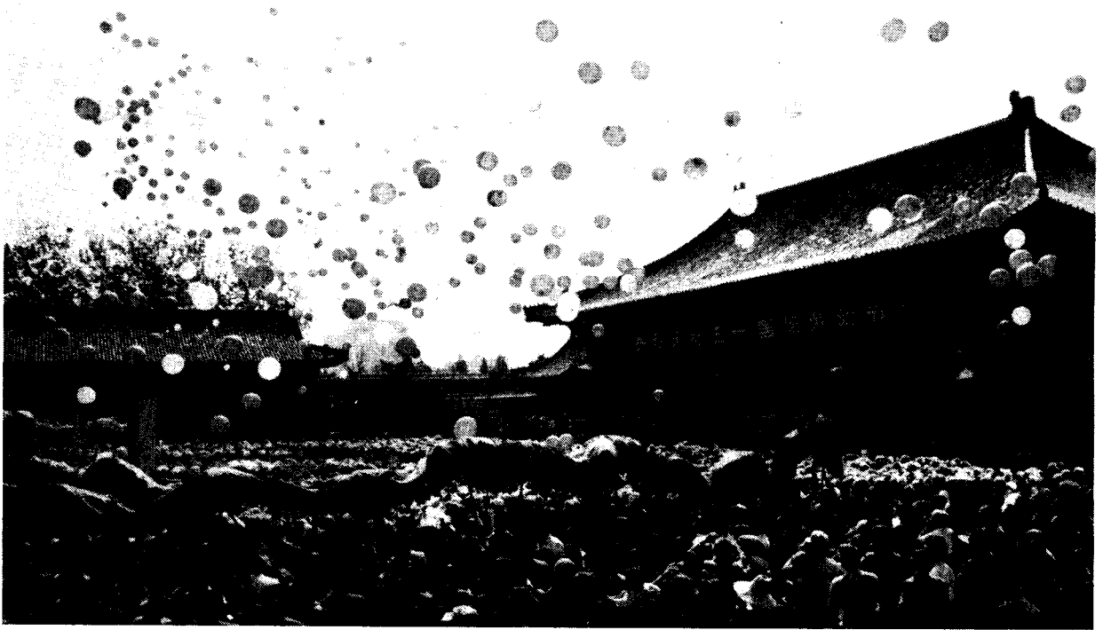
Gala celebrations at the Beijing Working People's Palace of Culture.

husband asked her to keep her job a secret. "I know some people see my work as dirty and humble," she said. "I think one's reputation is not measured by what she does but by how much she can contribute to society."