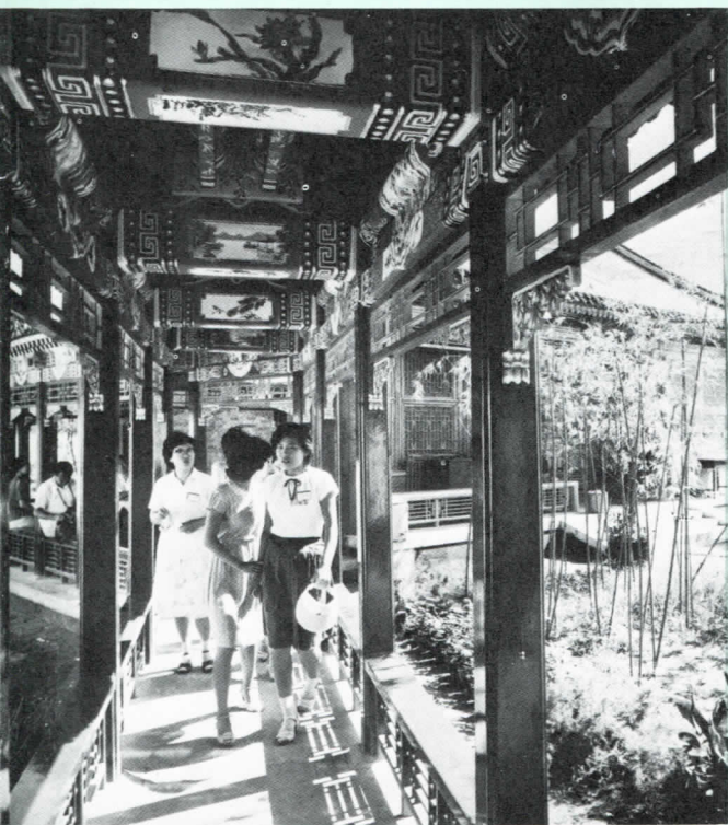
An elaborate walkway in the Bamboo Lodge, quarters for the novel's heroine, Lin Daiyu.