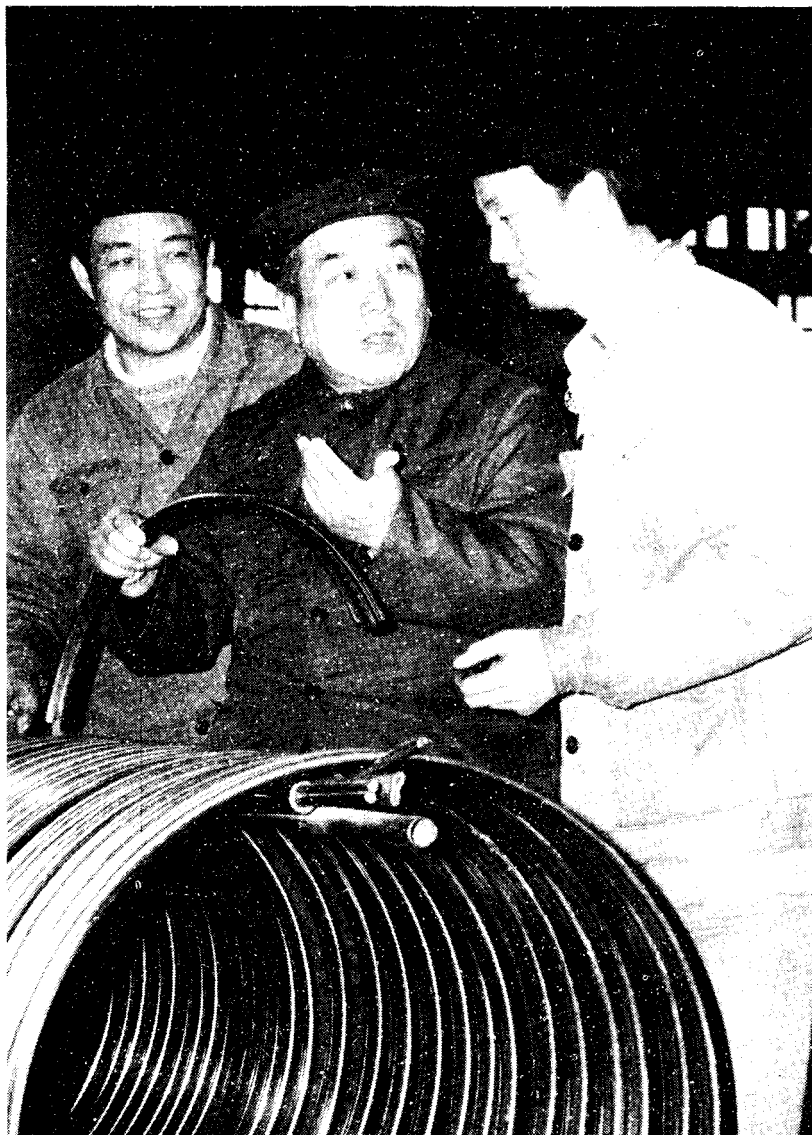
The Changchun Bicycle Factory has a technological co-operation agreement with the Tianjin Bicycle Factory, which has helped it make its products more salable and turn a profit. Here technicians of the two factories swap their experiences.

It should be noted that because of its large population China does have an employment problem. Its economic strength is also limited, its need to pick up production and construction and improve its standard of living is ever-mounting. It is impossible for the state-owned sector to meet all these needs by itself. As the modernization programme unfolds, it is necessary to mobilize the forces of the state-owned, the collective and the individual sectors to spur the economy on.