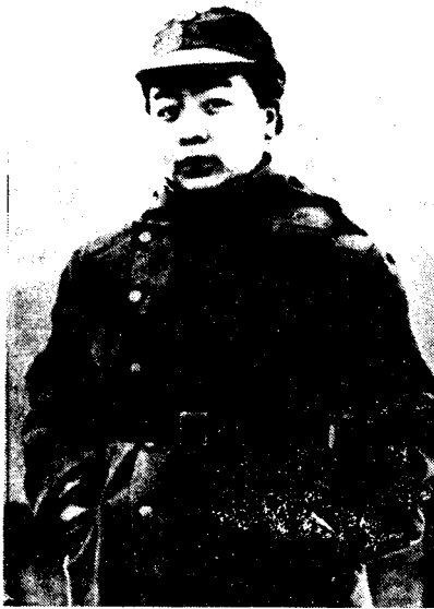
Ding Ling during the anti-Japanese war.

During her 60-year career as an author, Ding wrote many works that were loved by readers. Her writings represented a new literary orientation, and in them she encouraged many young people to join the revolution. In her 3