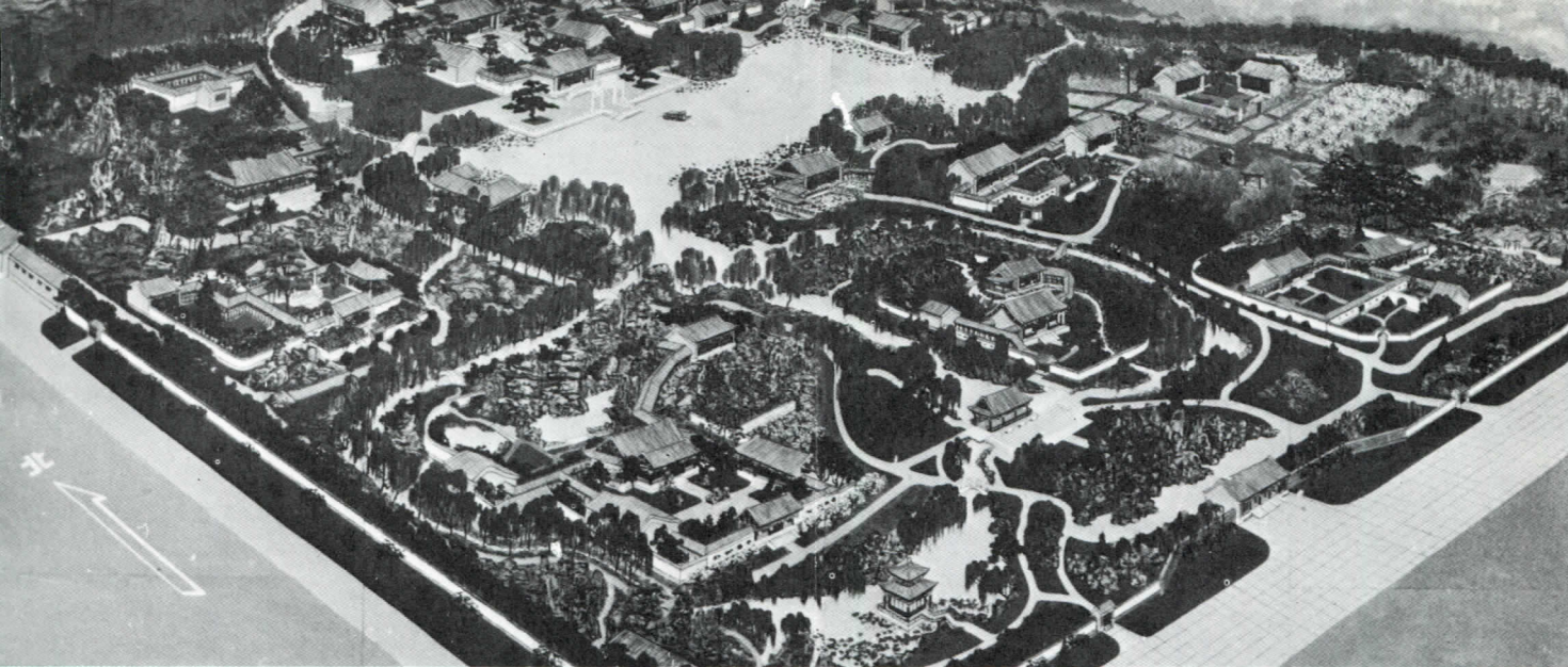
An aerial view of Grand View Garden.