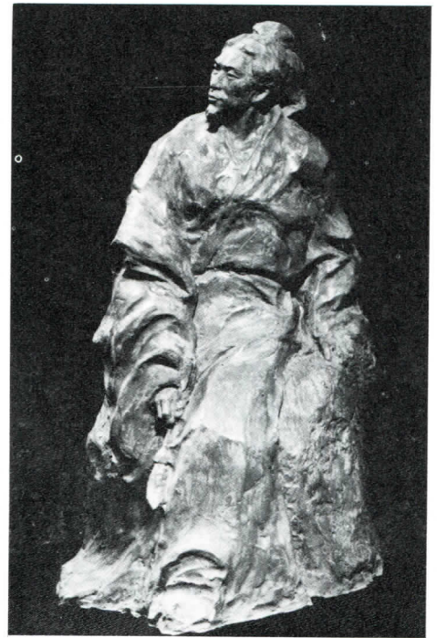
An Ancient Painter.