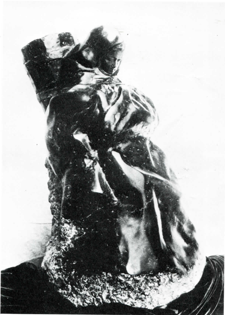
A Tibetan Woman.