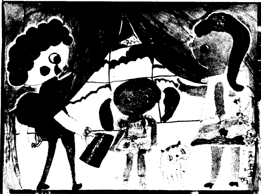
A child's painting: A Spoiled Only Child.

On the other hand—they have allowed their only children to become precious treasures, perhaps spoiling them to a point of no return. Parents today have high expectations of their children, and invest great sums in their children's intellectual development. But while they purchase endless books and toys for their kids and take them on numerous