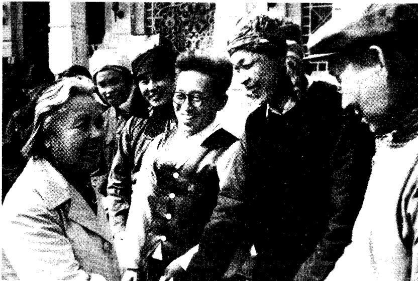
Ding greeting minority students at the Literary Institute under the Chinese Writers' Association in April 1981.

In May 1933 Ding was kidnapped by the Kuomintang in Nanjing, provoking protest and a rescue movement in which many Chinese and foreign celebrities,