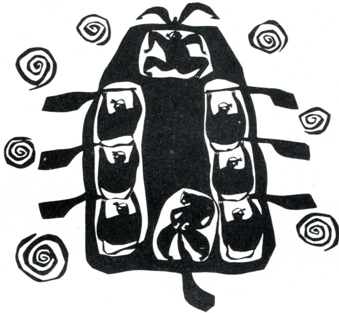
Crossing the Yellow River.