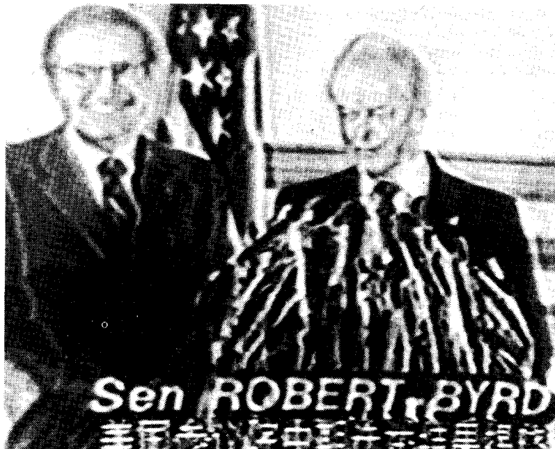
Senator Byrd campaigning in the US mid-term election.

Of all concerns, the economy is the biggest headache. A recent poll showed that 29 percent of voters are affected by unemployment, 20 percent are concerned about federal budget deficit, 17 percent about inflation, 15 percent about interest rates, and 10 percent about the foreign trade deficit. And the economic outlook is not so rosy. The growth rate for the first half of this year was only 2.2 percent, lower than expected, and there is no sign of any