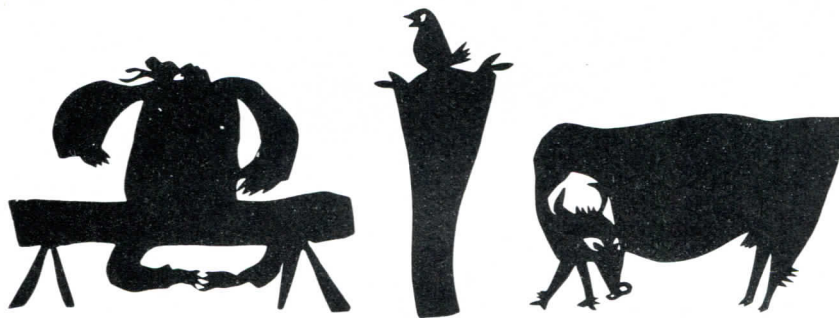
Play a musical instrument before a cow — satirizing those who do things without considering for whom they are done.