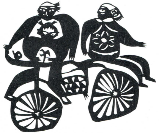
A peasant family going to visit relatives.