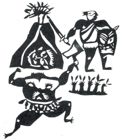
A legendary giant Xing Tian fights with the Emperor of Heaven for the throne of the universe. After being beheaded; Xing Tian continued fighting using his nipples as eyes and his navel as a mouth.