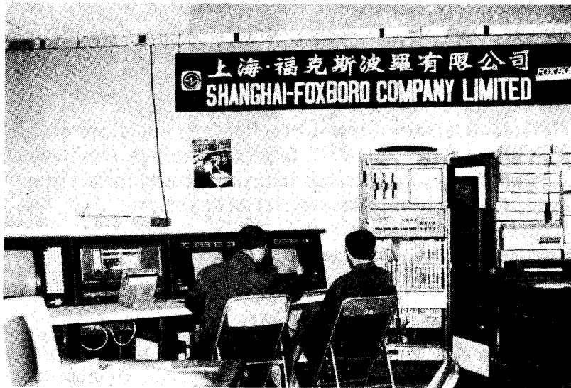
Technicians test the factory's products.

Most of the high-tech products manufactured by the Shanghai-Foxboro Company are in great demand in China. On Foxboro's suggestion Shanghai-Foxboro Marketing Service Co. was set up with Chinese funding in 1983, and is staffed with 60 people. It promotes sales of the joint venture's products in China and