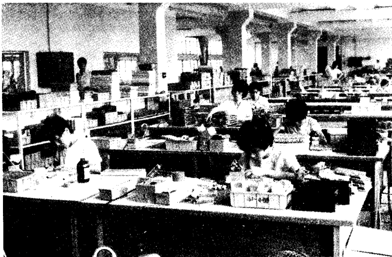
The assembly workshop.

In the last three years, the Shanghai-based joint venture imported from the United States