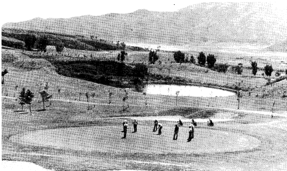
Beijing grassy golf course.