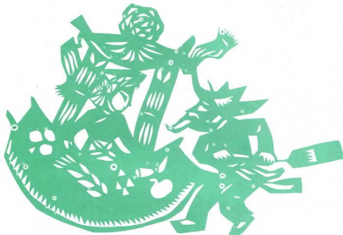
The Boating Folk Dance.

Combining traditional skills with her style of drawing she creates bold and vigorous modern-looking papercuts.