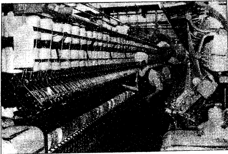
A workshop at the Beijing Wool Mill.