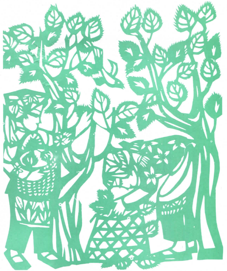
Picking Mulberry Leaves.