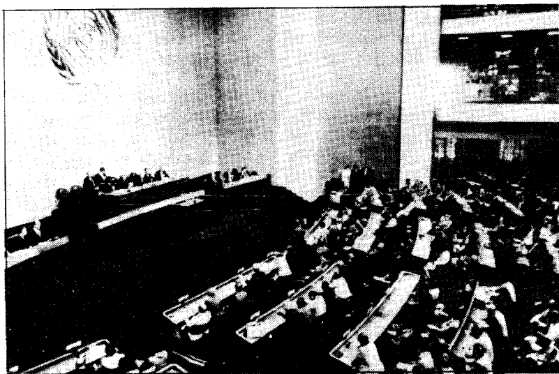
The seventh session of UNCTAD.

One major achievement during the session was the signing of Common Commodity Fund by the Soviet Union, which became the 94th country to join the fund. The fund was launched by UNCTAD in 1980 as a means to shield the developing countries from export losses caused declining raw material prices. Ratification by the Soviet Union of the fund agreement would bring the fund's total percentage of directly contributed capital to 65.26 percent, only 1.4 percent short of the required two-thirds.