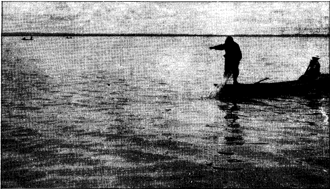
Breeding freshwater fish in Keluke Lake which is 2,800 metres above sea level.