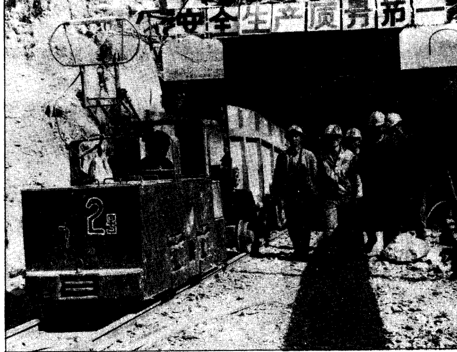
This tin-iron mine in northern Qaidam Basin is one of the largest in the country and is listed as a key state construction project.