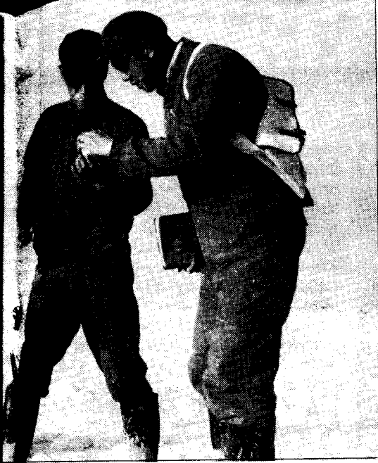
Scientists collecting ore samples in the Chahaner Lake area.