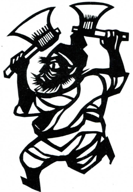
Local Opera Figure.