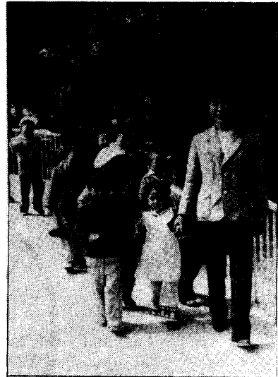
Tibetan kindergarten children in Lhasa.