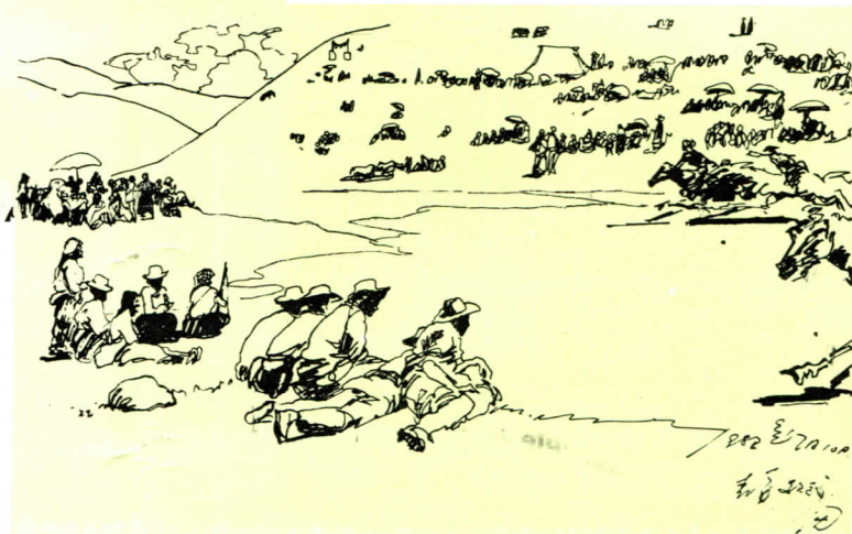
At the Races.

Shen, who specializes in the use of pen, creates works of easy accuracy and smooth vividness.