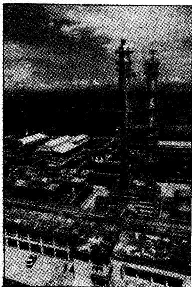
A chemical fertilizer plant in Pakistan.

In the course of its hard, 40-year struggle, Pakistan has made gratifying achievements in all fields. Especially in the past 10 years, since President Zia ul-Haq took office, Pakistan has scored outstanding successes in building the country and improving its relations with other countries. Pakistan is currently carrying out its Sixth Five-Year Plan. In recent years the country's gross national product has been increasing at a rate of about 6 percent a year. In 1979 Pakistan became self-sufficient in grain, with a little for export. Per-capita income in 1986 was US$390, the highest in South Asia. Last year Pakistan had bumper harvests of cotton (more than 7 million bales) and wheat (nearly 14 million tons). It was the world's largest exporter of cotton (3.9 million bales). Oil production has also increased. Daily oil output increased to 47,000 barrels last year, which met 39 percent of domestic needs.