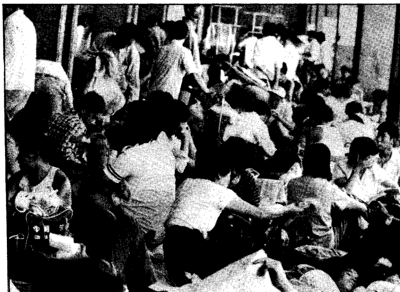
by YANG LIMING

Despite attempts to provide for increasing numbers of rail travellers, Beijing's railway station's waiting halls have been overflowing since July. People on their way to various meetings across the country, tourists and Chinese holiday-makers line the station's corridors.