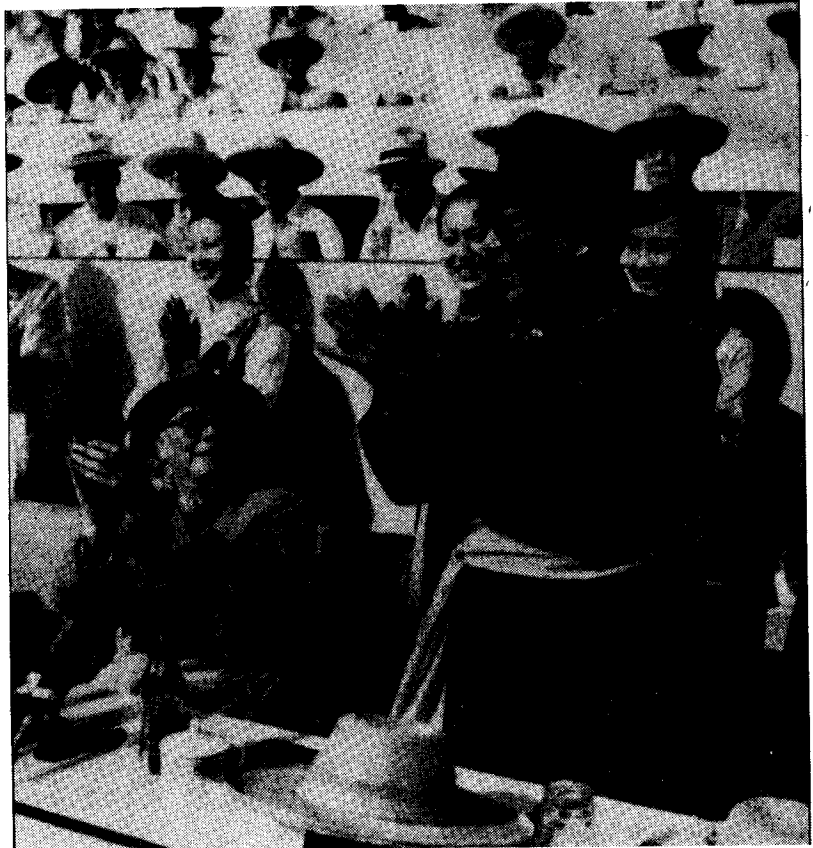
Ulanhu (left) and Xi Zhongxun (right) greeting participants at the mass gathering to celebrate the 40th anniversary of the founding of the region.

Ulanhu, head of the central government delegation to Inner Mongolia and vice-president of China, also a Mongolian, read to the gathering a message of greetings sent by the Central Committee of the Communist Party of China (CPC), the Standing Committee of the