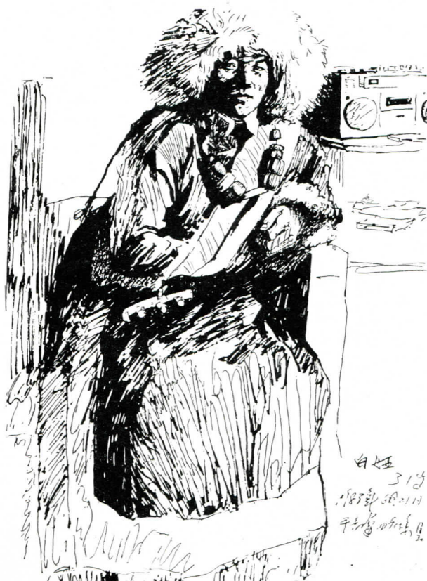
A Tietan Girl Listening to the Radio.