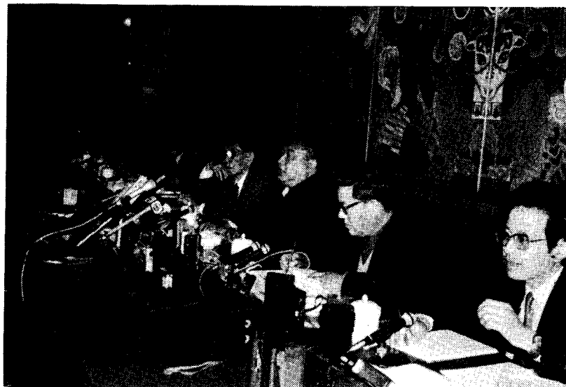
Ngapoi Ngawang Jigme (fourth right) and Bainqen Erdini Qoigy Gyaincain (third right) face the press.

Bainqen said: China's Constitution stipulates all nationalities in China are equal and all Chinese citizens enjoy freedom of religious