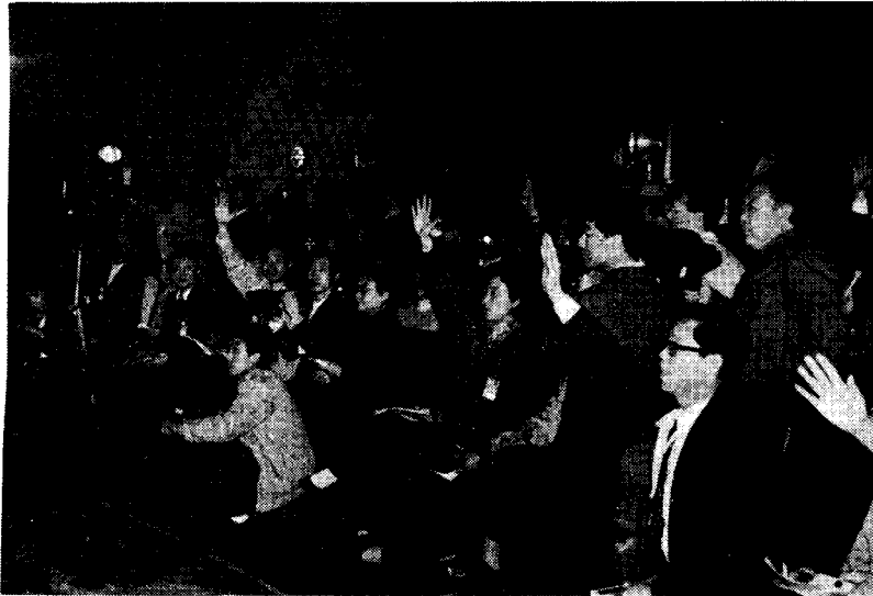
Chinese and foreign reporters at the press conference.

belief. Since the Third Plenary Session of the 11th CPC Central Committee in 1978, the central and local leadership has corrected many "Left" mistakes committed in the past. Development, however, is uneven in Tibet. "Leftist" ideas are still retained by some local officials in Tibet who grew up with this way of thinking. The presence of these people makes it difficult to ensure a thorough implementation of policies formulated by the central leadership.