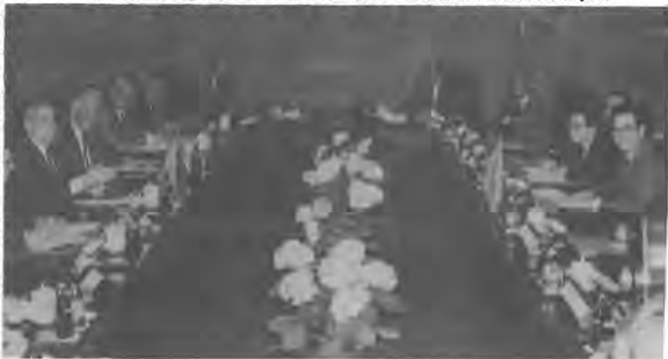
Chinese Premier Li Peng held talks with Soviet leader Mikhail Gorbachev on May 16.

They shared the concern and considered it essential that no civil war in Kampuchea should follow the complete Vietnamese troop withdrawal and that future Kampuchea should be an independent, peaceful, neutral and non-aligned state. To this end, they expressed support for national reconciliation with the participation of the four parties in Kampuchea. The Chinese side advocated the establishment in Kampuchea of a provisional quadripartite coalition government headed by Prince Sihanouk