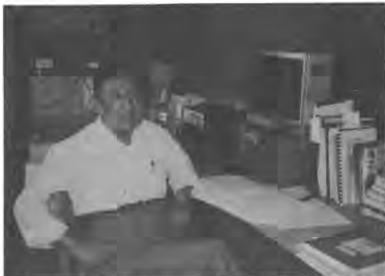
"Sex education transforms social traditions," says Professor Wu Jieping, chairman of the All-China Medical Association.

ported blood products. One of these four has already died.