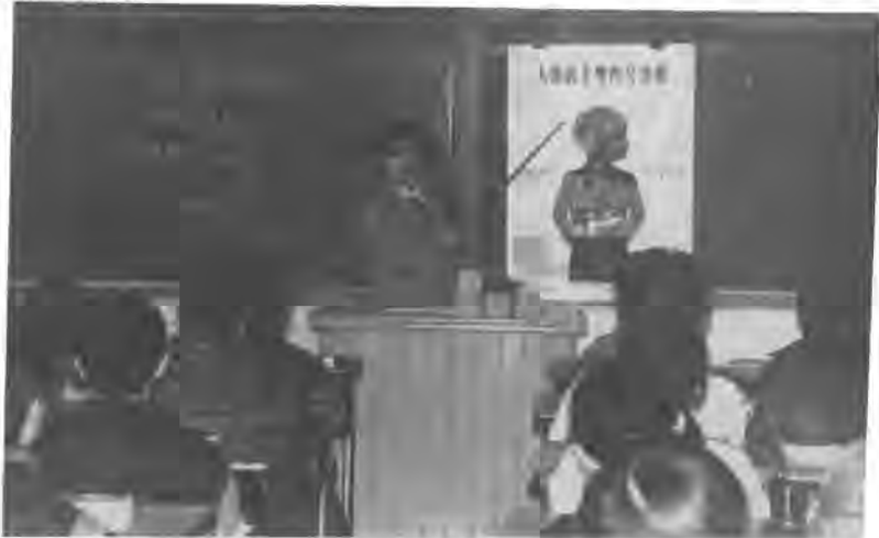
Reproductive studies: Students from the August 1 Middle School at a sex education lecture.

One of the main reasons for sex education is to help dispel the anxieties many young people suf-