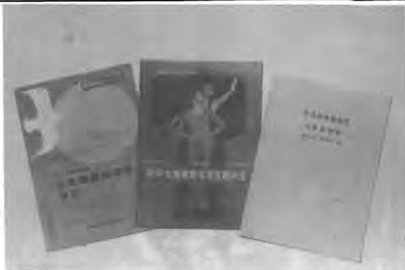
Sex education texts for middle school pupils.

Another problem that Xu's lessons have helped overcome has been the growing tendency of