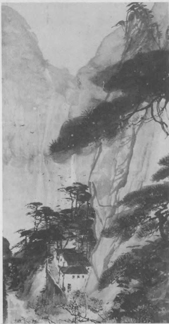
Tranquil Mountain Landscape.