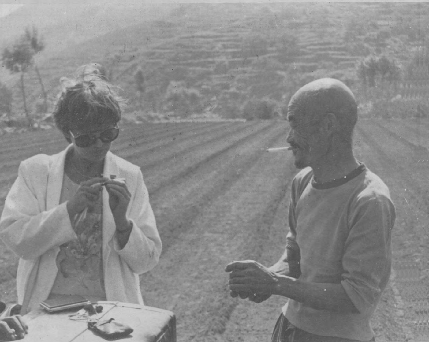
Tourists from abroad having a try at the long-stemmed Chinese pipe.