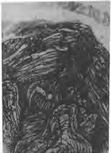
Two of Zhang's works.