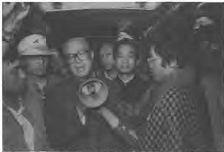
Zhao Ziyang comes to see fasting students on Tiananmen Square.

Leaders and the police showed restraint as hundreds of thousands of students marched without a permit down Beijing's main