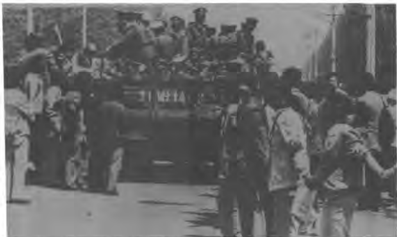
The students persuade the PLA troops to leave Beijing on May 20. YANG LIMING

The blocked PLA soldiers with Beijing residents on the evening of May 20. XUE CHAO