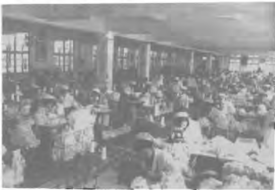
A workshop in the Quanzhou Glove Factory.