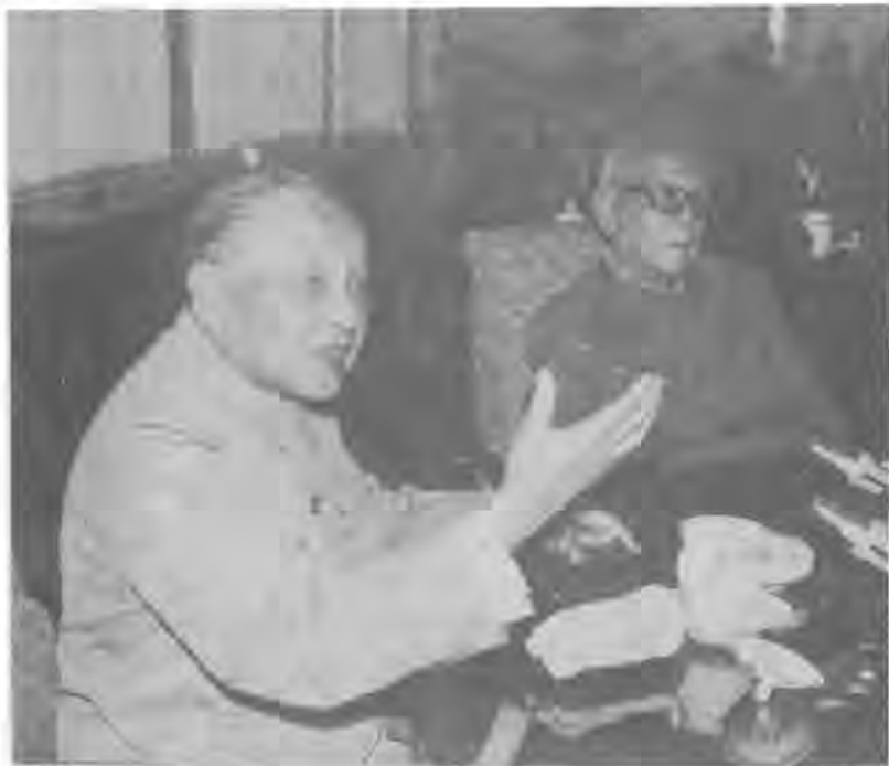
Deng Xiaoping meets the commanders of the PLA martial law enforcement troops. PLA CAMERAMAN