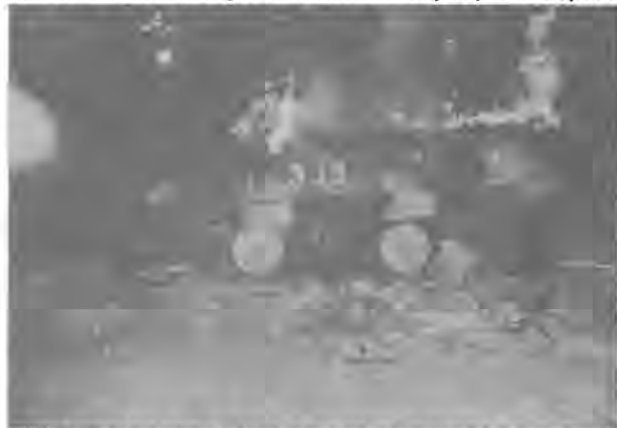
An armed vehicle burnt by rioters at Liubukou in Beijing on the evening of June 3.