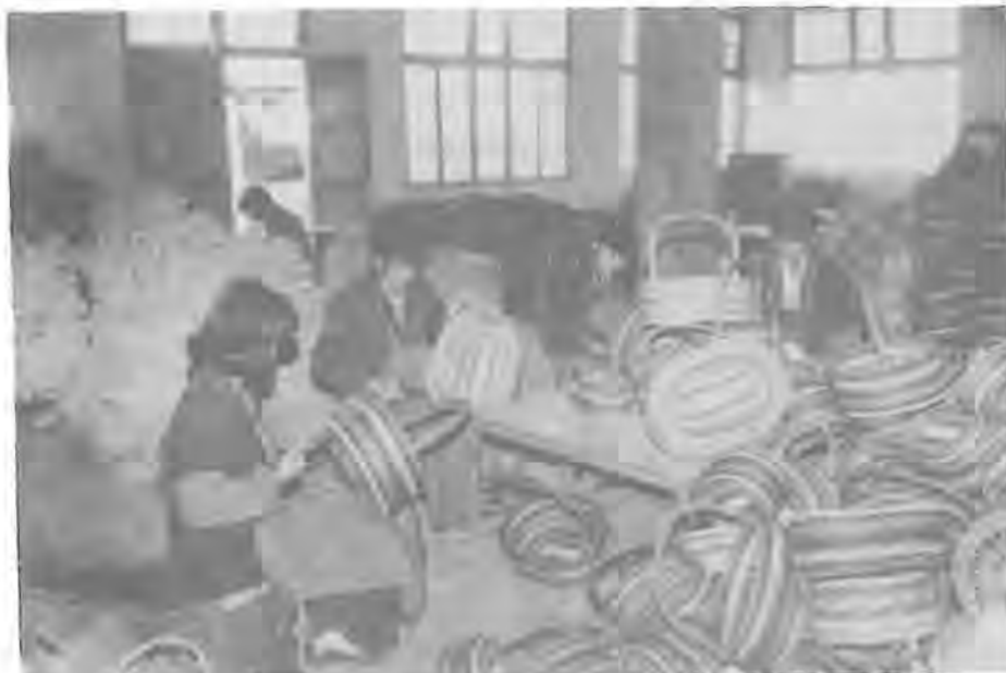
Weaving baskets in the Anxing Rattan-Work Co. Ltd.