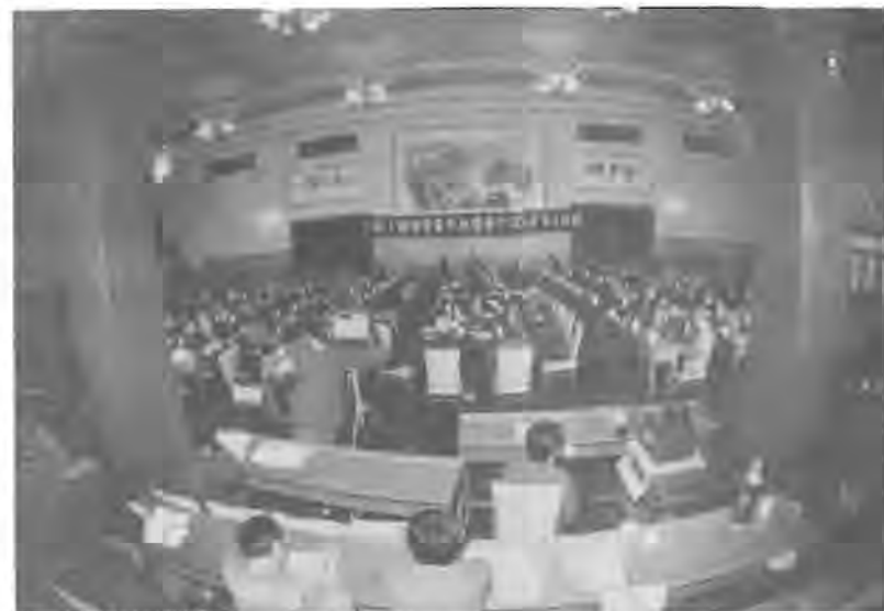
At the 10th enlarged leading group meeting on the feasibility study for the Three Gorges project.

In April 1986, some Party and government leaders led some officials of departments concerned to the Three Gorges for investigation. After finishing, they issued a circular pointing out that in view of some existing problems and some new suggestions raised recently, a deep-going feasibility study of the project should be carried out economically and technically. They hoped the study would be more