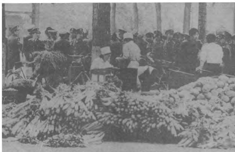
A greengrocer in Beijing's Fengtai District sent vegetables to martial law enforcement troops.