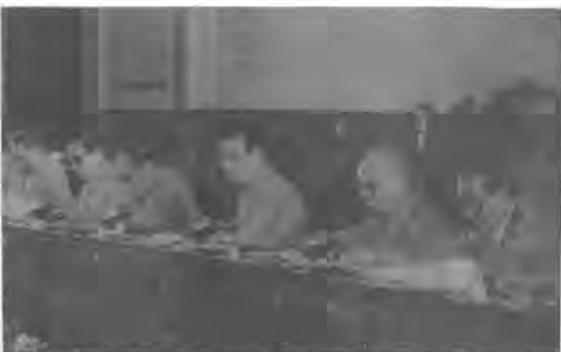
On the rostrum. From left: Song Ping, Qiao Shi, Jiang Zemin, Li Peng, Yao Yilin, Li Ruihuan.

pendence and self-reliance, plain living and hard work, and oppose bourgeois liberalization in real earnest; the fourth is to greatly enhance the building of the Party, democracy and legal system, resolutely penalize corruption, and accomplish a few things of popular concern so as to live up to the people's expectations of the Party.