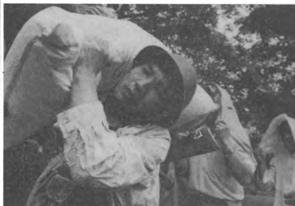
Martial law enforcement troops sent food grain to residents soon after they quelled the riot.