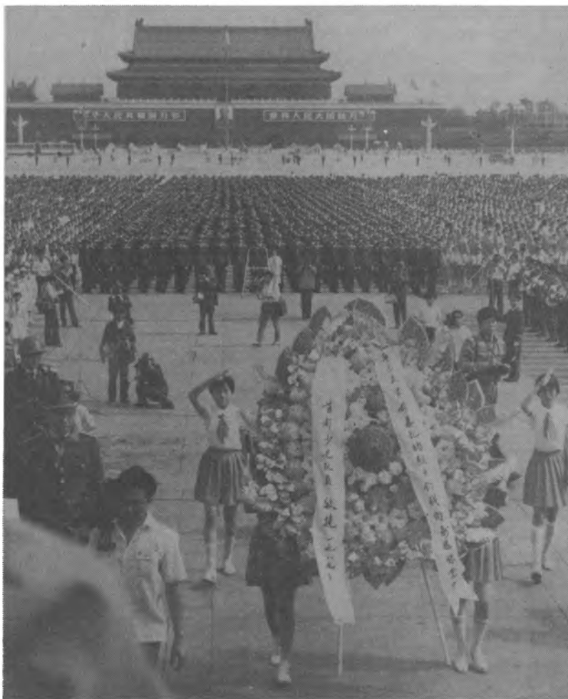
On June 17, 10,000 young pioneers of Beijing held a gathering with the theme "Love the Communist Party of China and love our socialist motherland" at the Tiananmen Square recently swept clean. Some officers and men of the martial law enforcement troops attended.