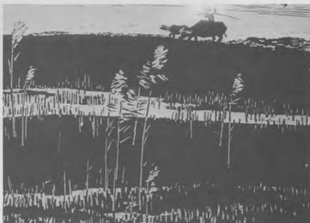
Herding in Autumn.