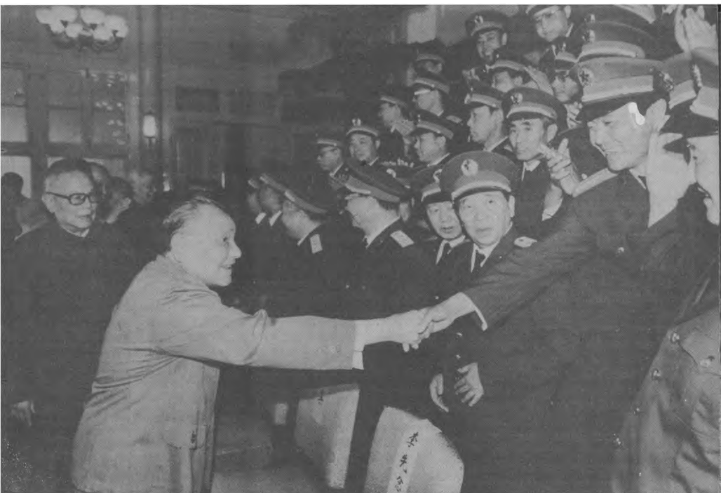
On June 9, Chairman of the Central Military Commission Deng Xiaoping received and made an important speech to army commanders and higher-ranked officers of the martial law enforcement troops in Beijing.