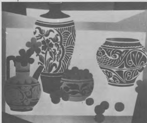
Song Dynasty Porcelain—a Still Life.