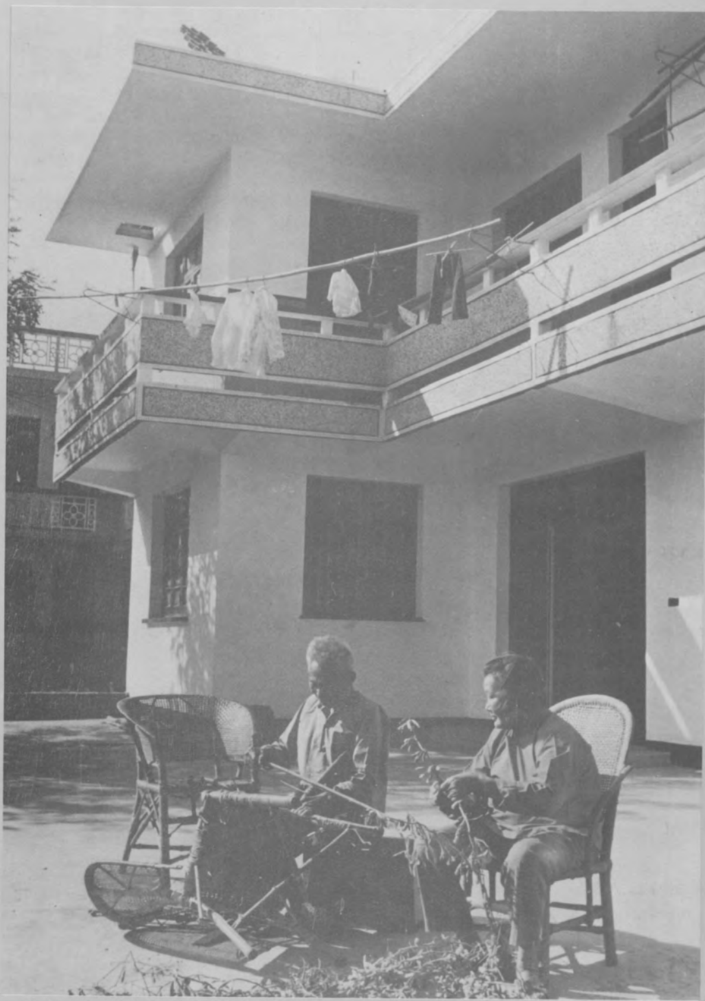
A farmer's new home.