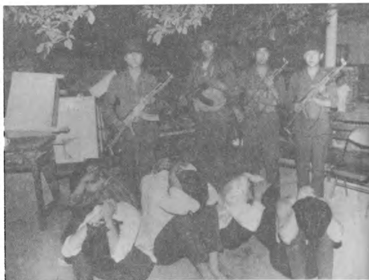
Some of the rioters were caught red-handed.