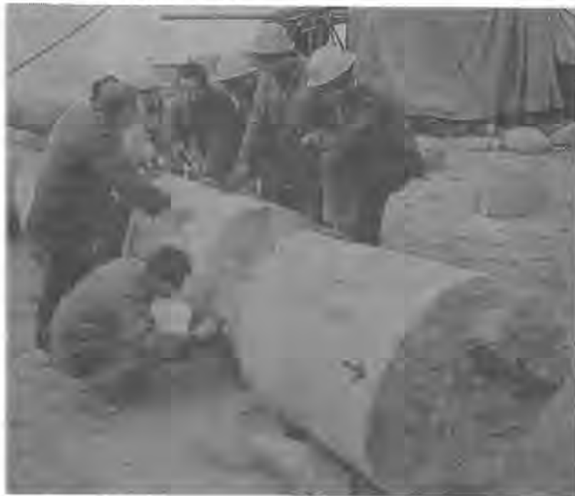
Heavy-calibre geological drilling.

The report concludes: The silt system in the Three Gorges can not perceptibly increase or decrease judging from research results, various angles and the present materials on silt. In recent decades, soil erosion in some areas along the upper reaches of the Changjiang River has increased, however, the annual silt discharge volume in the main stream as monitored at Cuntan and Yichang stations has not yet grown apparently, mainly because of a combination of factors in the upper reaches including geology, land forma-