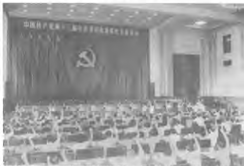
The Fourth Plenum of the 13th Central Committee of the CPC is in session.

The basic line of focusing on economic construction and the policy of upholding the four cardinal principles and adhering to the policy of carrying out economic reforms and opening to the outside world will also be fully implemented, according to the