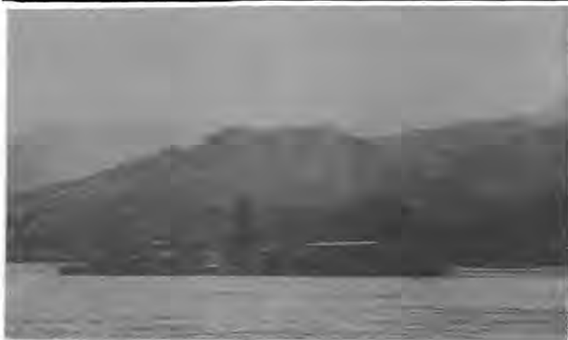
Drilling in the river.