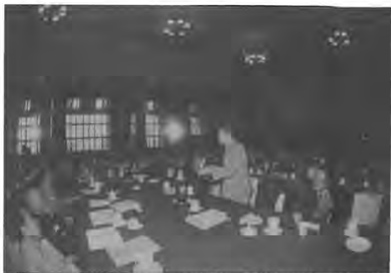
At a discussion, experts freely express their views on the Three Gorges Project.

At a normal water storage level of 175 metres, the number of migrants, according to a survey made in 1985, would be 725,500 people. In view of the natural increase in population from the year 1985 to 2008 (in reality, even later), and land occupied by migrants because of the moving of thickly populated cities and towns, the actual number of people who would need to move would reach 1.13 million. This is a big difference compared with the situation under the previous programme for a 150-metres wat-